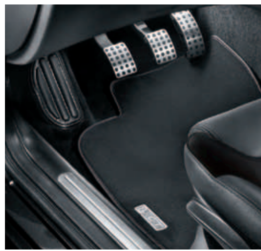
Aluminium sports pedals and kick plate