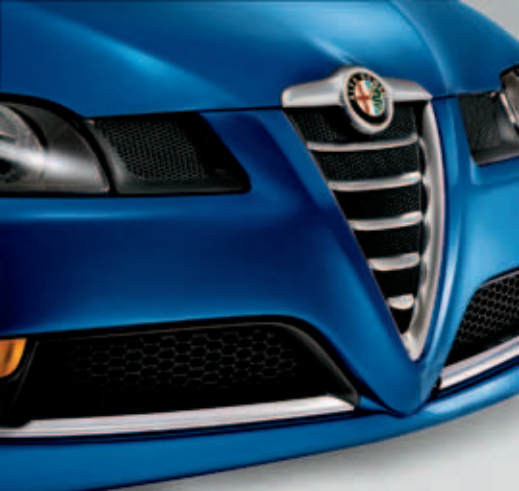
Satin effect front grille