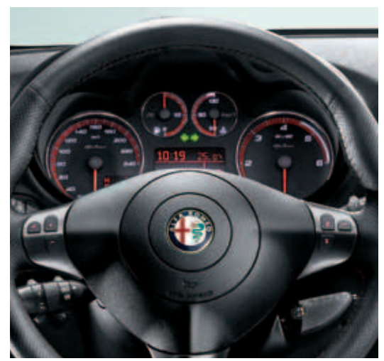
Instruments on black background with white lighting