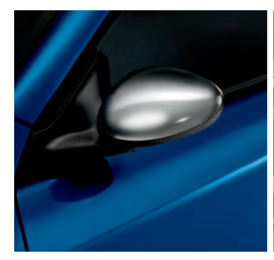
Satin effect side mirrors

The dynamic style continues in the cabin, with the aluminium sports pedals, kick plate. Black dominates with sports leather seats, leather steering wheel and black instrumentation – stylish and timeless. The Alfa GT Limited Edition is a perfect example of the passion that is at the heart of every Alfa Romeo.