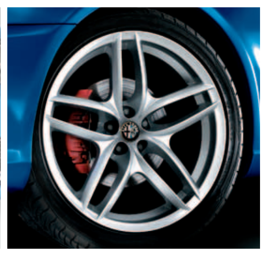
18" Alloy wheels and red brake calipers