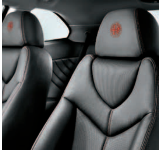
Sports leather seats with the Alfa Romeo logo