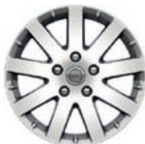
17-inch Aluminium Wheel