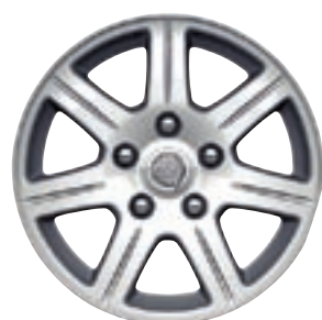
16-inch Aluminium Wheel