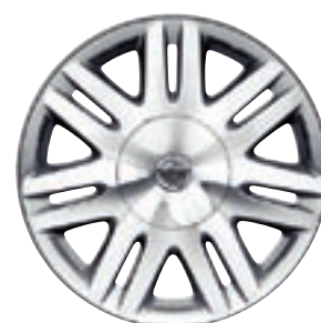
17-inch Chrome-Clad Aluminium Wheel (option on limited)