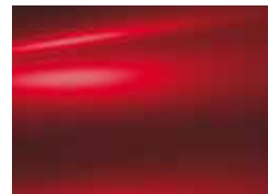
Rouge Babylone (P)