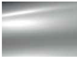
Gris Aluminium (M)