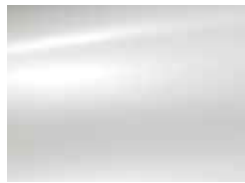
Blanc Banquise (S)