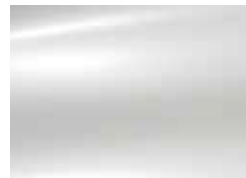
Blanc Nacre (PP)