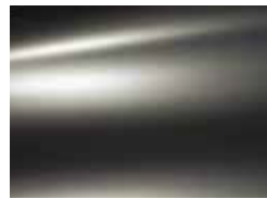
Gris Shark (M)