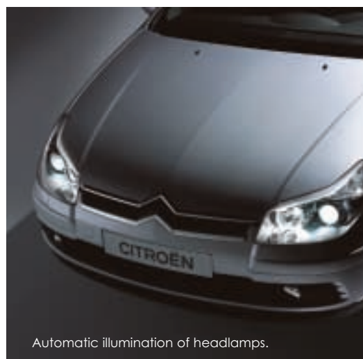
Automatic illumination of headlamps.

EuroNCAP. The New Look Citroën C5 achieved 36 from a maximum possible 37 points in the tough EuroNCAP independent crash tests, including full marks for the front impact test.