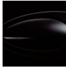
Noir Obsidien (Pearlescent)