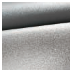
Luxury 'Matinal' Leather