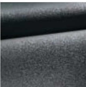
Luxury 'Tramontane' Leather