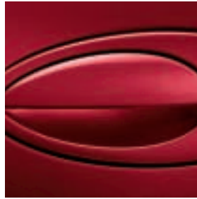
Rouge Profund (Pearlescent)