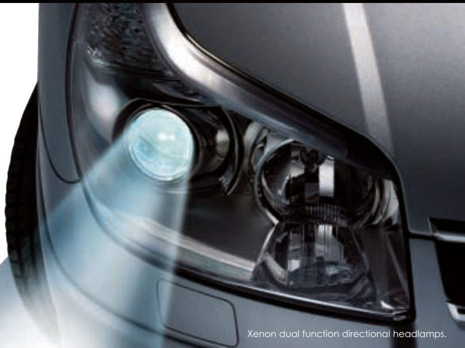
Xenon dual function directional headlamps.

*Optional by factory order on other versions.