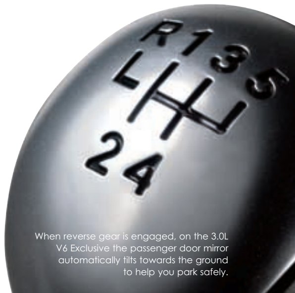
When reverse gear is engaged, on the 3.0L V6 Exclusive the passenger door mirror automatically tilts towards the ground to help you park safely.

Seats. The seating has been designed to promote maximum comfort and to minimise fatigue. Luxurious leather trim is standard across the range, with the leather four-spoke steering wheel adjusting for height and reach. The front seats are 8 way electrically adjustable with electric lumbar adjustment. The front head restraints are height and tilt adjustable. Even the folding armrests are fully adjustable, to help find the position most comfortable for you. The rear seats feature spacious high back comfort with a drop down centre armrest with storage and cup holders. The rear headrests are adjustable for height.