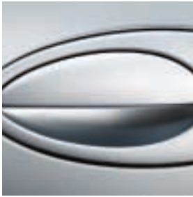
Gris Aluminium (Metallic)