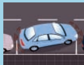
On the 3.0L V6 Exclusive, the front and rear electronic parking sensors, have both an audible and visual directional alert feature.