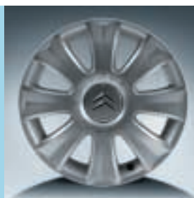
Suzuka 16" Alloy Wheels (3.0L V6 Exclusive)