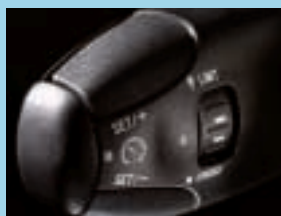
A speed limiter coupled with the cruise control prevents you from going beyond your set speed unless you deliberately "kick-down" the throttle or cancel it.