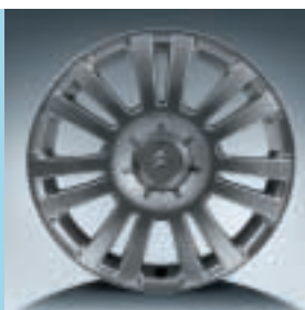
Hungaro 16" Alloy Wheels