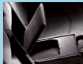
Multiple storage units and spaces help keep everything to hand; pictured above is the rear central armrest with storage area and cupholders.