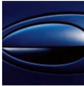
Bleu Oriental (Pearlescent)