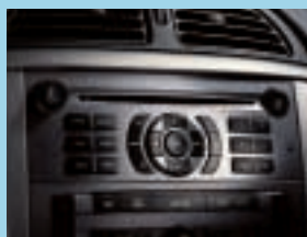
The audio volume adjusts itself automatically, to provide you with a consistent level of sound, irrespective of the speed at which you are driving.