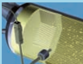
As part of the exhaust system, a state-of-the-art Particulate Filter periodically burns off the carbon particles that remain, virtually eliminating diesel smoke, thereby exceeding current EU environmental standards.