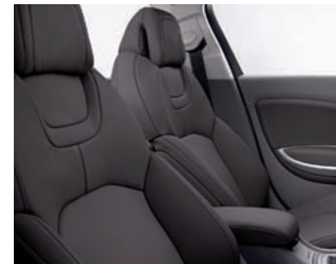
Full Leather upholstery (Mistral Black)