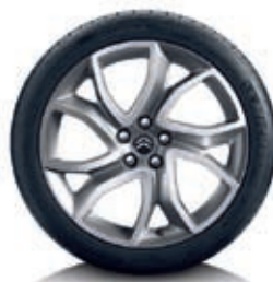
Adriatique 19" Alloy