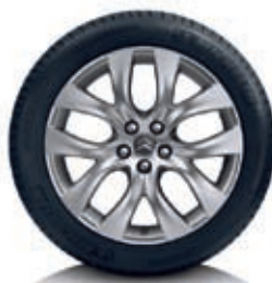
Atlantique 18" Alloy