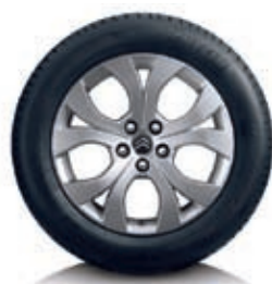
Baltique 17" Alloy

*Matinal Beige in Sport Leather/Cloth Trim upholstery is available by special order only.