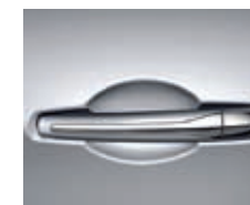
Gris Aluminium* (M)