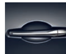
Gris Fulminator* (M)