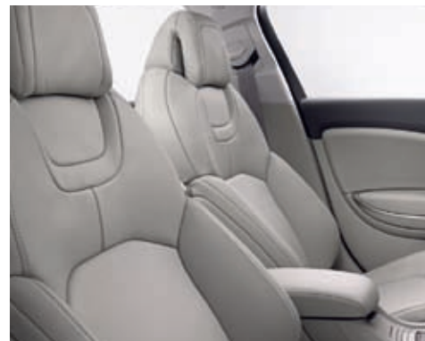
Full Leather upholstery (Matinal Beige)