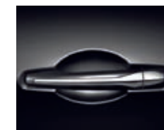
Noir Perla Nera* (P)