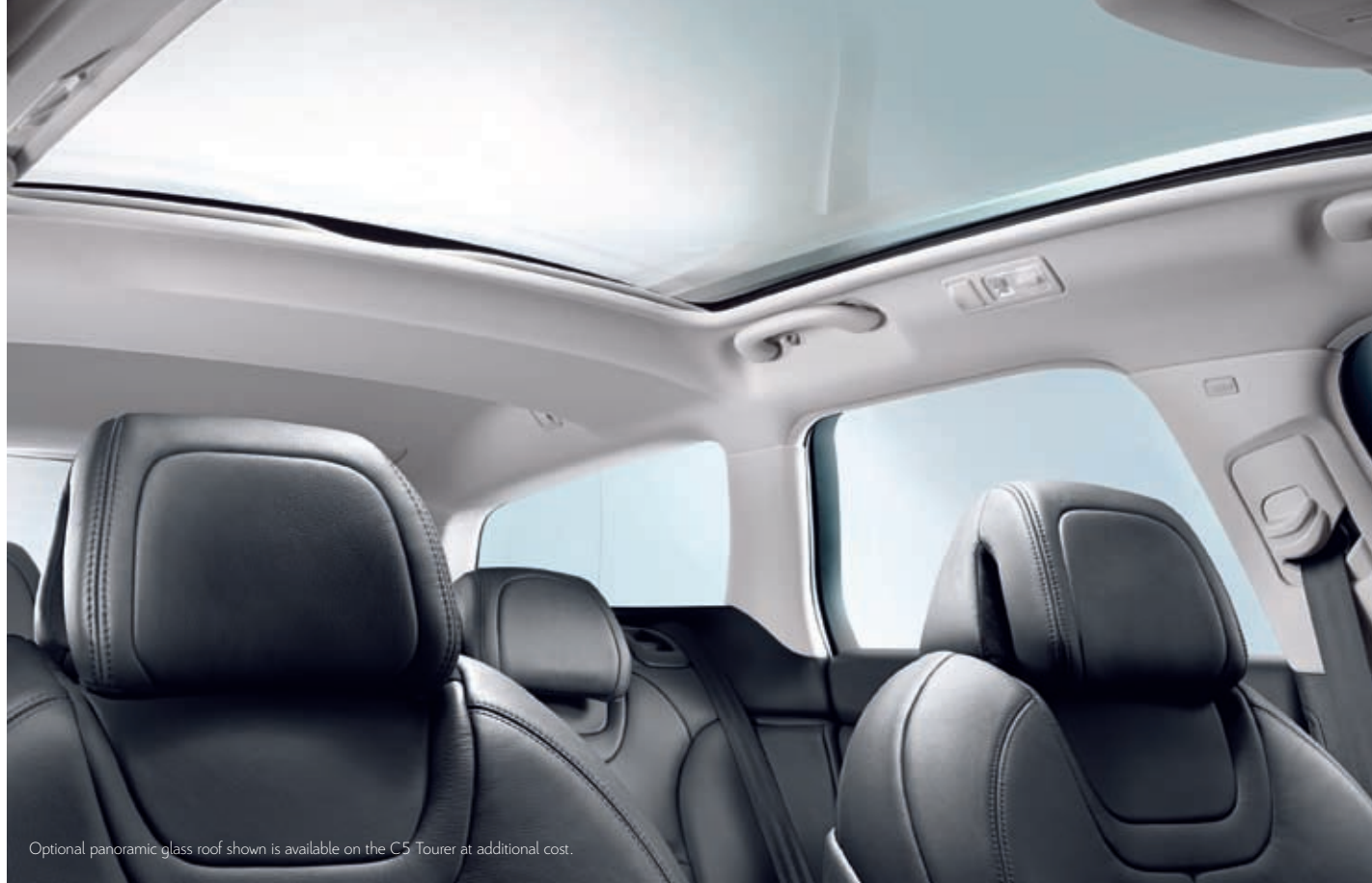
Optional panoramic glass roof shown is available on the C5 Tourer at additional cost.

An air quality sensor constantly monitors the air entering the cabin. As soon as the level of pollutants reaches a certain level, for example in city traffic, it isolates the cabin by automatically activating the air recirculation function.