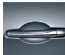
Gris Thorium* (M)