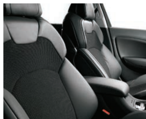
Sport Leather/Cloth upholstery (Mistral Black) (also available in Matinal Beige by special order only)