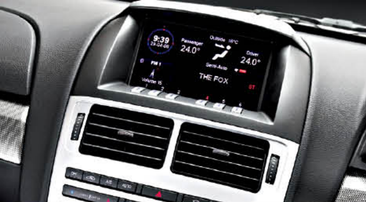
Premium audio sound system