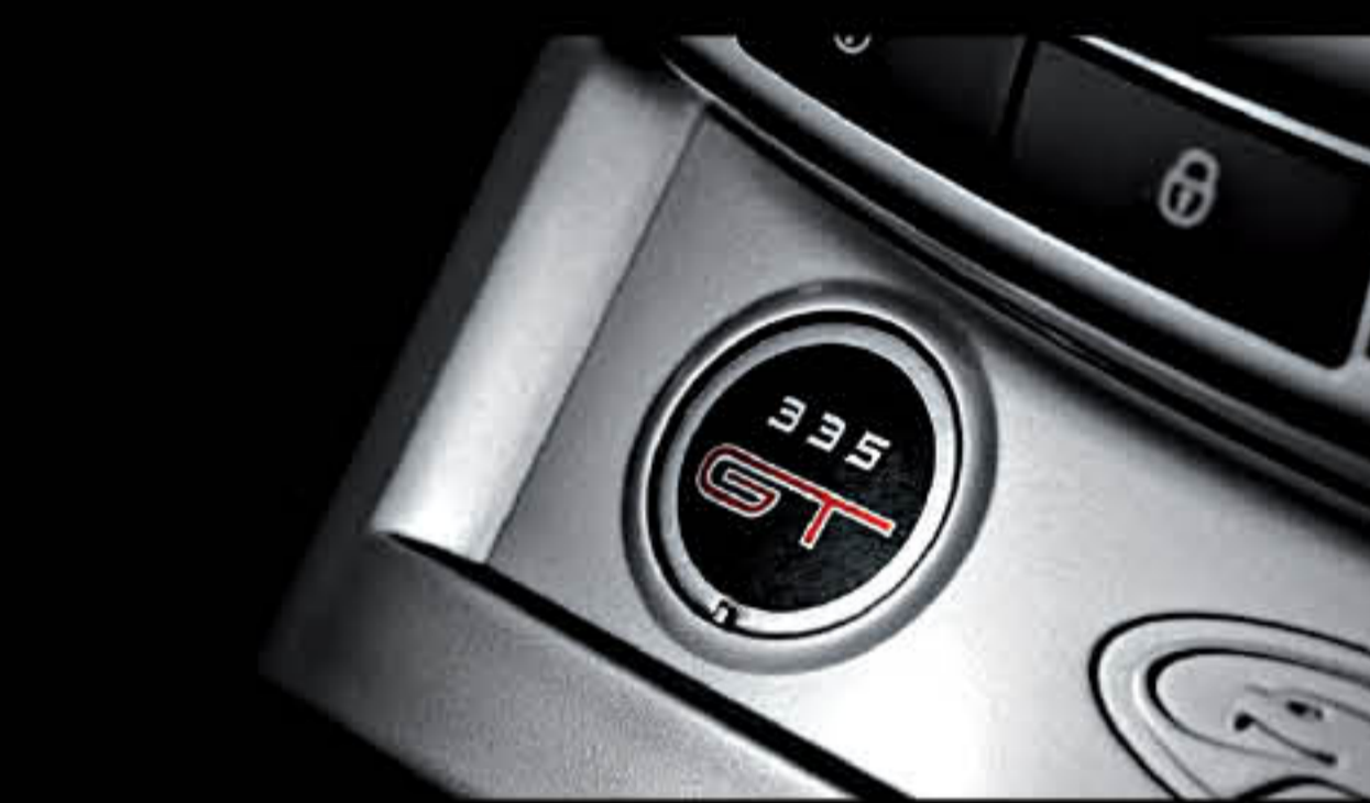
Unique build badge number