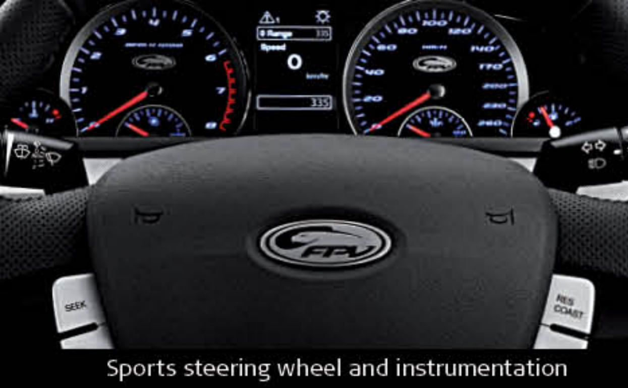
Sports steering wheel and instrumentation