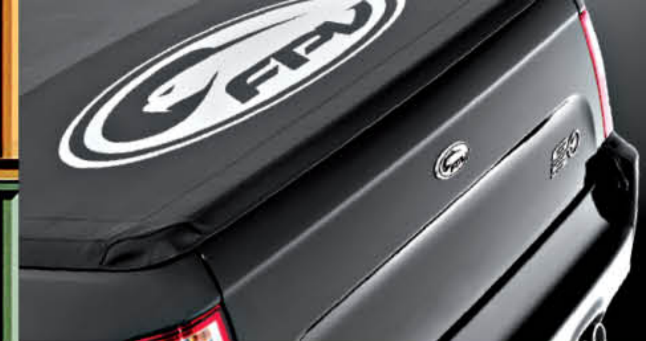
FPV soft tonneau cover (ute)