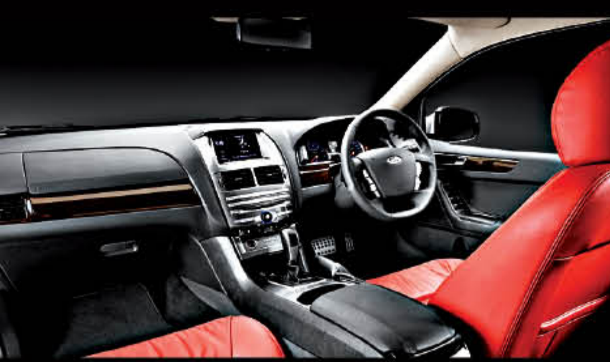
Optional red leather interior