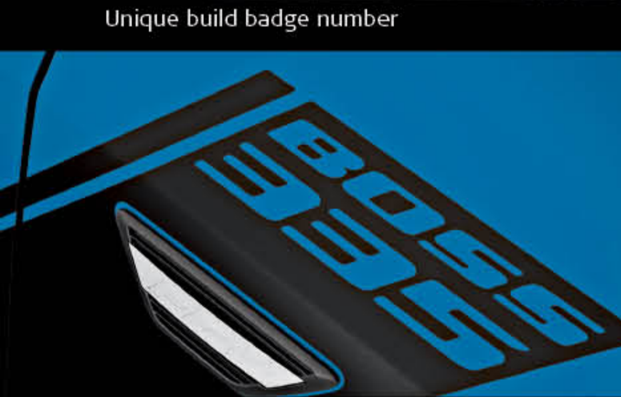
Striking Boss 335 stripe package