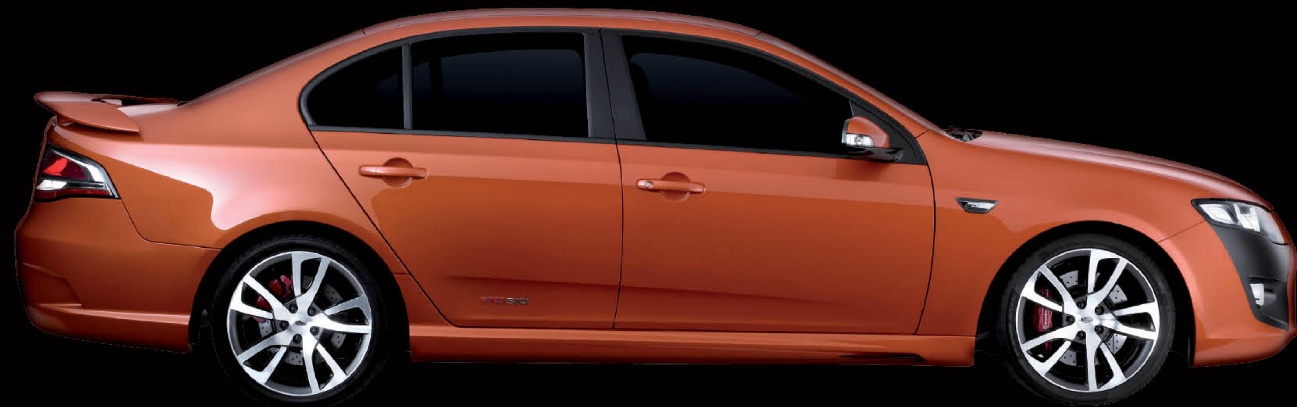
19-inch alloys and Brembo brakes