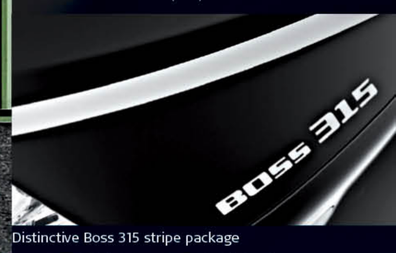
Distinctive Boss 315 stripe package