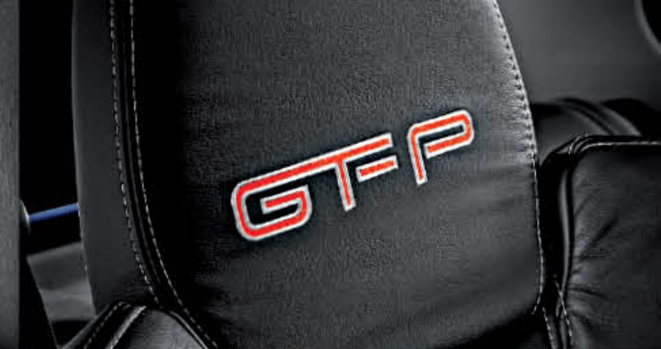
Performance sports leather seats

responds instantly to the throttle in any gear delivering a quantum of performance never before experienced in any Australian built car. Indeed, the new Boss 335 GT-P sets an entirely new standard for Australian performance cars in the same way the first GT did over 40 years ago. This is a car that melds traditional muscle car values with cutting edge technology to produce a current and future classic!