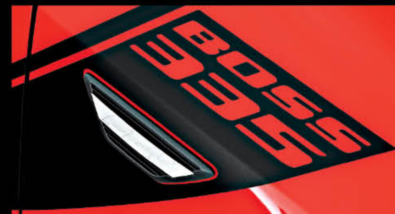
Unique Boss 335 stripe package