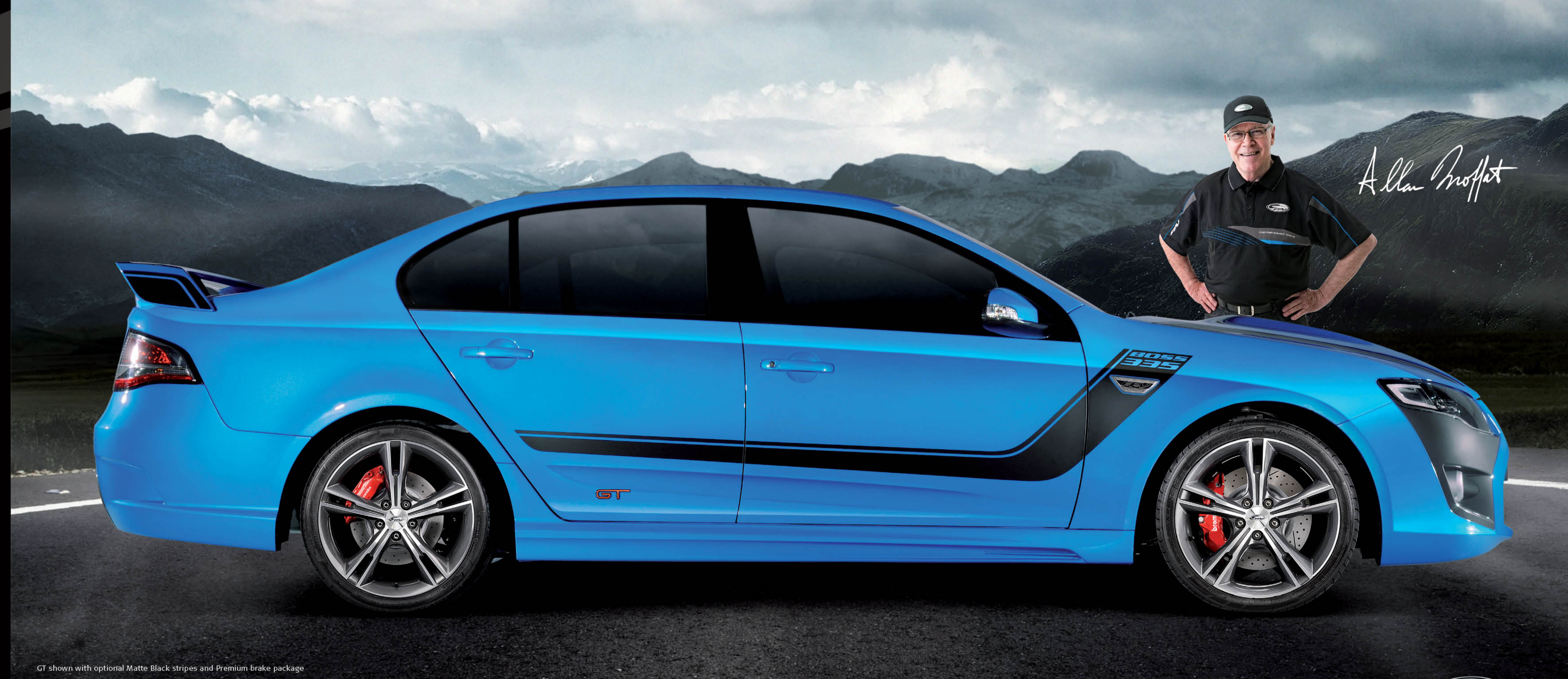
GT shown with optional Matte Black stripes and Premium brake package

Bathurst, Allan Moffat and the GT. Together they made Australian motor racing history. Back then nothing could touch Allan's GT. And today nothing can touch the new Boss 335 GT. The car that set the standard for Australian muscle cars has taken performance to a whole new level again. The hot new 5.0-litre, all-aluminium, supercharged Boss V8 pumps out a massive 335kW of power and a staggering 570Nm of torque. All of which makes this new GT the most powerful in history. And yet this new Boss 335 GT also happens to be the most economical in history. As Allan Moffat says: "This is the most outstanding vehicle ever to wear the iconic GT badge and in my opinion, the greatest Australian muscle car ever".