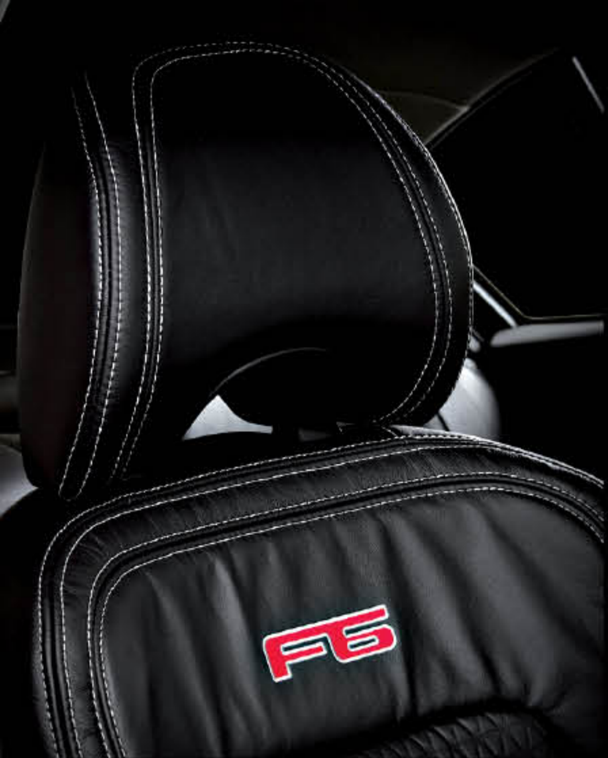
Optional leather seats

badging and FPV graphic on the tonneau cover and you have a workhorse that looks and performs like a thoroughbred. Drive it to work or drive it to play – this is the ute that delivers more excitement, more performance, more sheer enjoyment every time you press the starter button!