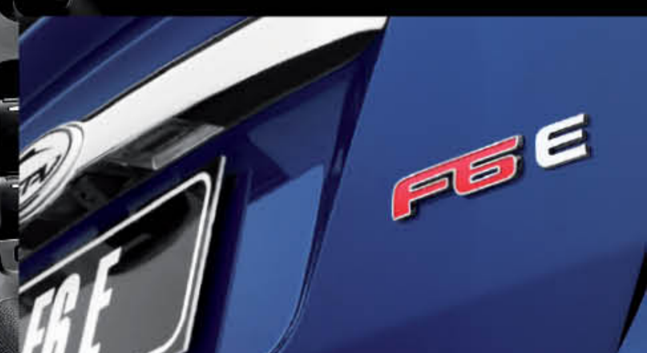
Unique F6 E badging