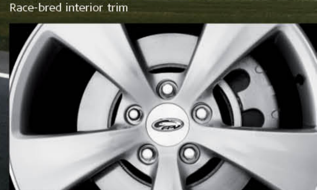
19-inch 5-spoke alloys