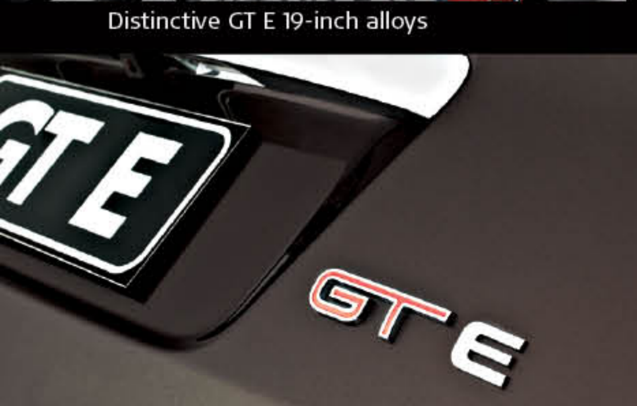
Exclusive GT E badging