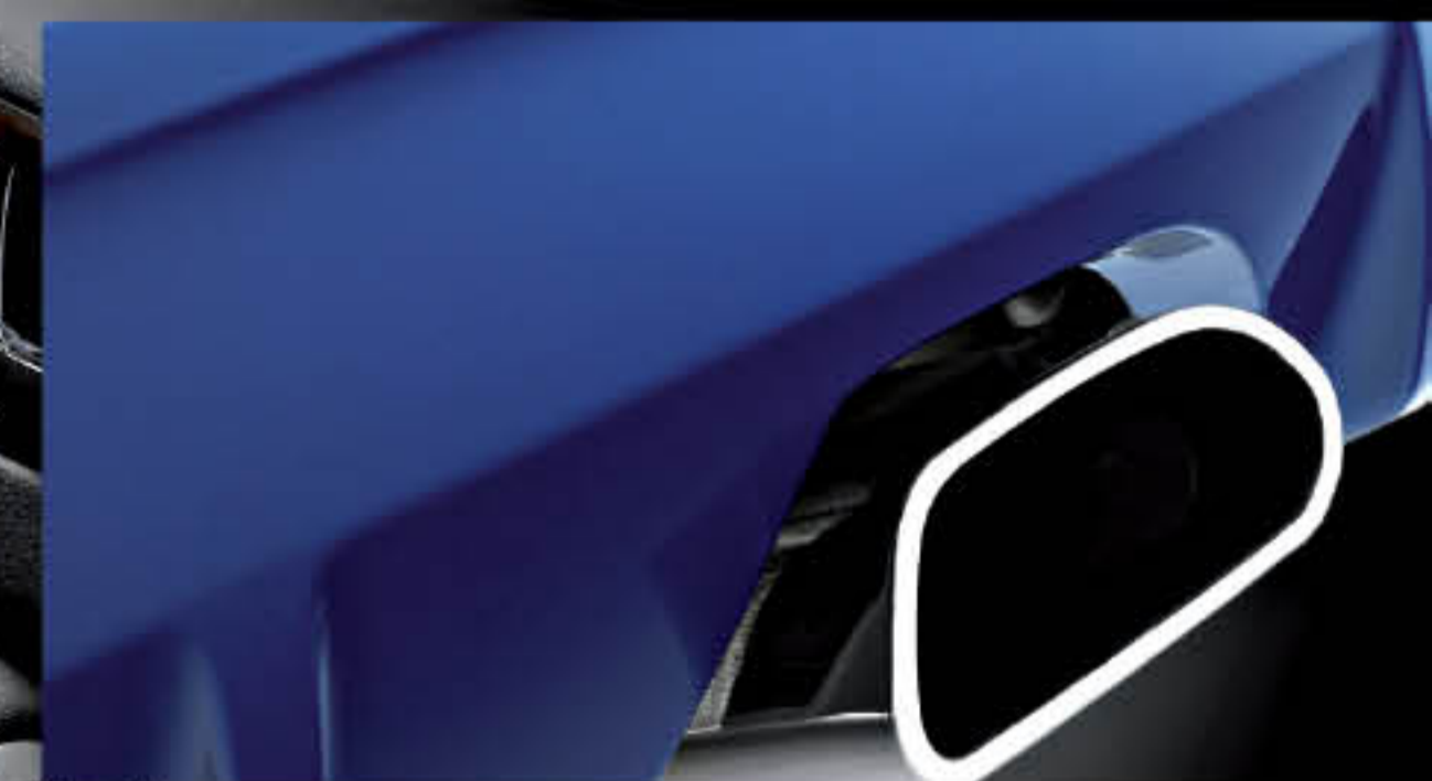
Stainless steel exhaust