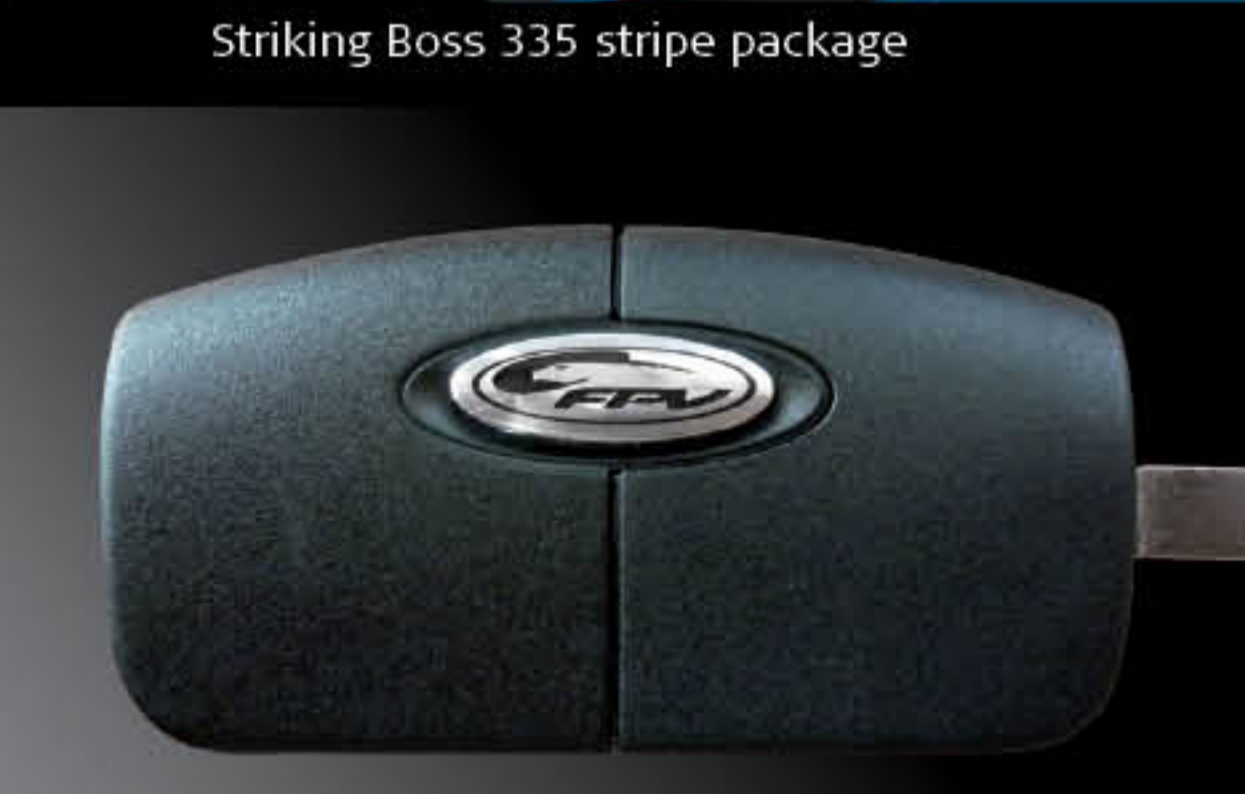
Unique FPV keyfob