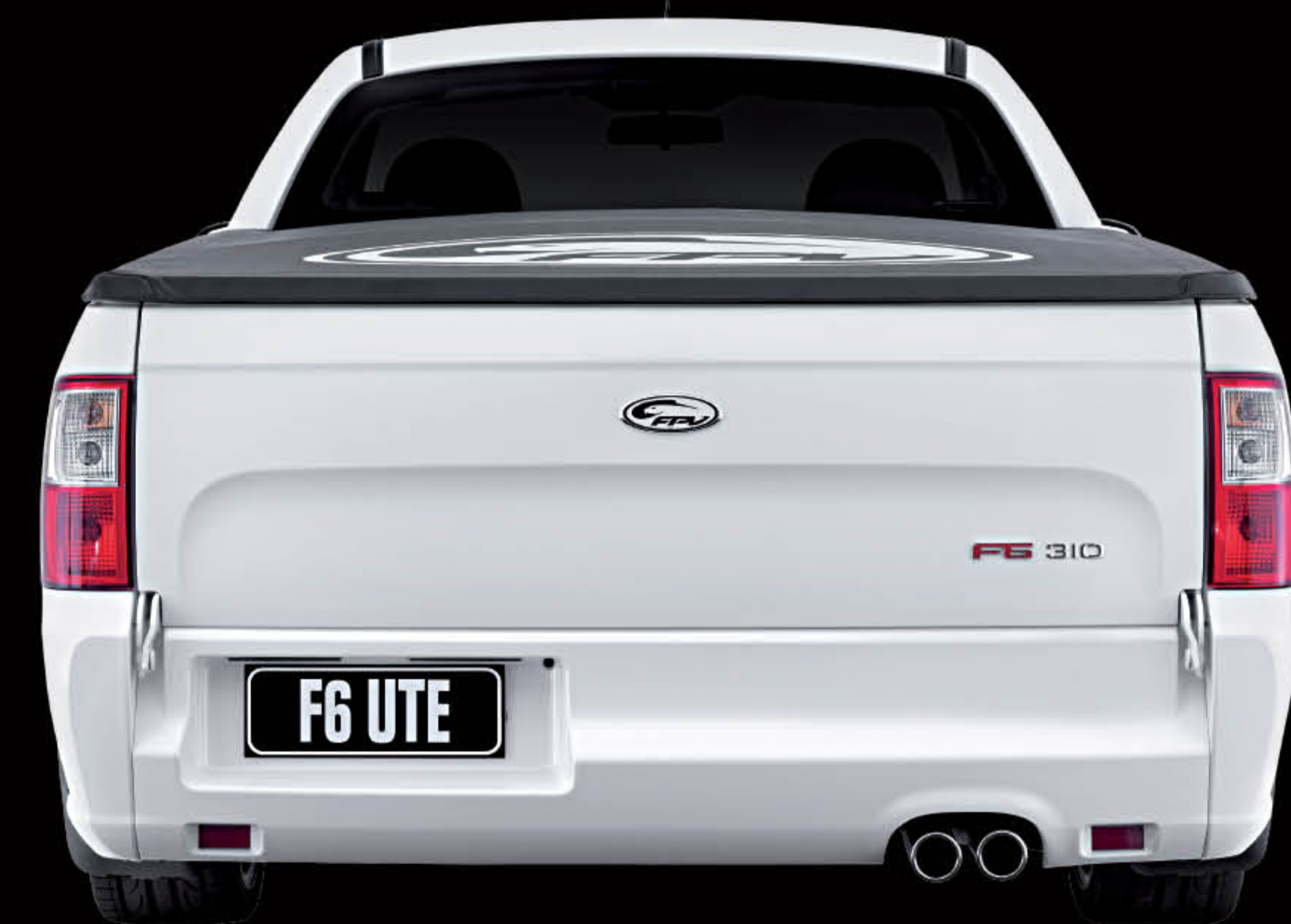
4.0-litre turbo-charged in-line six engine