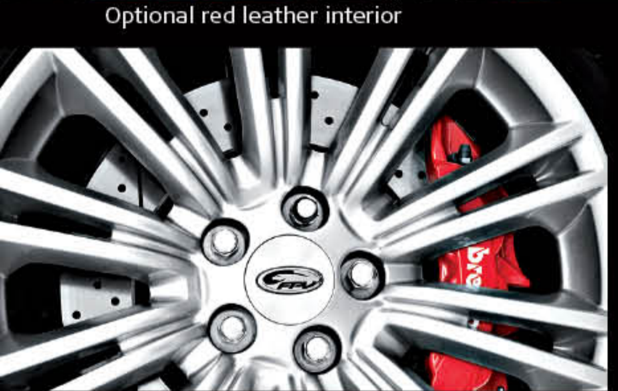
Distinctive GT E 19-inch alloys