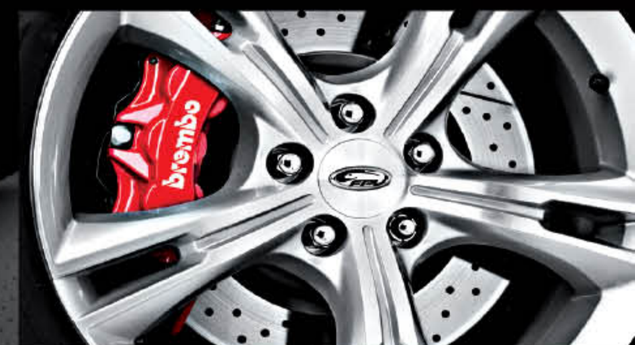
Brembo 6-piston front brakes