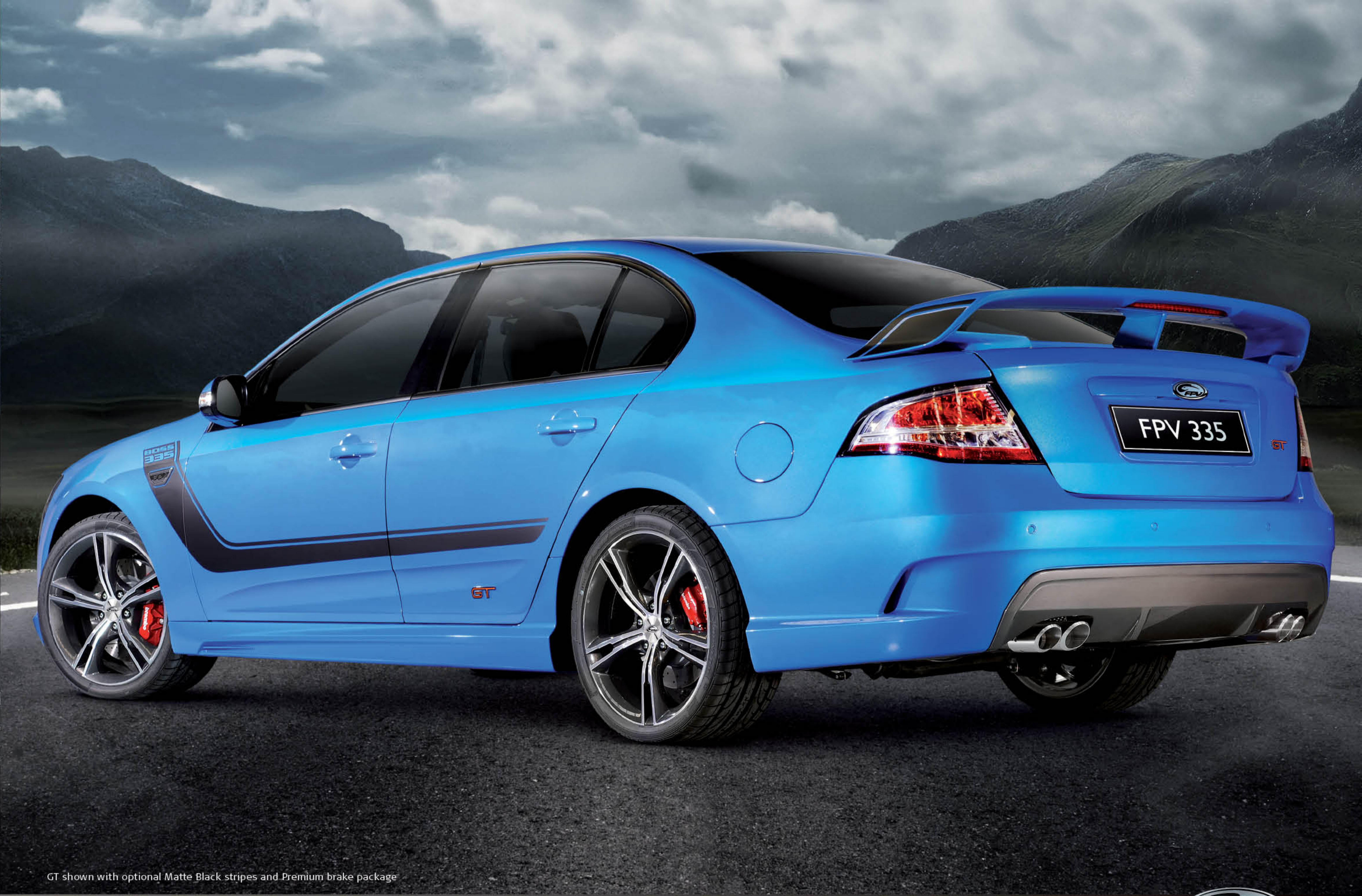
GT shown with optional Matte Black stripes and Premium brake package