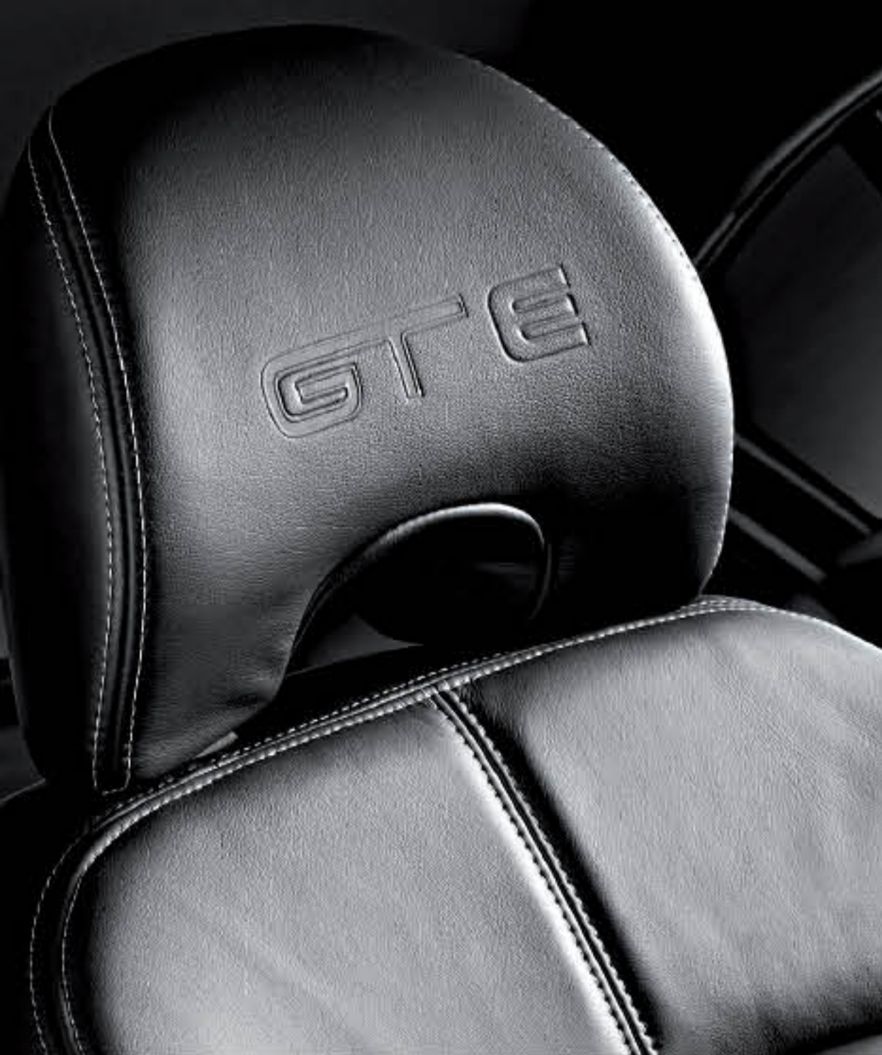
Luxury all-leather seats