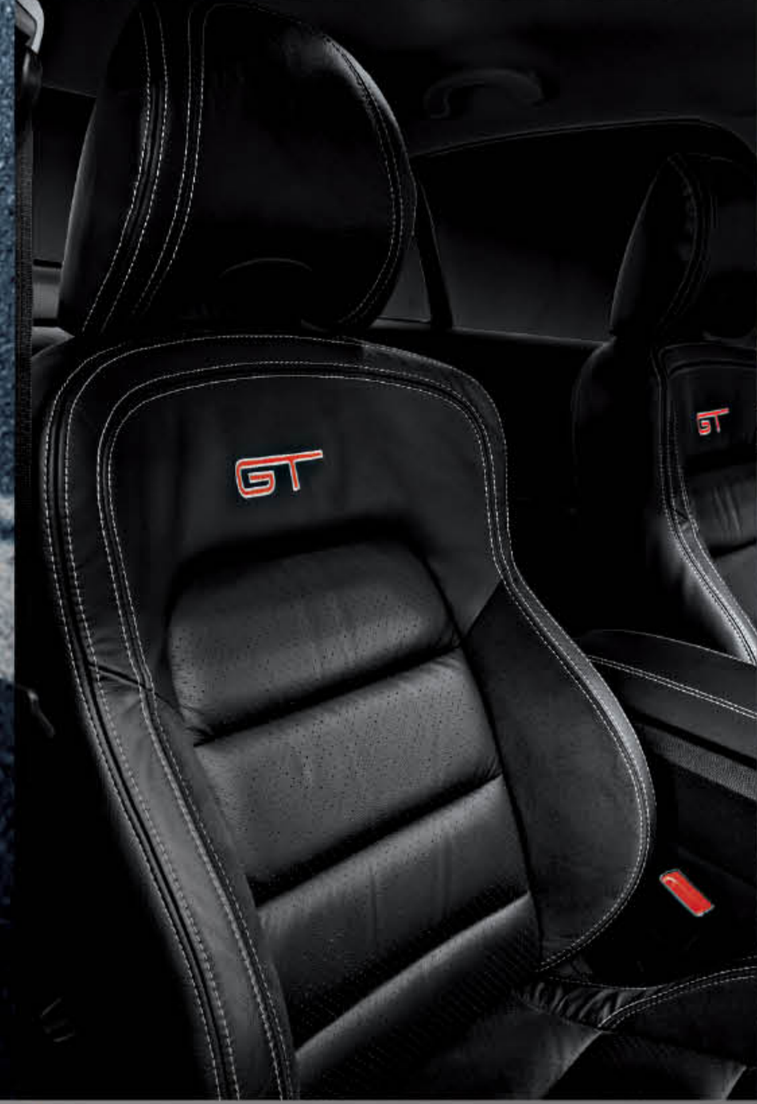
Optional FPV leather sports seats

Be prepared to be astounded as the all-aluminium, supercharged Boss 335 delivers a level of performance unequalled by any Australian-built performance car. The sound alone is iconic as the bi-modal quad exhaust system plays a symphony of pure dominance that lets the world know you're coming. To deliver the GT's road-dominating power and torque to the tarmac, it's your choice of a slick shifting, 6-speed Tremec manual gearbox or a superb ZF 6-speed auto with Sequential Sports Shift. FPV engineers enlisted the help of legendary race driver Allan Moffat to help optimise the ride, handling and braking dynamics of the Boss 335 GT. Feel the communicative steering, the bite of the 4-piston Brembo brakes and the distinctive handling of the tuned chassis as you revel in the distinctive bark of the magnificent Boss engine.