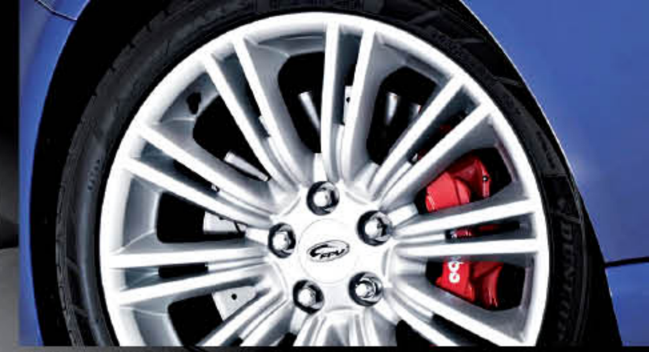
19-inch alloy wheels