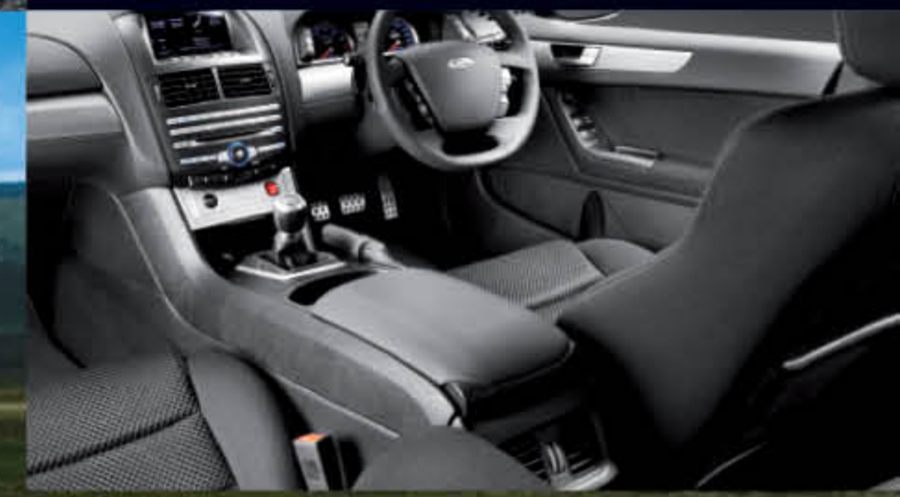
Race-bred interior trim