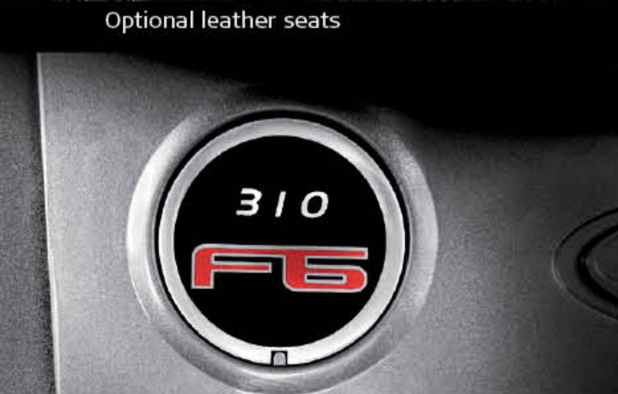
Unique F6 310 build badge