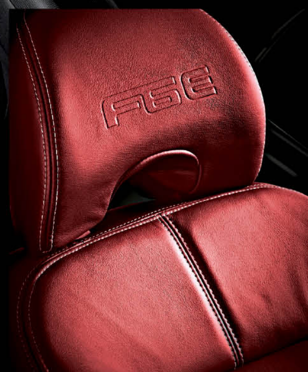
Optional red leather seats