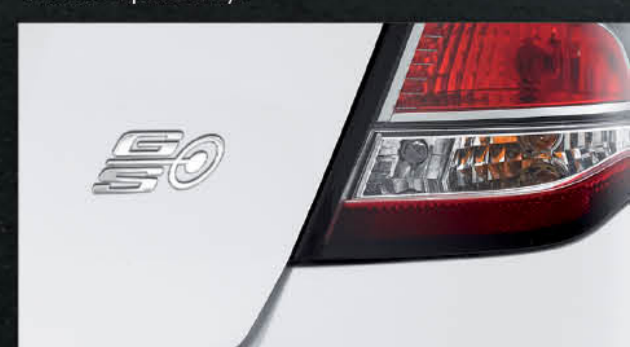
Unique GS badging