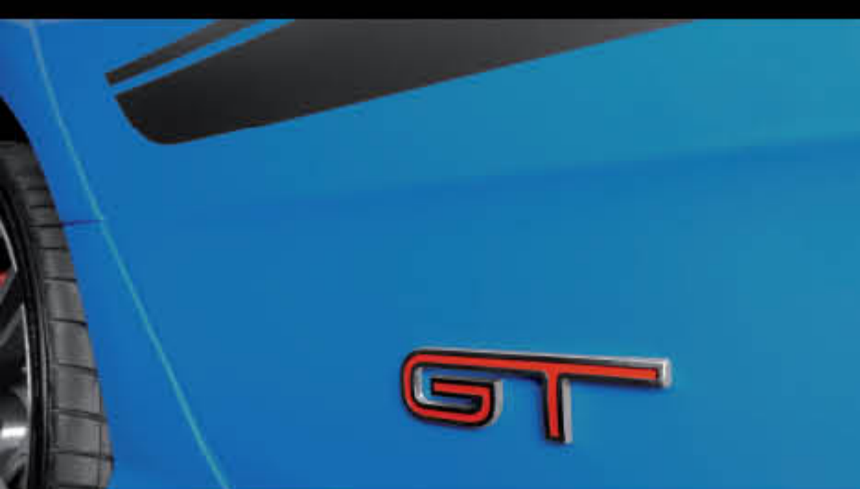
The iconic GT badge takes pride of place