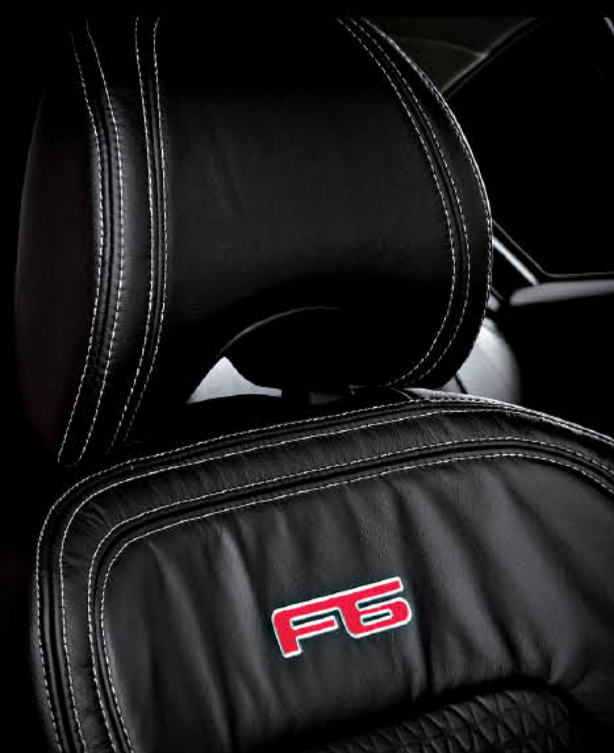
Optional leather seats