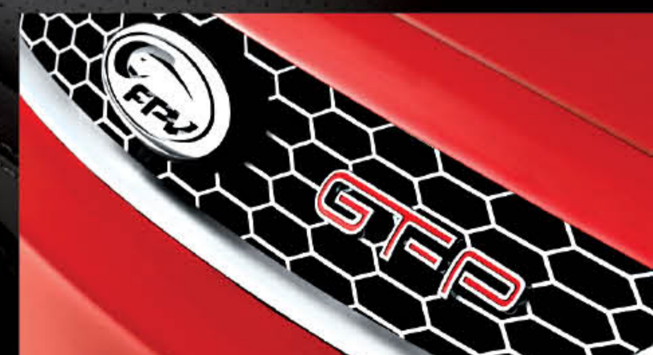
Unique GT-P badging