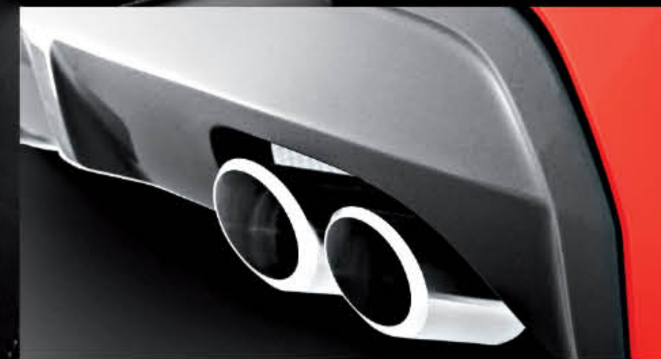
Bi-modal quad exhaust system