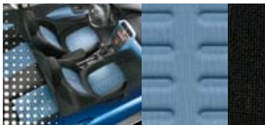
356 Denim Azure