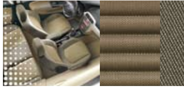
516 Tweed Golden Sand