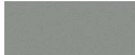
595 Chemical Grey