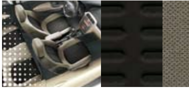
353 Denim Black