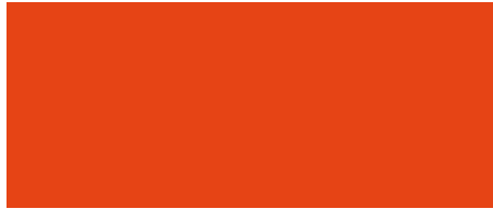
551 Caribbean Orange