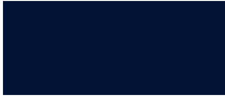
475 Rock'n'roll Blue