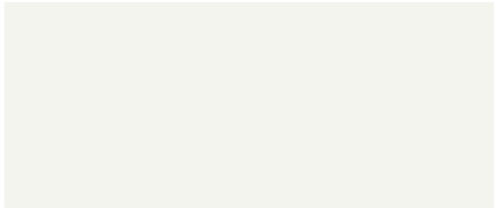
249 Ambient White