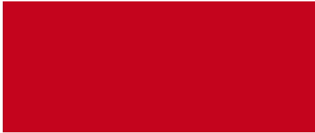
176 Exotica Red