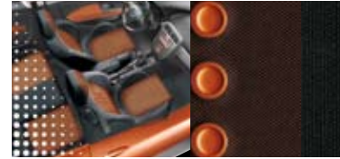
625 Inox Orange