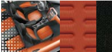
354 Denim Orange