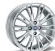
17" Alloy Wheel Sport