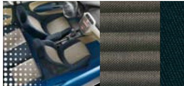
517 Tweed Blue Sand