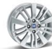
15" Alloy Wheel Emotion