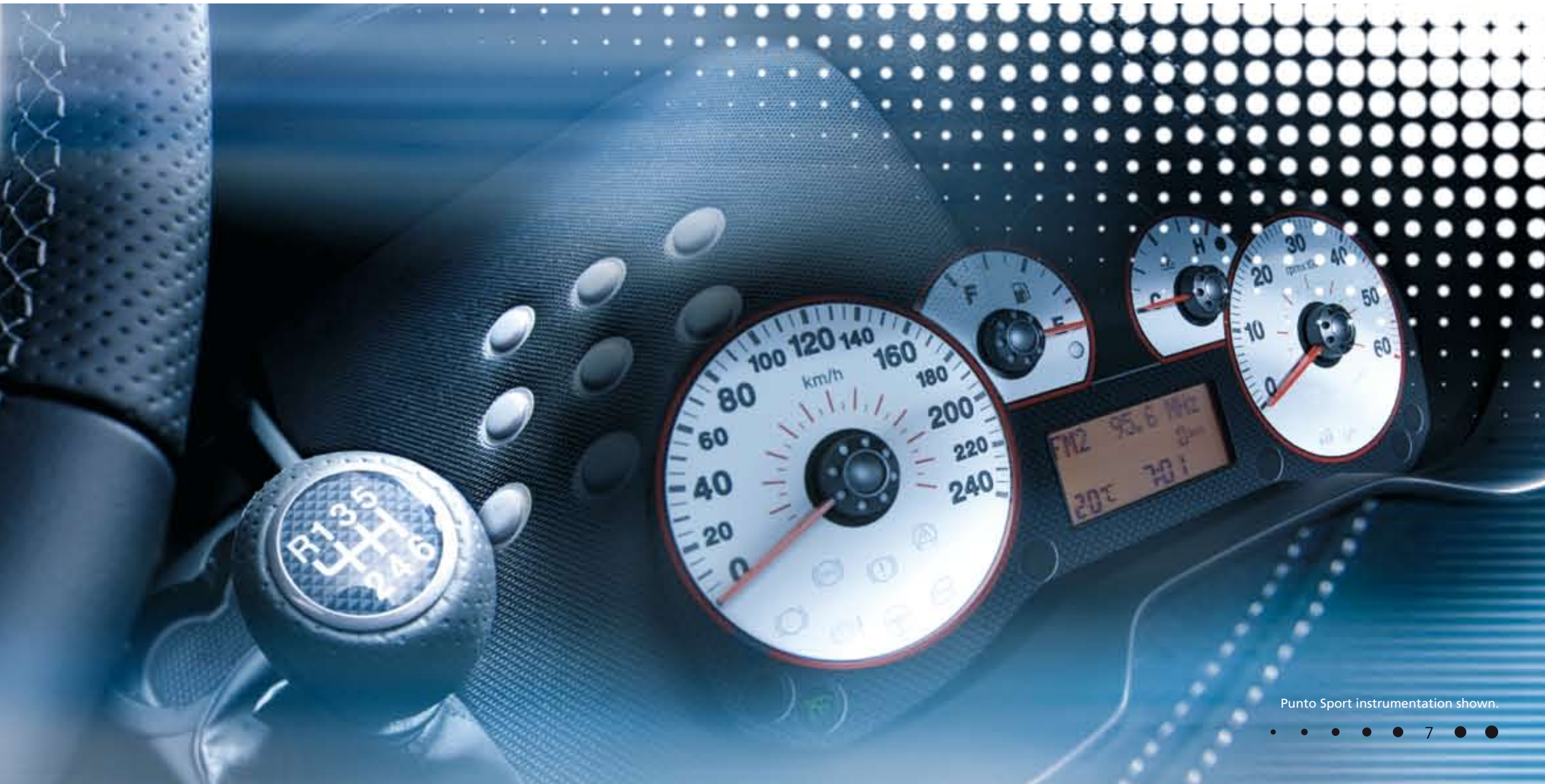
Punto Sport instrumentation shown.

Size does matter! It's not just the length of the Punto (4030mm) that makes it one of the biggest cars in its class. Class leading design concepts combined with excellent access and superb visibility give the car the best interior space in its segment. Excellent ergonomics make driving a constant pleasure, while back-seat passengers will always have plenty of room to be comfortable.