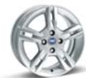
15" Alloy Wheel Optional