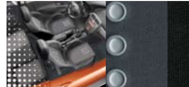
626 Inox Grey