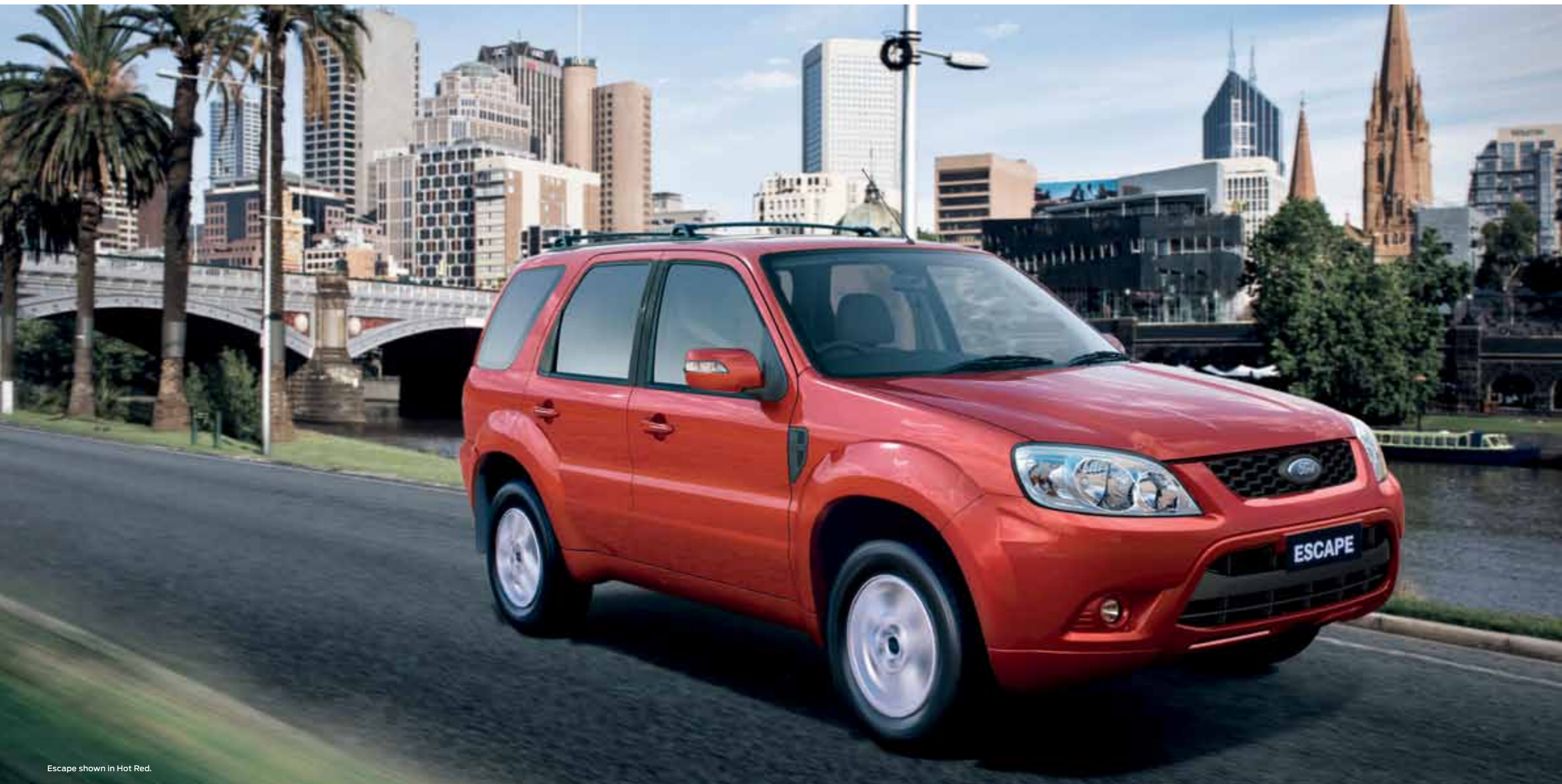
Escape shown in Hot Red.

With genuine 4WD capabilities and sedan like handling, the Ford Escape is equally at home in the city or off the beaten track.