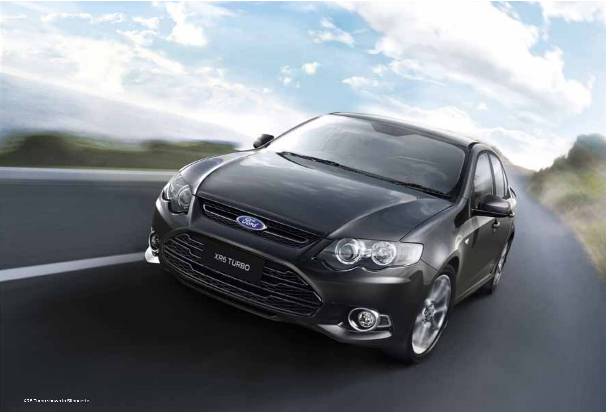
XR6 Turbo shown in Silhouette.

Enjoy a superior driving experience with advanced new engine technologies and the latest in high performance engineering and tuning.