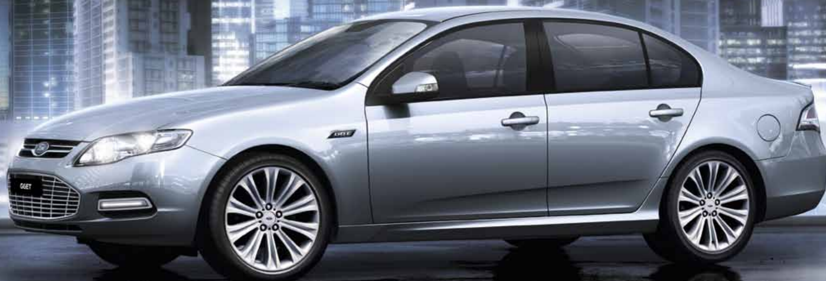
G6E Turbo shown in Lightning Strike.

The G-Series offers plenty in the way of luxury and comfort, without ever compromising on power and driving pleasure.