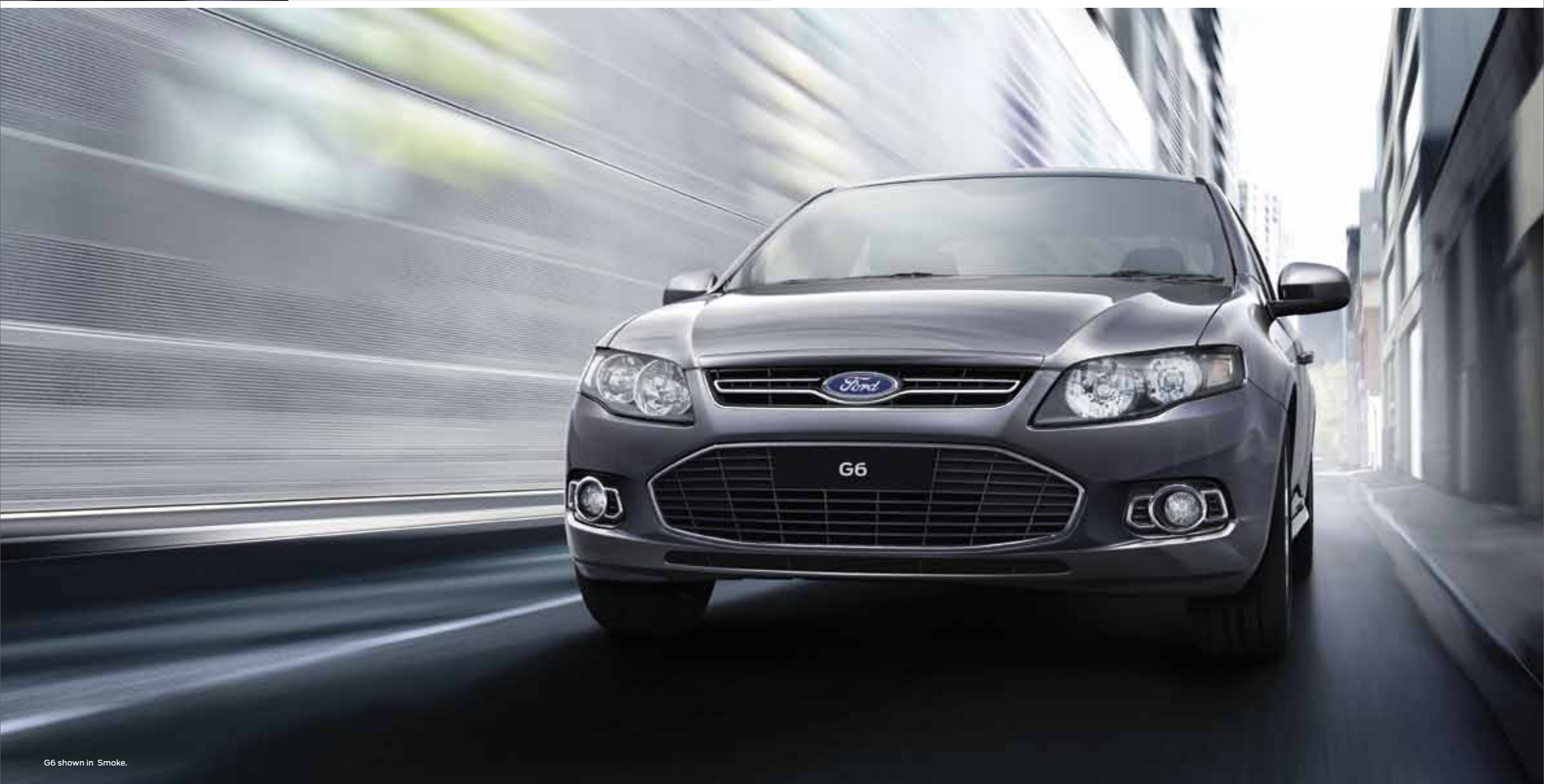
G6 shown in Smoke.

Enjoy the same levels of power and performance you're used to, but with improved fuel economy and reduced environmental impact.