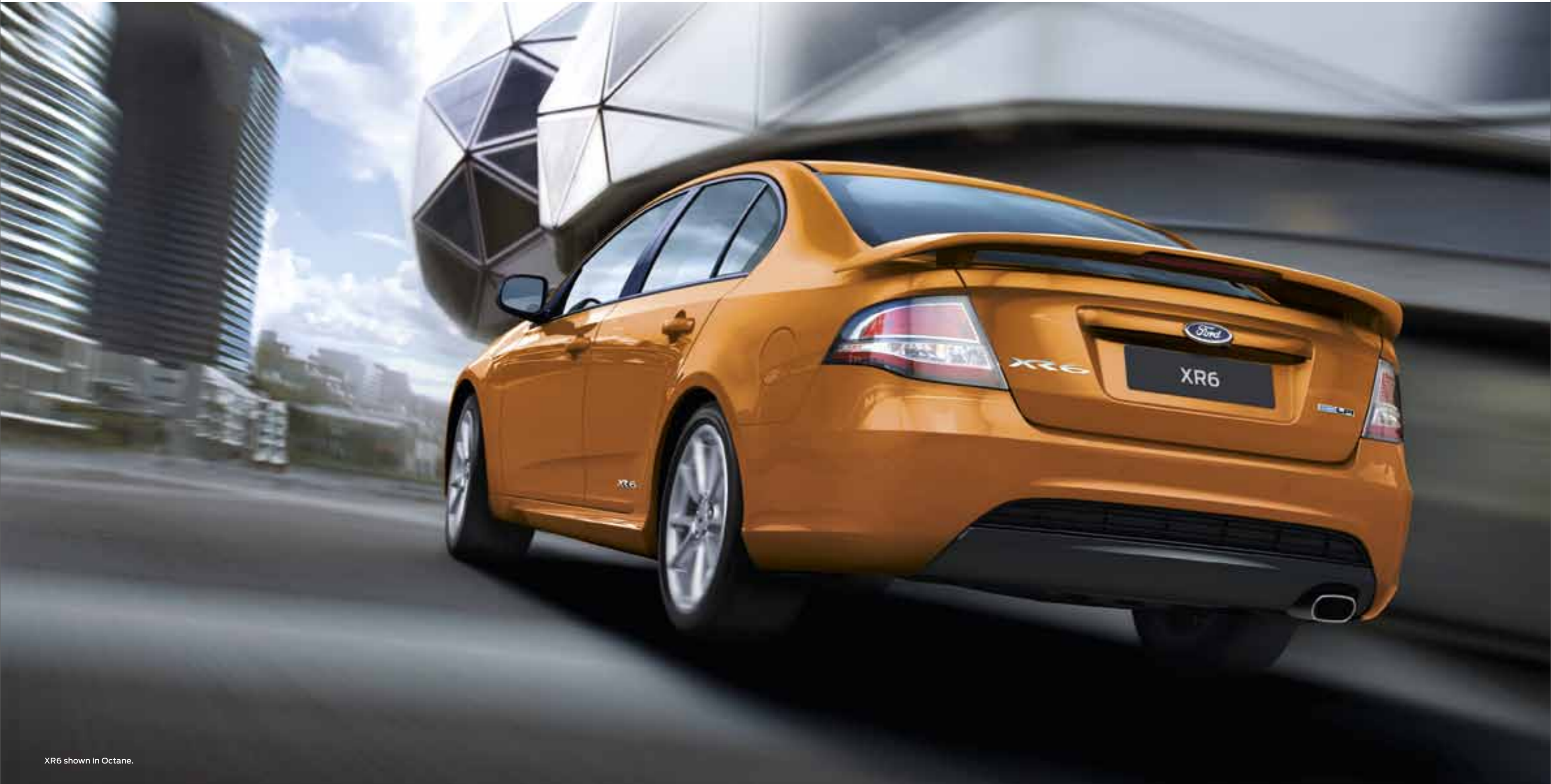
XR6 shown in Octane.

Enjoy outstanding power and torque and reduced carbon emissions while taking advantage of lower fuel costs.