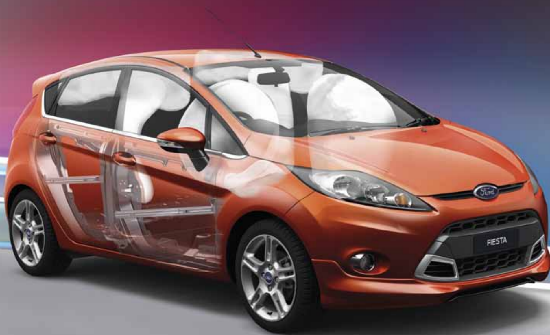
Fiesta Zetec shown in Chilli Orange.