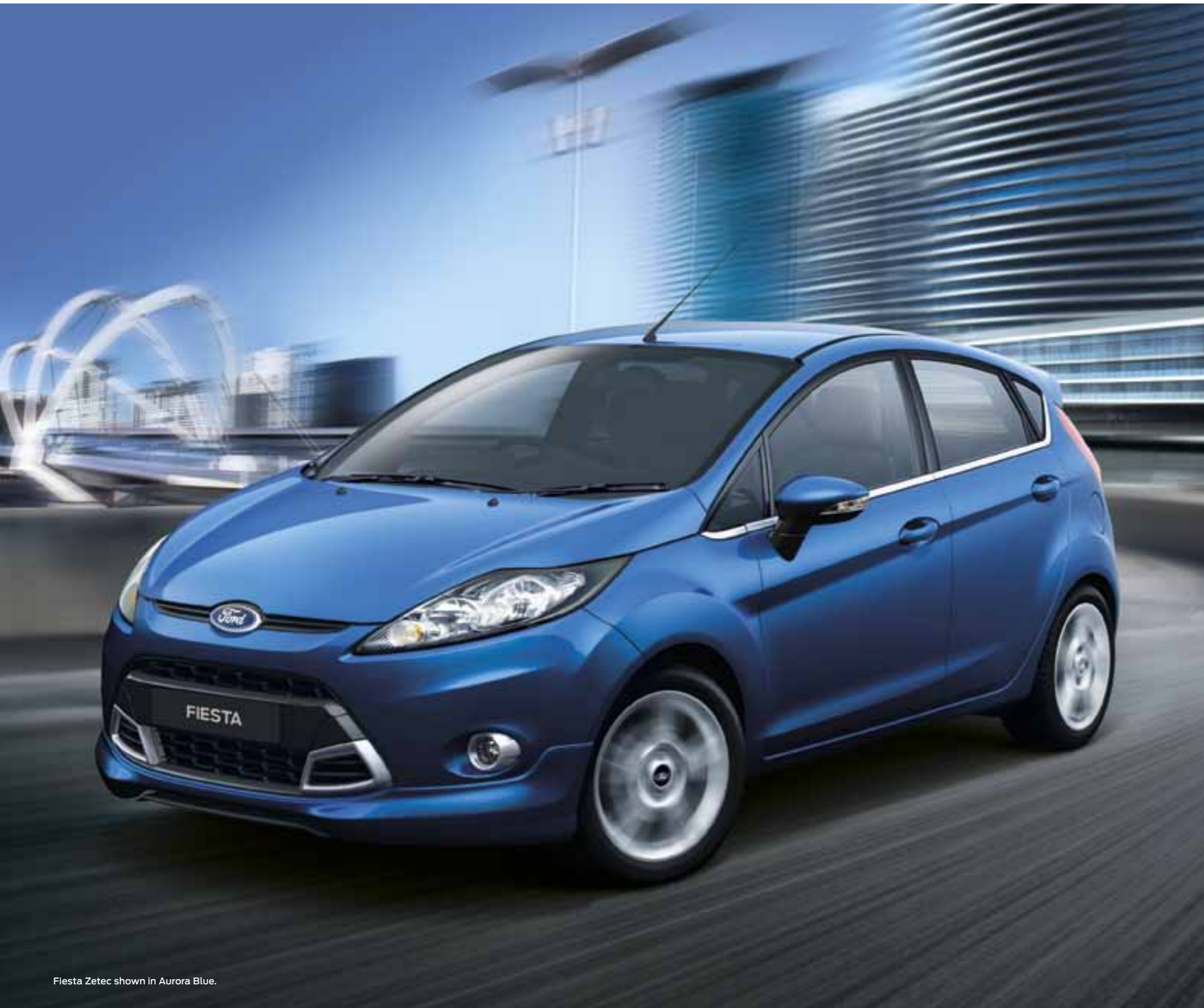
Fiesta Zetec shown in Aurora Blue.

Exciting. Fun. Responsive. With its razor sharp handling driving a Fiesta is all these things, and more. In fact, you sense the Fiesta was designed and engineered to ensure every drive gives you a real buzz and makes you feel alive.