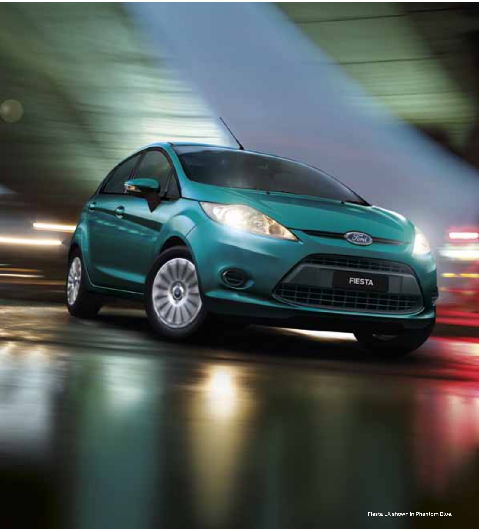
Fiesta LX shown in Phantom Blue.