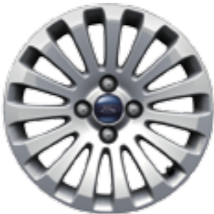
LX 15" x 6" alloy wheel