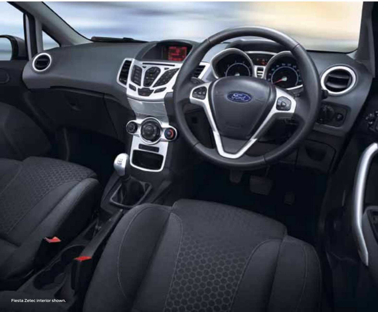
Fiesta Zetec interior shown.

The top-of-the-range Fiesta Zetec gives you a truly exhilarating drive, while inside you're surrounded by creature comforts and smart technology.