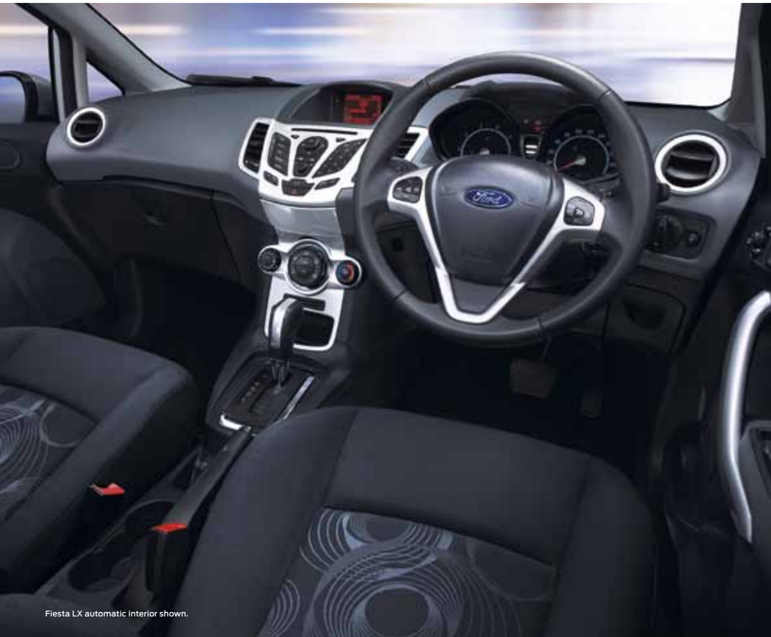
Fiesta LX automatic interior shown.

From its confident, bold design and tech filled interior to its 15" alloy wheels, everything about the Fiesta LX fuels your passion to drive.