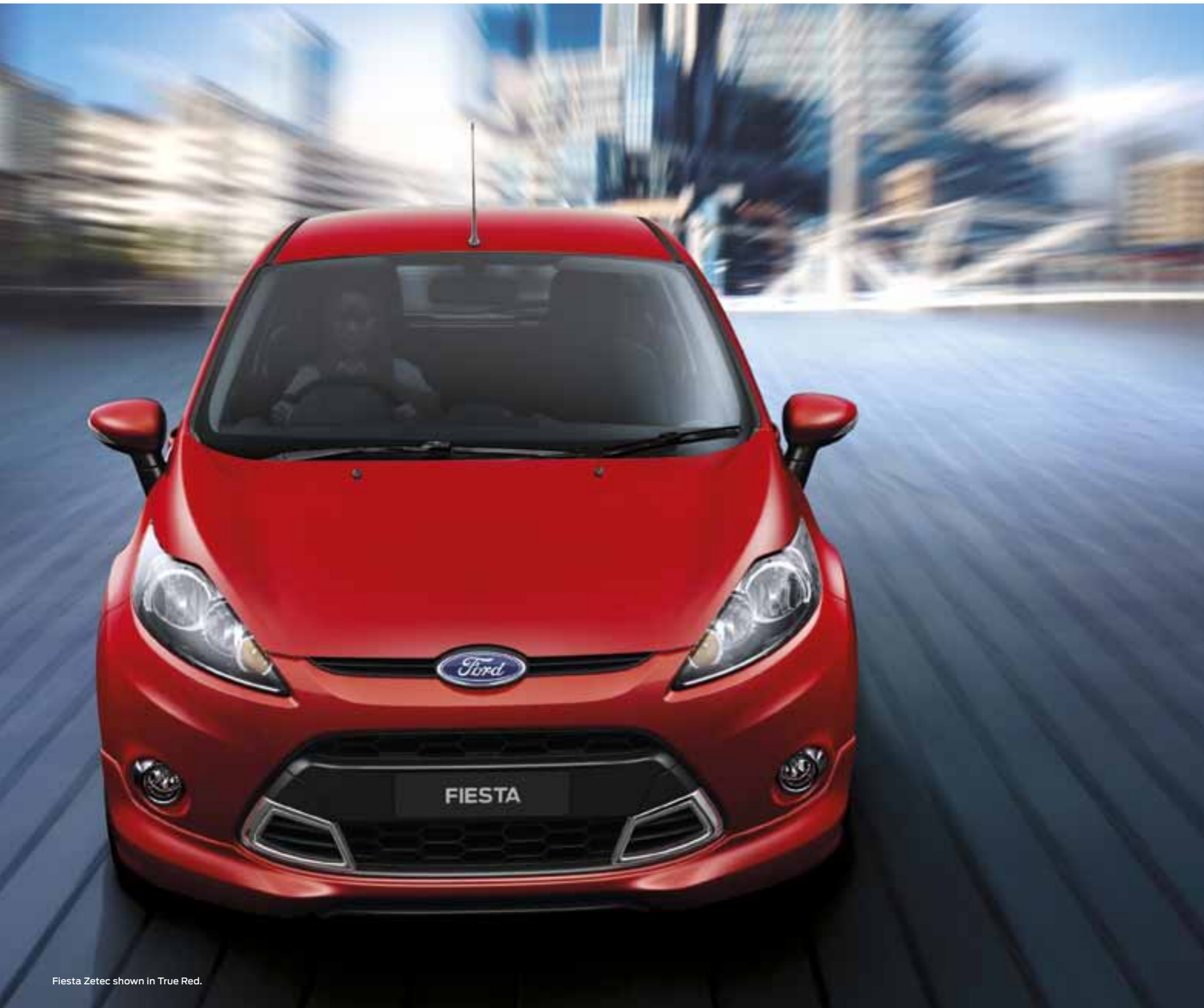
Fiesta Zetec shown in True Red.

Guaranteed to make a big impact, the Fiesta is a small car that packs in a lot of style. It sparks an instant desire. From its athletic stance to the sexy look of the front grille and headlamps the Fiesta is equal parts daring and dynamic.