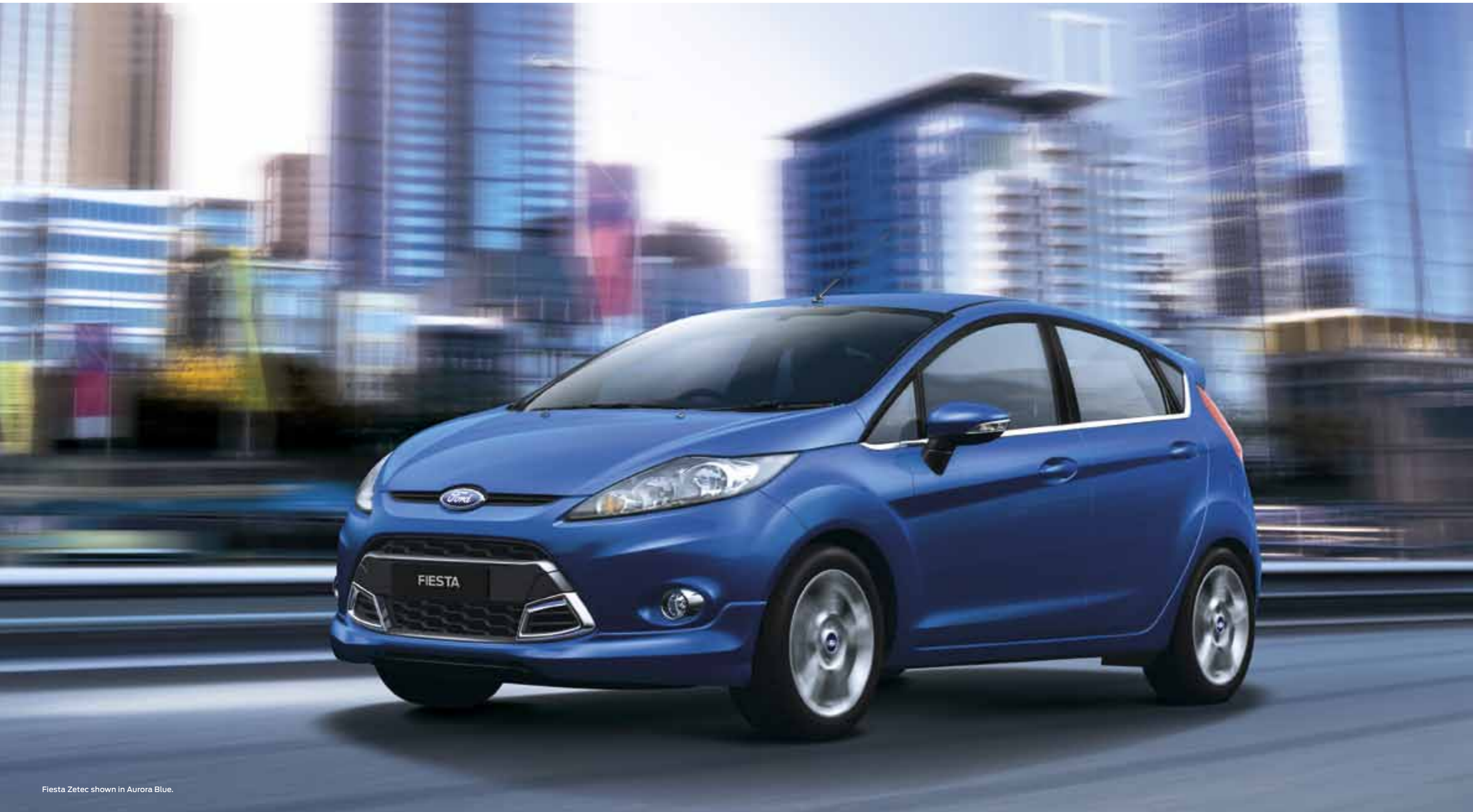
Fiesta Zetec shown in Aurora Blue.

Life moves faster than ever before. From work, to nights out with friends, to weekends away. Life's busy. That's why it's so good. When you live life in overdrive you want a car that keeps pace, like the Ford Fiesta.