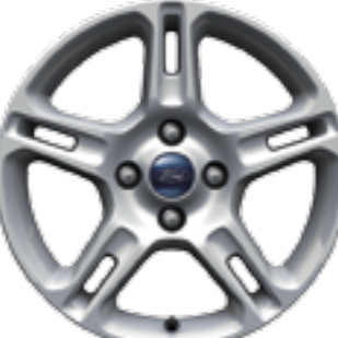
ZETEC 16" x 6" alloy wheel