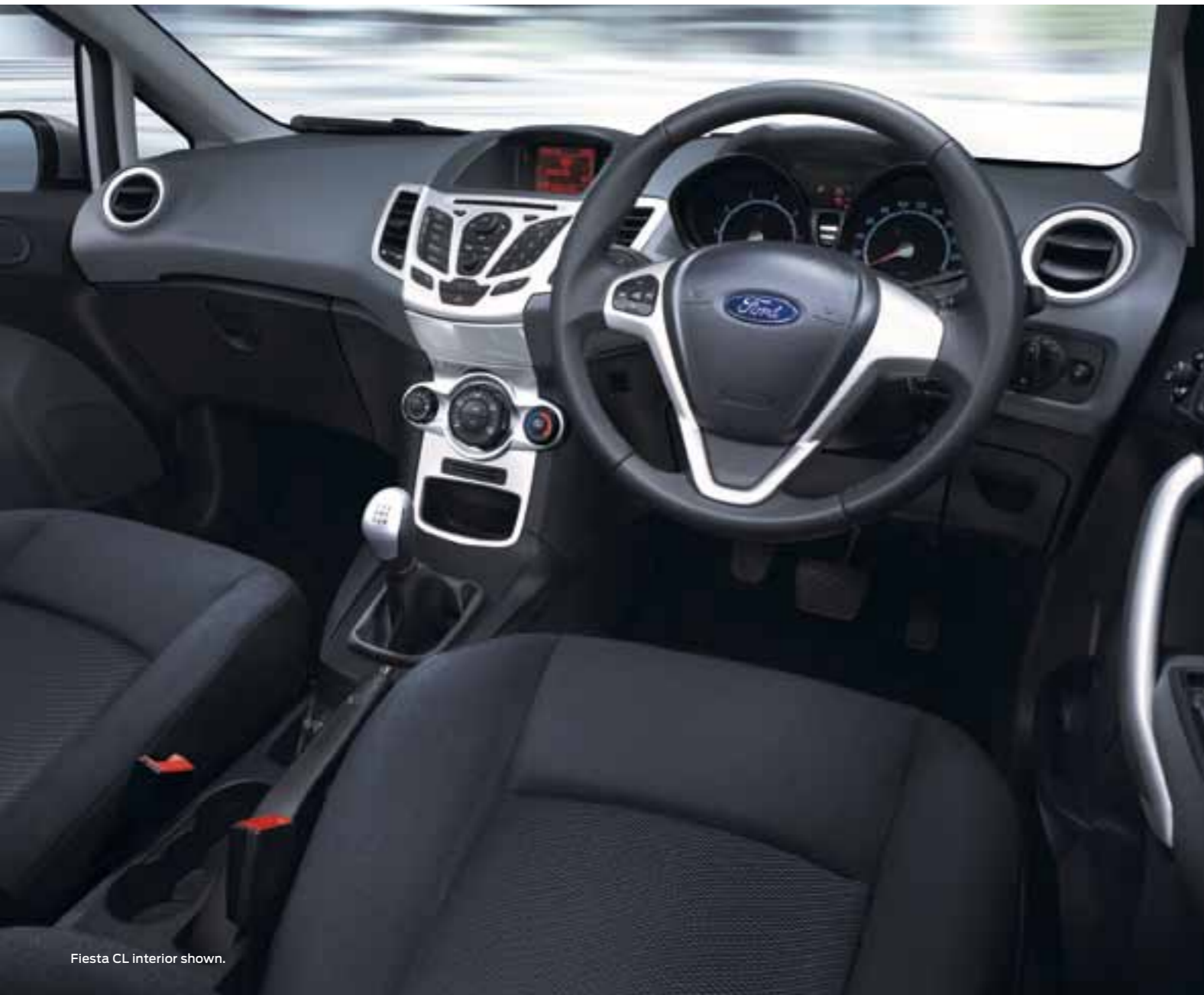
Fiesta CL interior shown.

From its sporty contour design to its sexy headlights, palette of eye-catching colours and technological features like iPod connectivity, it's all about style and confidence.