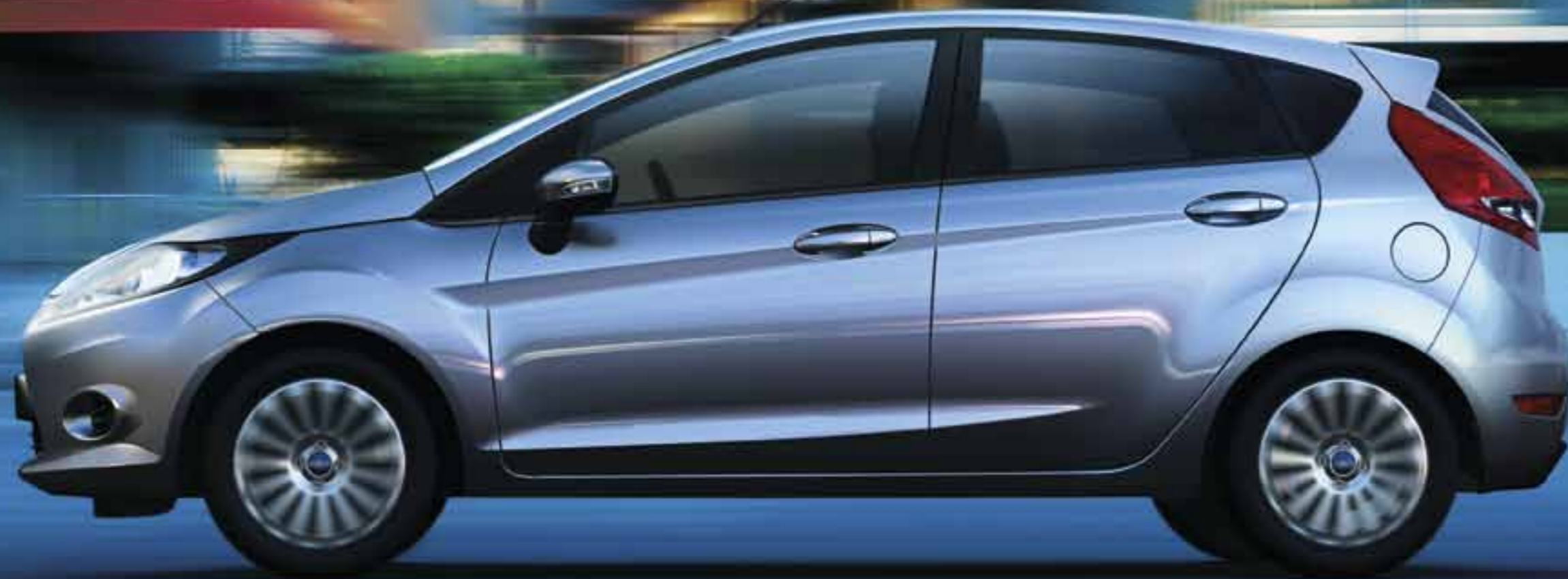
Fiesta LX shown in Highlight Silver.

The Fiesta range gives you the freedom of space, so you can fit in all the shopping bags, or load up the gear for a weekend escape to the coast.