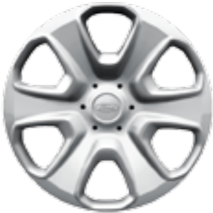
CL 15" x 6" steel wheel