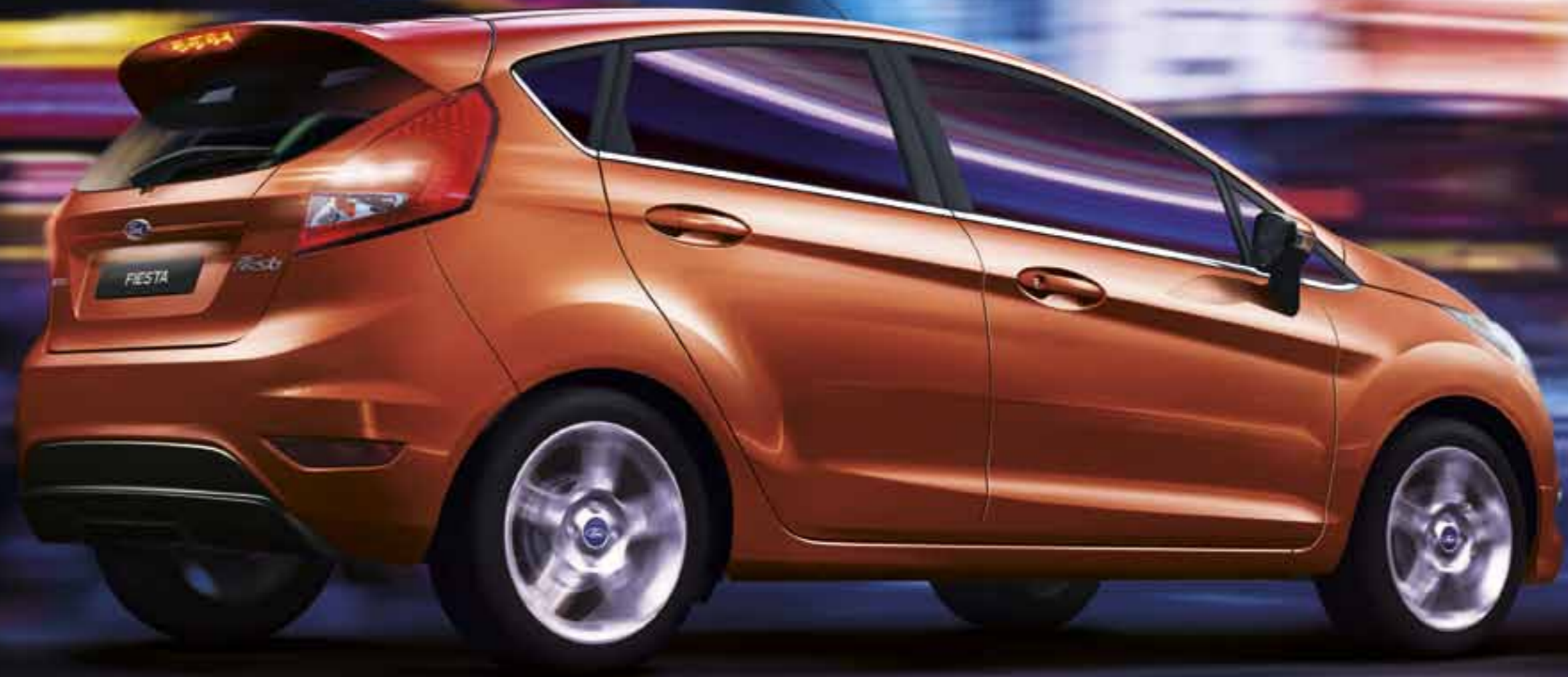
Fiesta Zetec shown in Chilli Orange.

Sleek and stylish, the Fiesta is designed to amplify the anticipation of the drive and physically engage your senses. Sexy and sporty from every angle, the Fiesta makes a big impression.