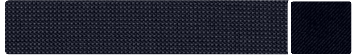
Minute in Infinity Blue.