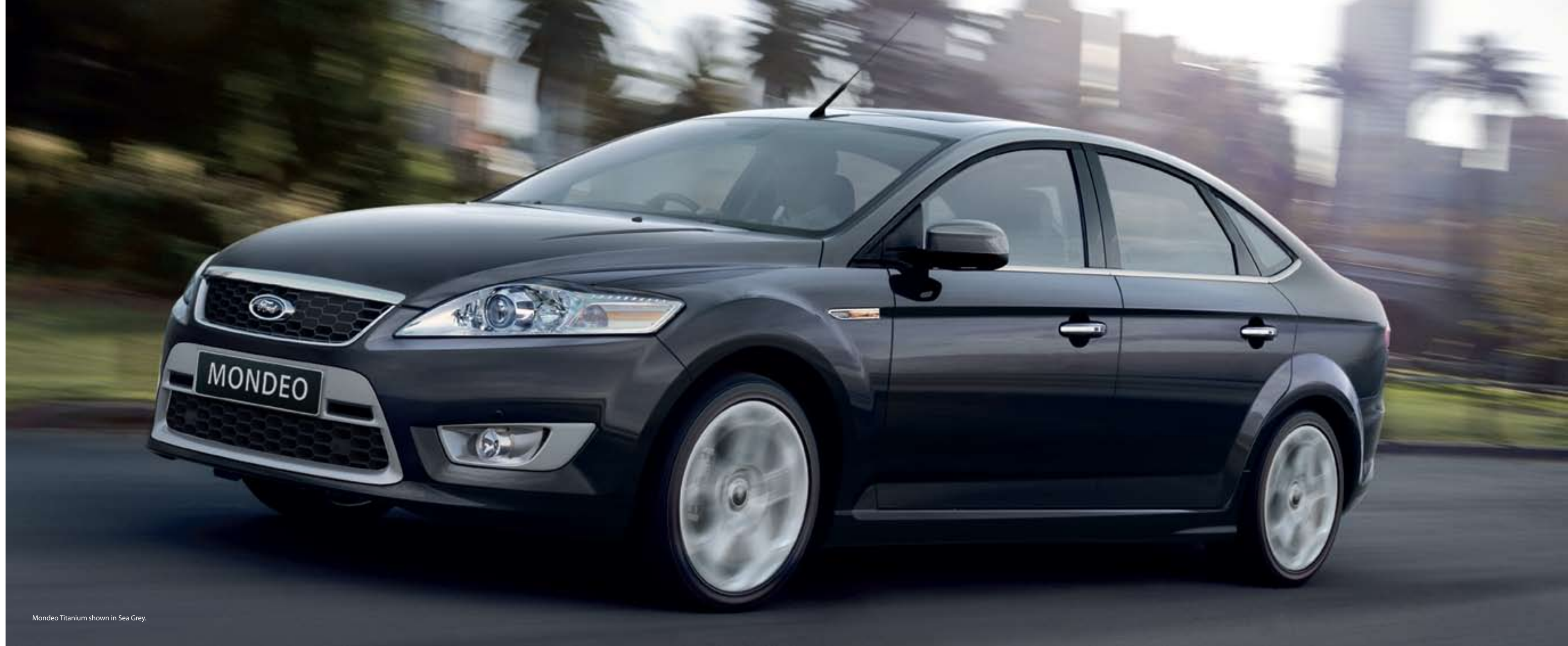
Mondeo Titanium shown in Sea Grey.

Some designs are blessed with a unique talent to stand out from the pack. Like the Ford Mondeo. With genuinely striking looks, the Mondeo displays real visual energy on the road and has an eye-catching presence in the car park. The Mondeo's appeal lies in its immediate visual impact, the sleek exterior styling cues and the unmistakable sense that all the proportions and details feel just right. And now, the impressive Mondeo range has been extended to include both hatch and wagon body styles.