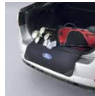
Boot scuff guard.