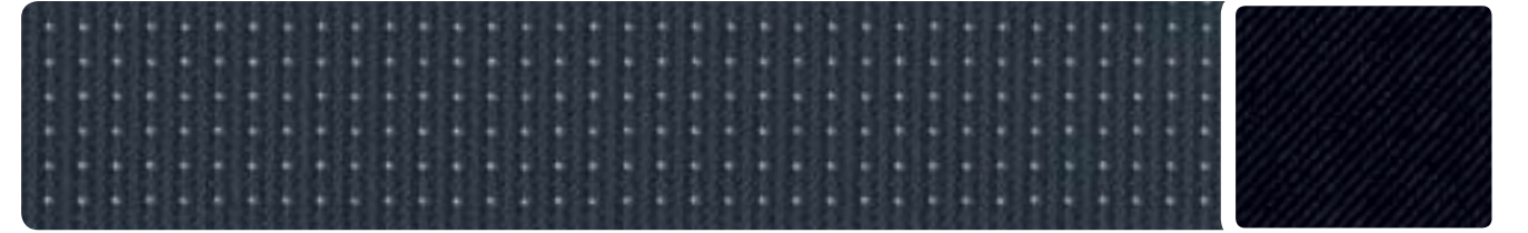
Daphne in Blue.