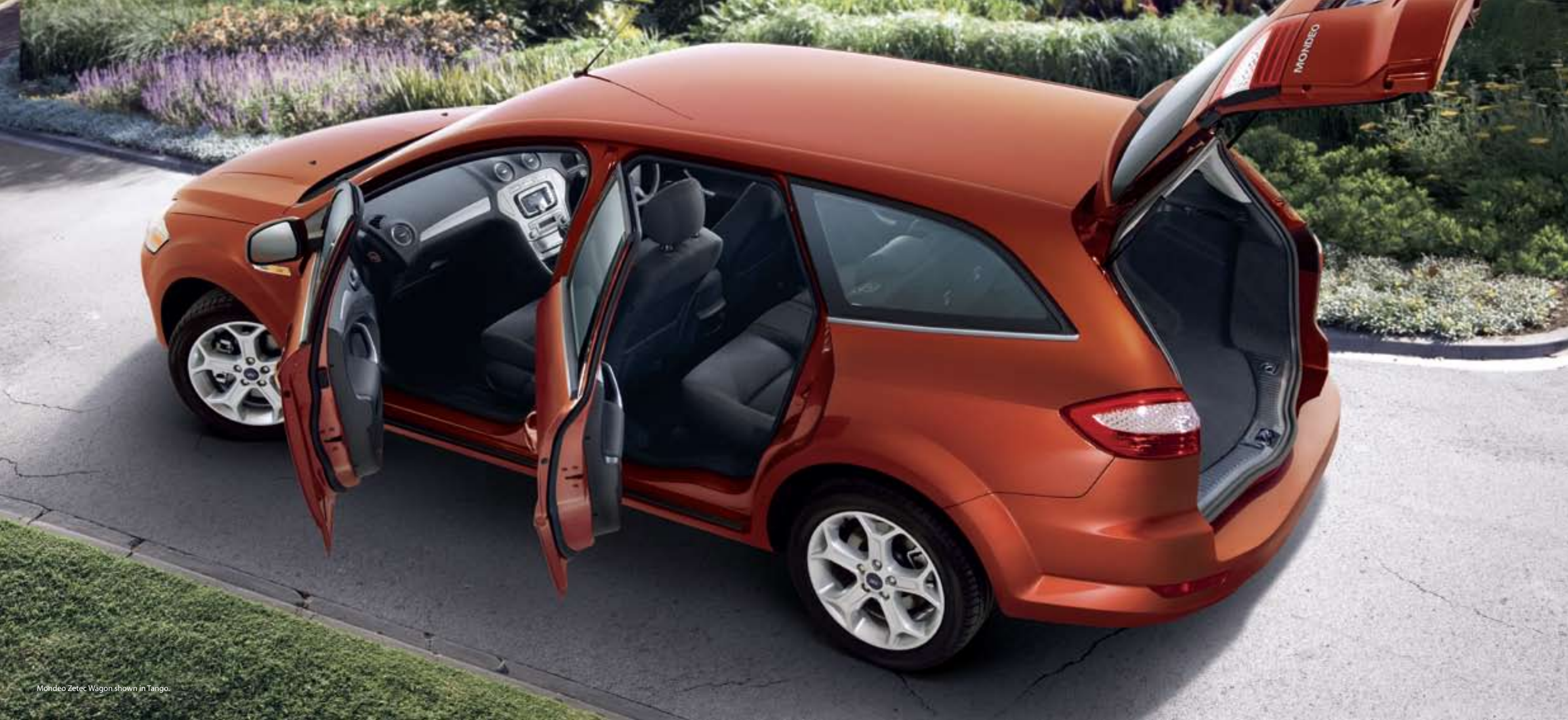
Mondeo Zetec Wagon shown in Tango.