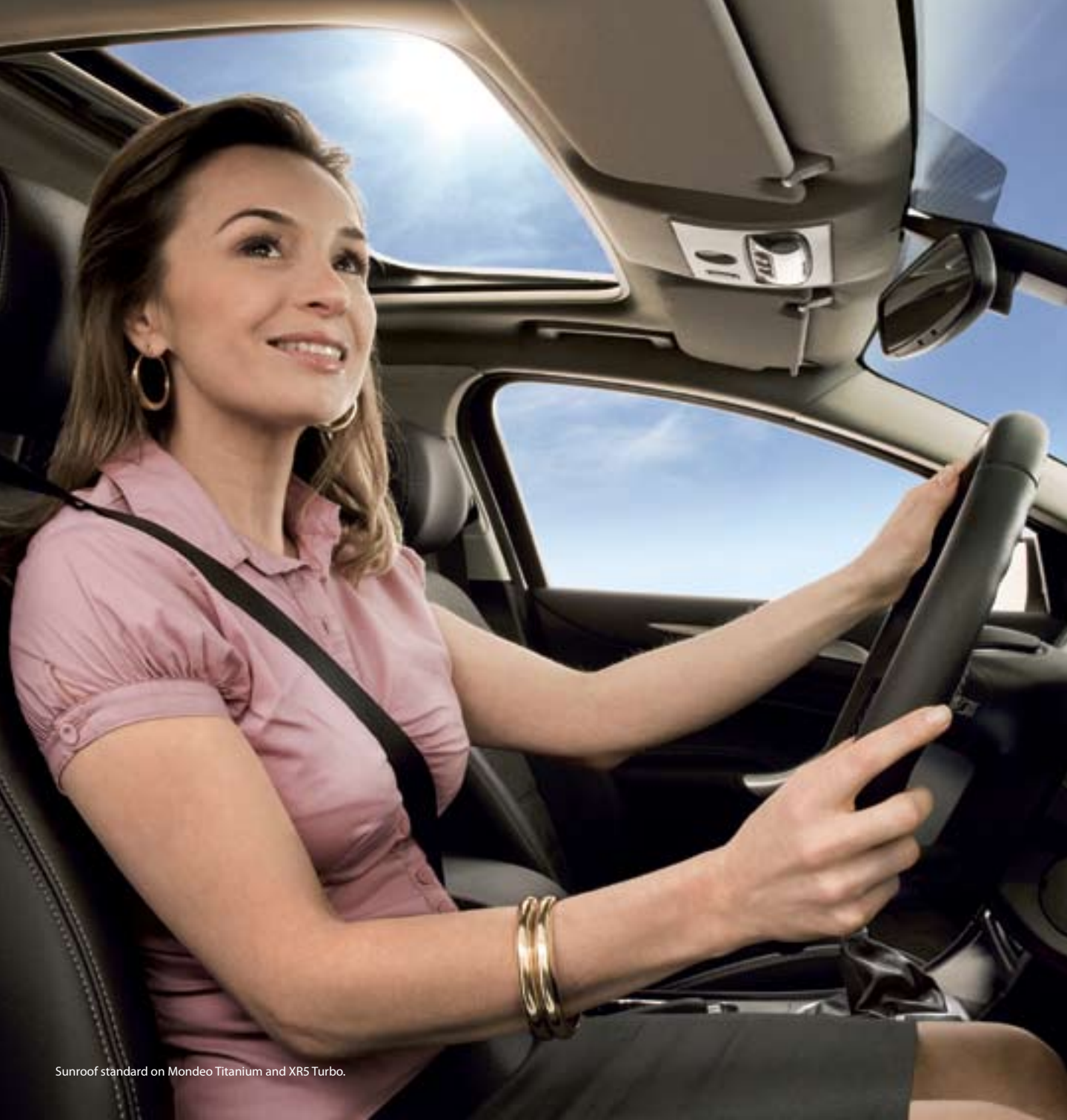
Sunroof standard on Mondeo Titanium and XR5 Turbo.