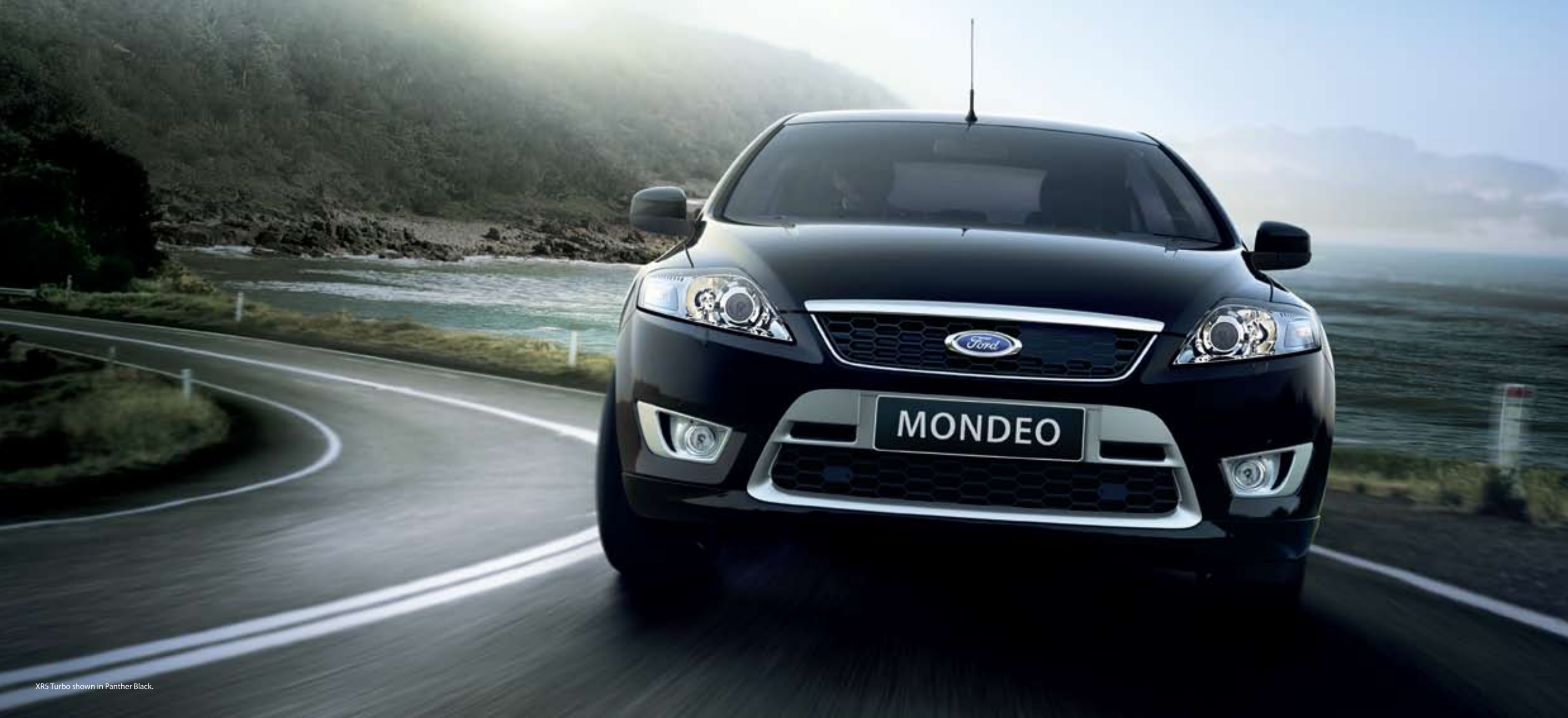
XR5 Turbo shown in Panther Black.