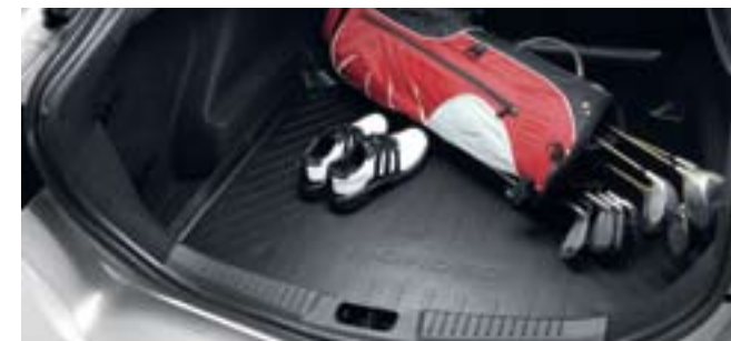
Waterproof boot liner helps keep boot area clean and dry.