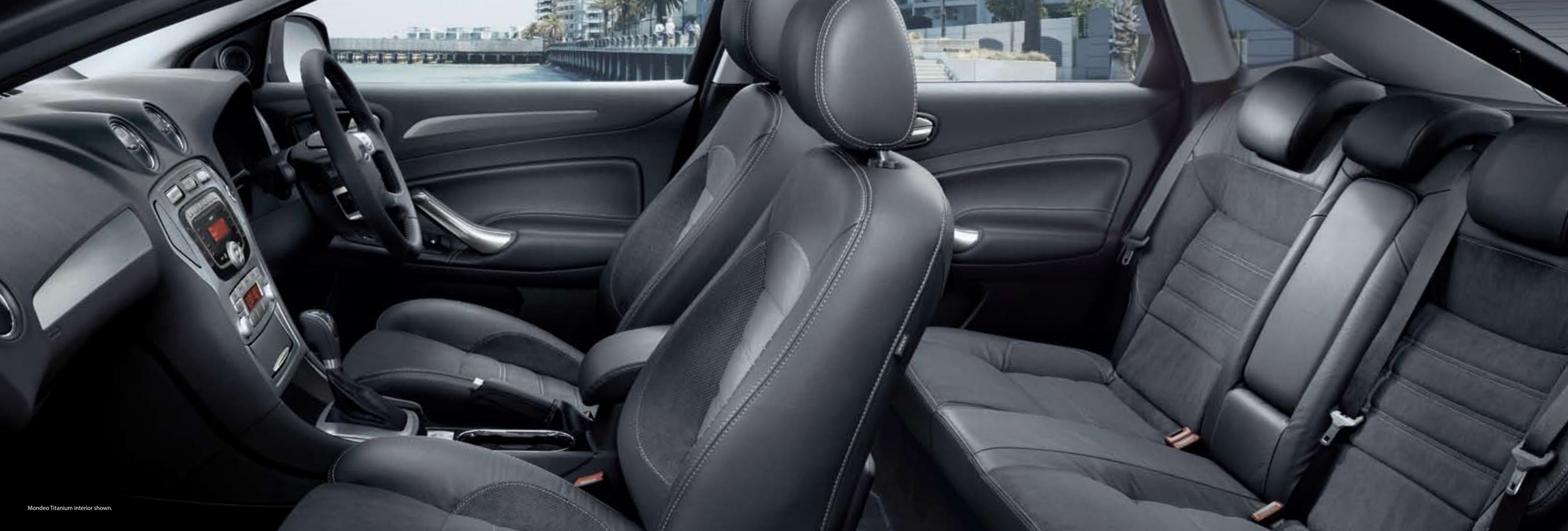
Mondeo Titanium interior shown.