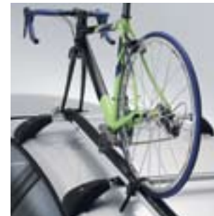
Carry bars and bike carrier (sold separately) for easy transport of bikes of all sizes.