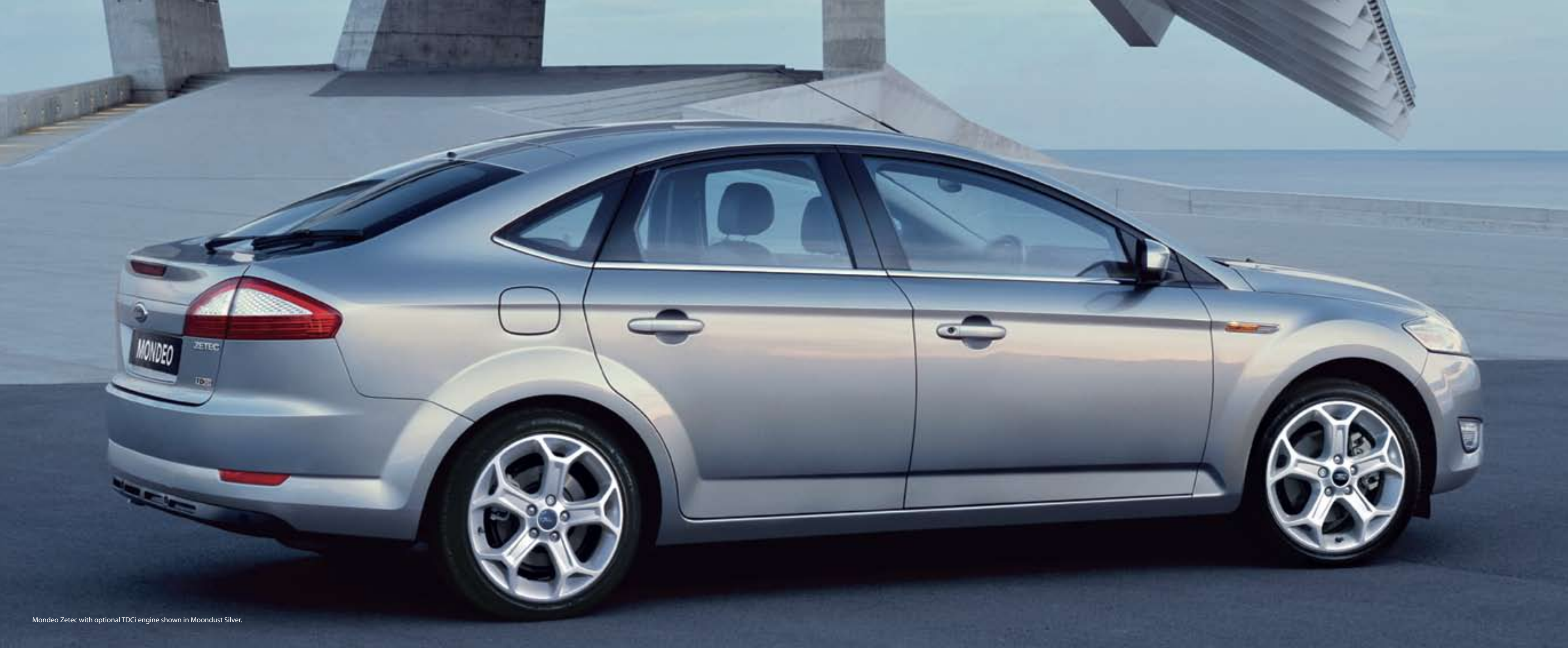
Mondeo Zetec with optional TDCi engine shown in Moondust Silver.