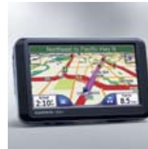
Garmin Nuvi 760 portable satellite navigation system.