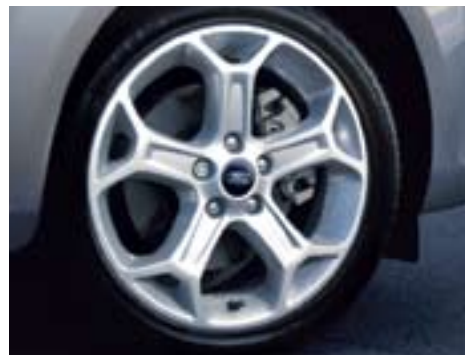
Standard Zetec 17" alloy wheels

Precision driving. It's what you'll experience each and every time you get behind the wheel of the Mondeo. It means that whether you're heading out of the city for a weekend or simply powering through traffic on your way to the office, the responsive engine, precision ride and smooth handling will make every drive a pleasure. In fact, everything that makes a journey as effortless and comfortable as possible has been considered, from the superior European build quality right through to the room and comfort inside the spacious cabin. And because everyone's driving needs are different there is a choice of petrol and diesel engines across the Mondeo range.