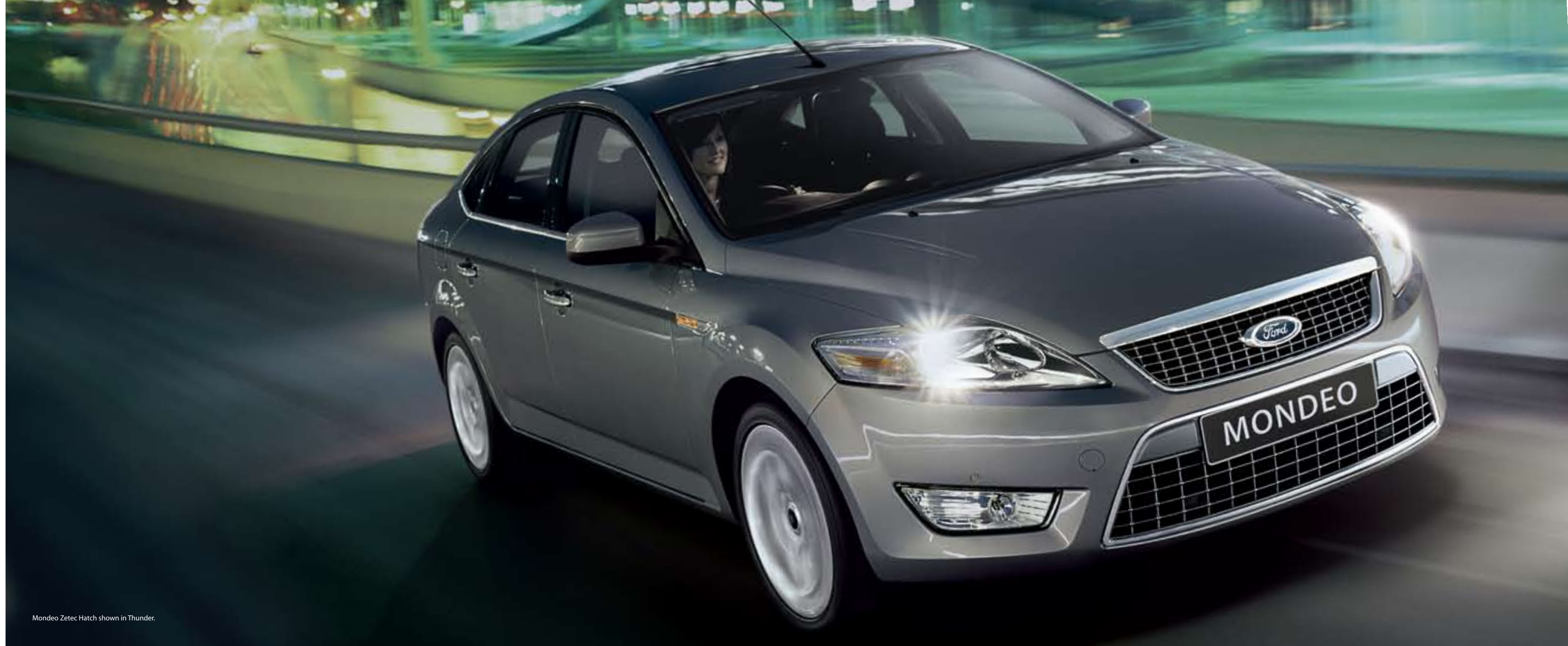
Mondeo Zetec Hatch shown in Thunder.