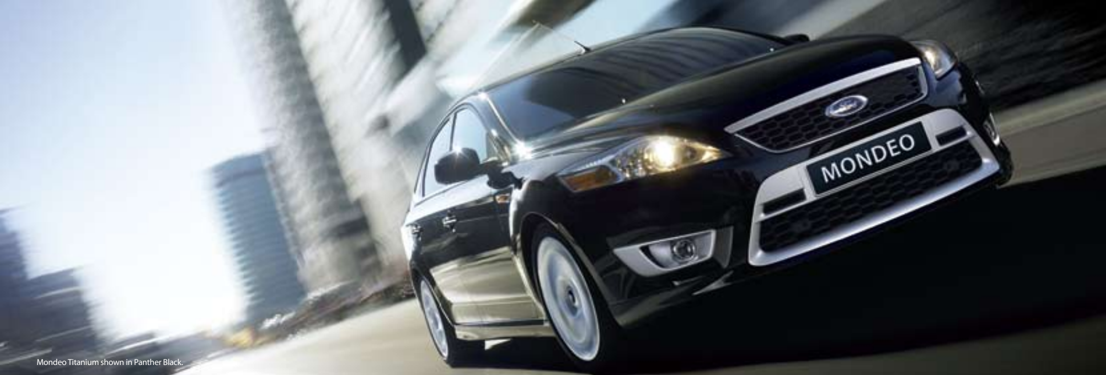
Mondeo Titanium shown in Panther Black.