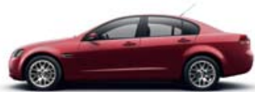
Red Passion Metallic