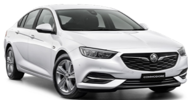
Liftback model shown.