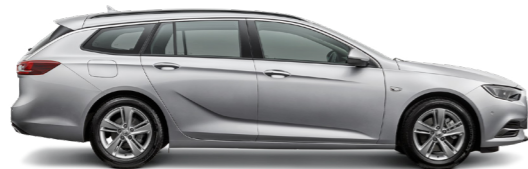
Sportwagon model shown.