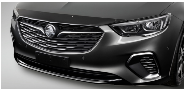
Smoked Bonnet Protector