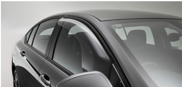
Full Weather Shield