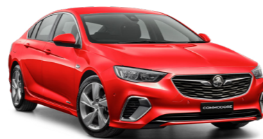
Liftback model shown.