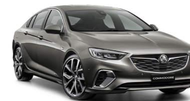
Liftback model shown.