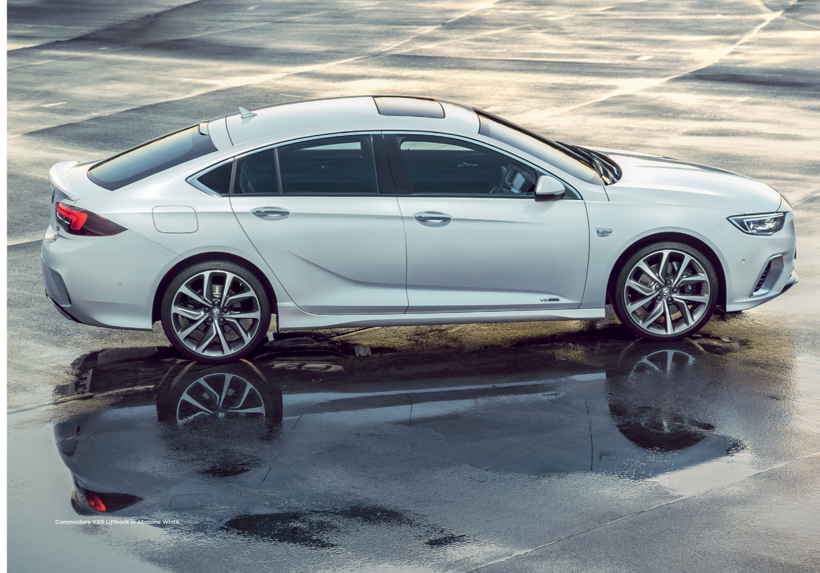
Commodore VXR Liftback in Abalone White.