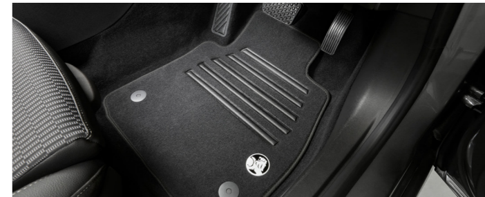
Front Floor Mats

We're sure you'll want to keep your new Commodore in top condition. That's why every accessory has been meticulously designed and manufactured to specifically protect your vehicle.