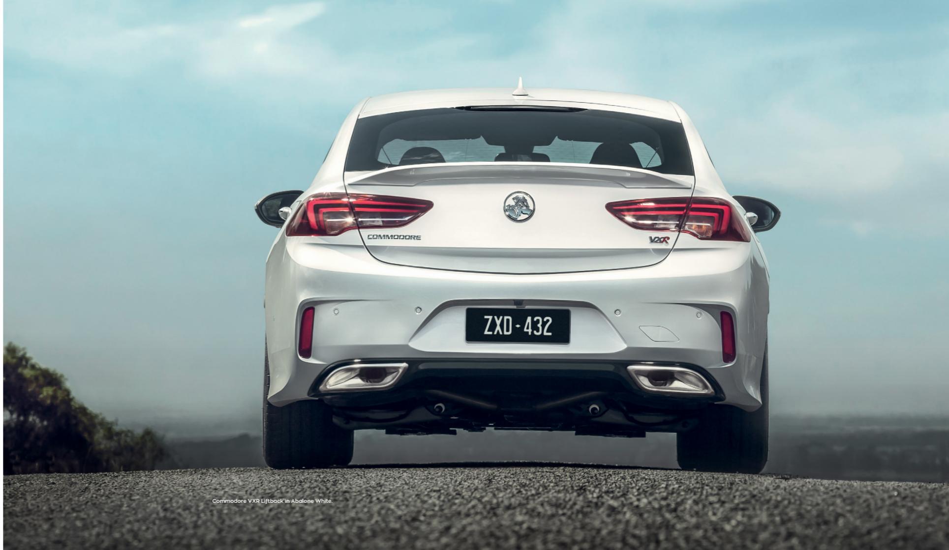
Commodore VXR Liftback in Abalone White.

With unprecedented levels of safety, a multitude of technological helping hands, and a driving experience that could only be described as no less than brilliant, this Commodore is for you, that's for sure.