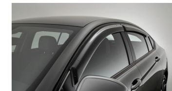
Slimline Weather Shield