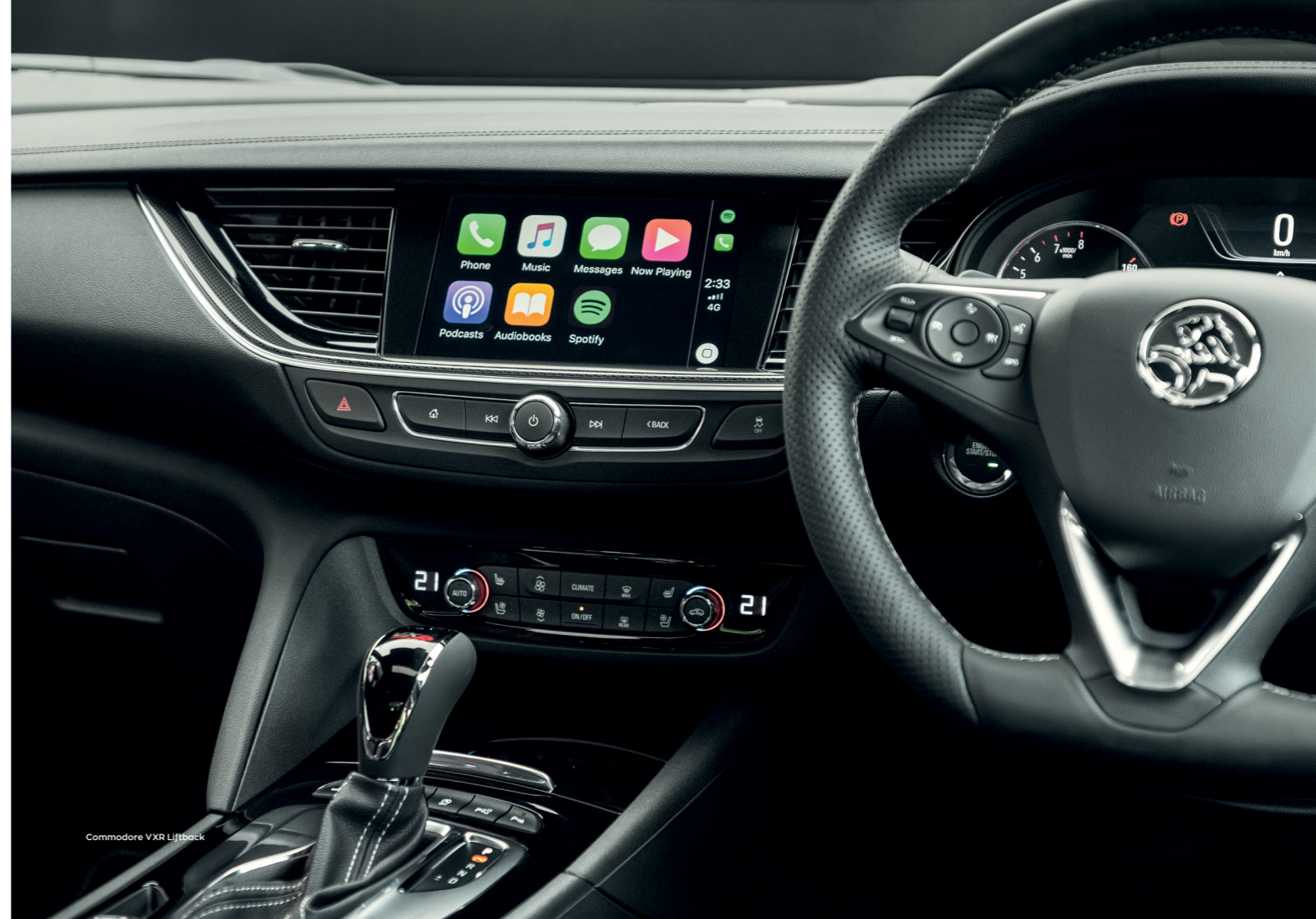
Commodore VXR Liftback