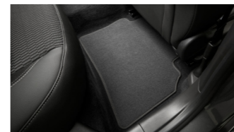
Rear Floor Mats