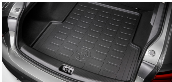
All Weather Boot Liner