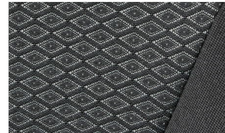
Jet Black cloth trim