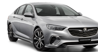
Liftback model shown.