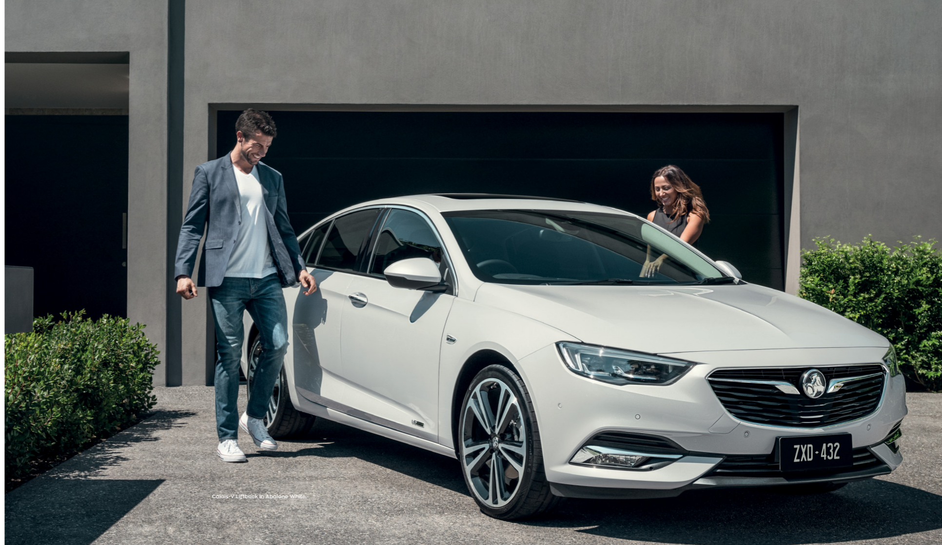
Calais-V Liftback in Abalone White.