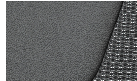
Jet Black cloth/Sportec trim