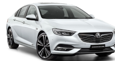
Liftback model shown.