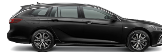
Sportwagon model shown.