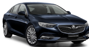
Liftback model shown.

Calais also available in Tourer model *Requires a compatible device