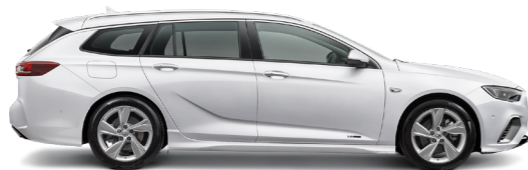
Sportwagon model shown.