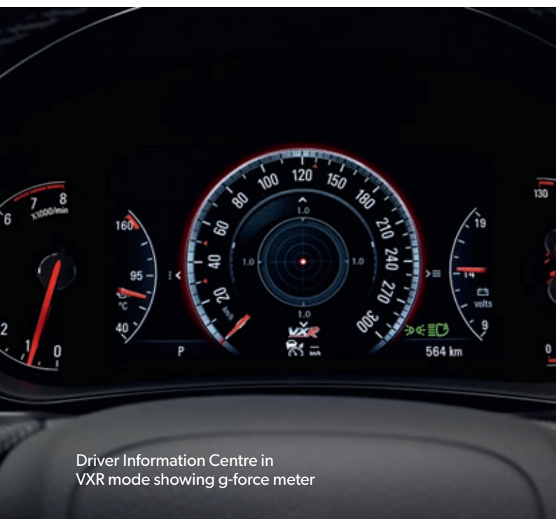
Driver Information Centre in VXR mode showing g-force meter

With Nürburgring-honed performance and leading technology all standard, Insignia sets a new mid-sized benchmark.