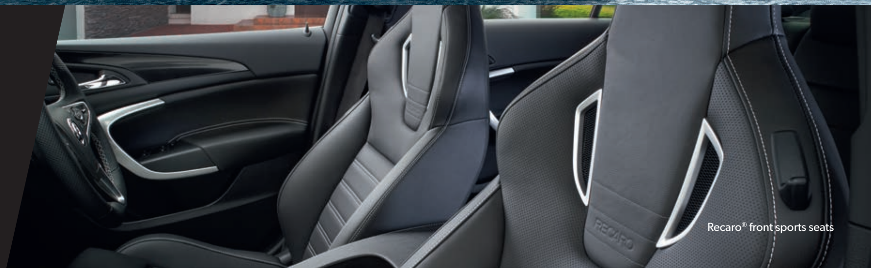
Recaro® front sports seats