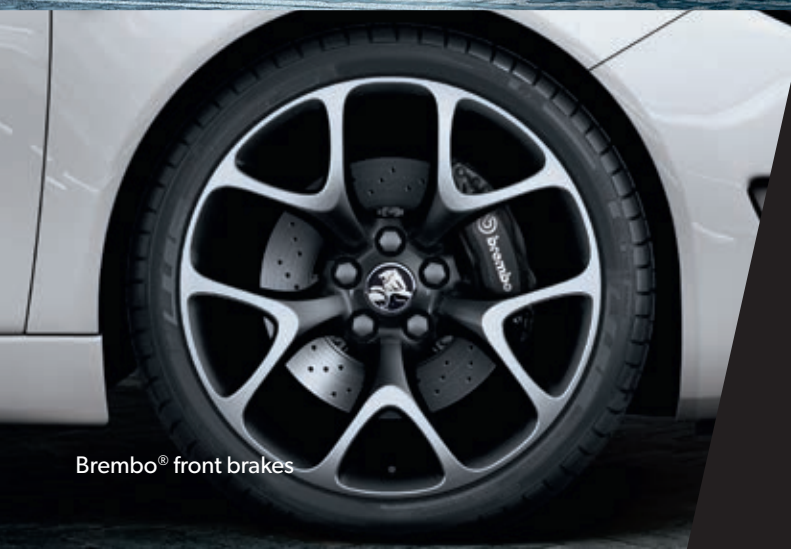
Brembo® front brakes

Make a statement with Insignia VXR sedan.