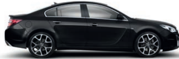
Carbon Flash Black*