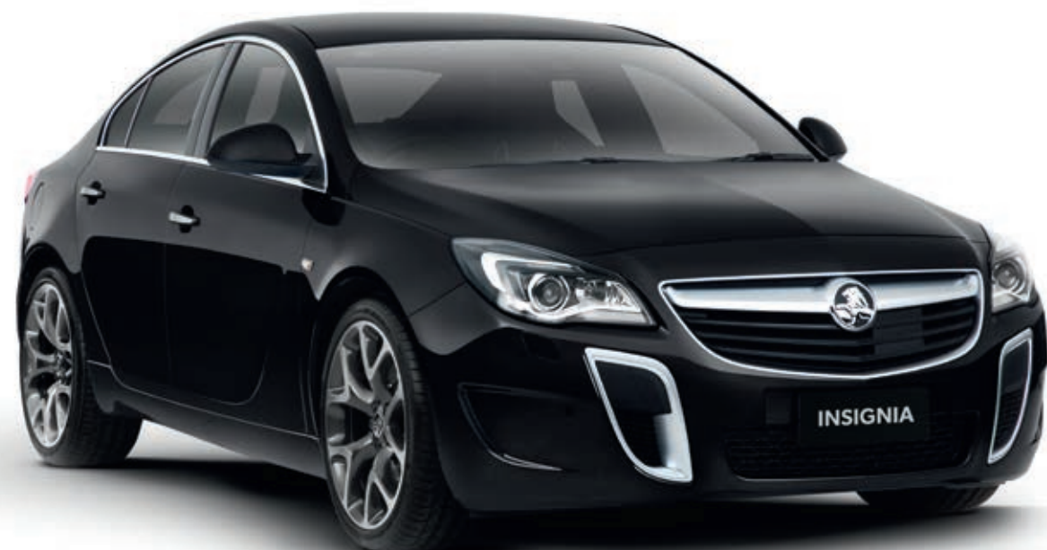
Insignia in Carbon Flash Black