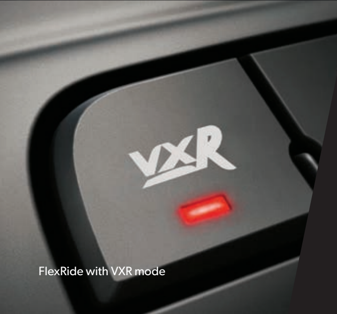
FlexRide with VXR mode