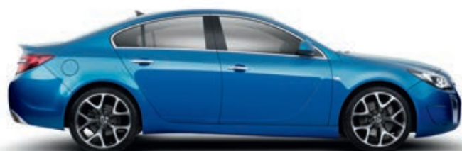
Insignia in Arden Blue