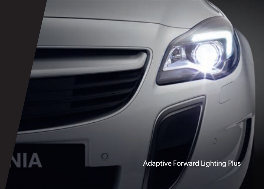
Adaptive Forward Lighting Plus