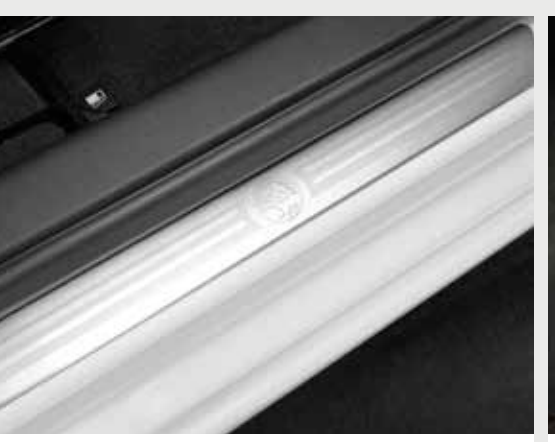
3: DRESS UP YOUR INTERIOR