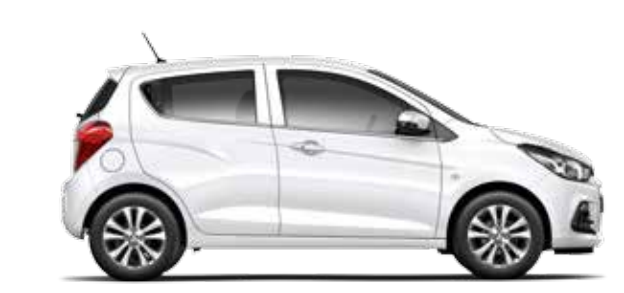
Spark LT in Summit White