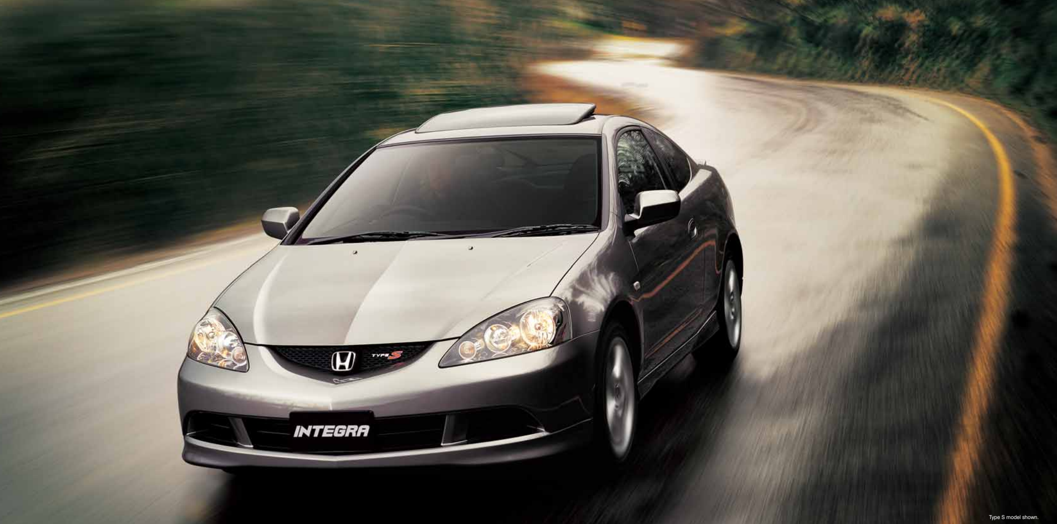
Type S model shown.