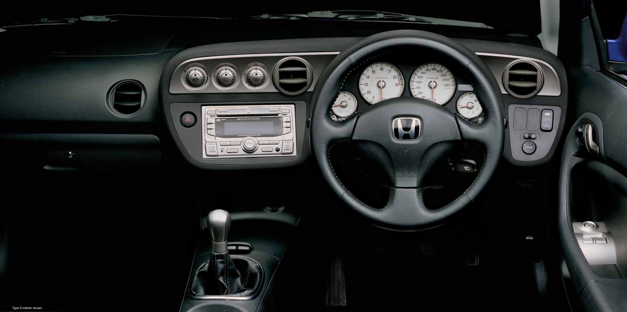
Type S interior shown.