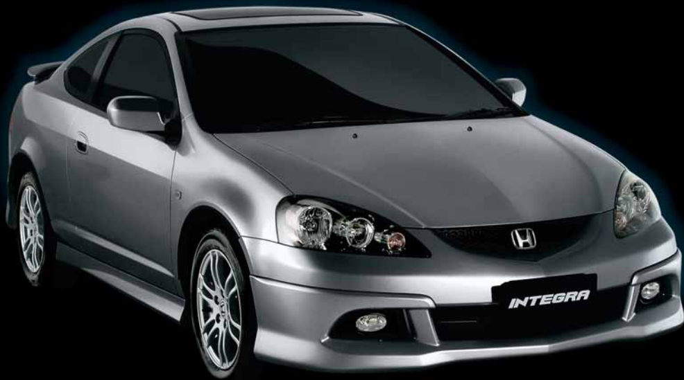
Luxury model shown.