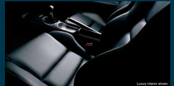
Luxury interior shown.

which allows for quick and easy shifts. In this way, economy of driver movement matches the efficiency of the i-VTEC engine. Or for even more convenience, there's the option of an advanced 5-speed sequential shift automatic transmission. Inspired by transmissions used in F1 racecars, it lets you upshift and downshift at the flick of the wrist. This provides the control and enjoyment of a manual, minus the clutch. In fully automatic mode it delivers crisp, clean shifting and uses Grade Logic Control to avoid gear hunting on up-hills and down-hills.