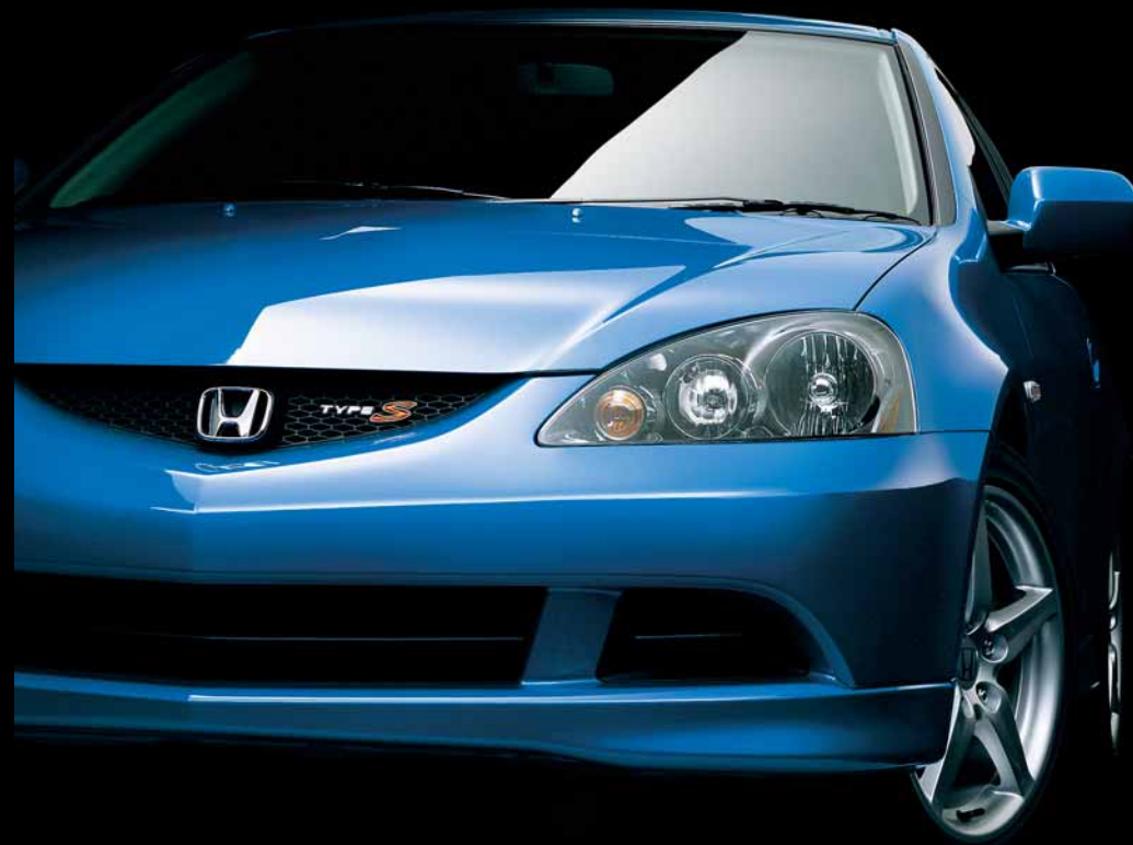
Type S model shown.