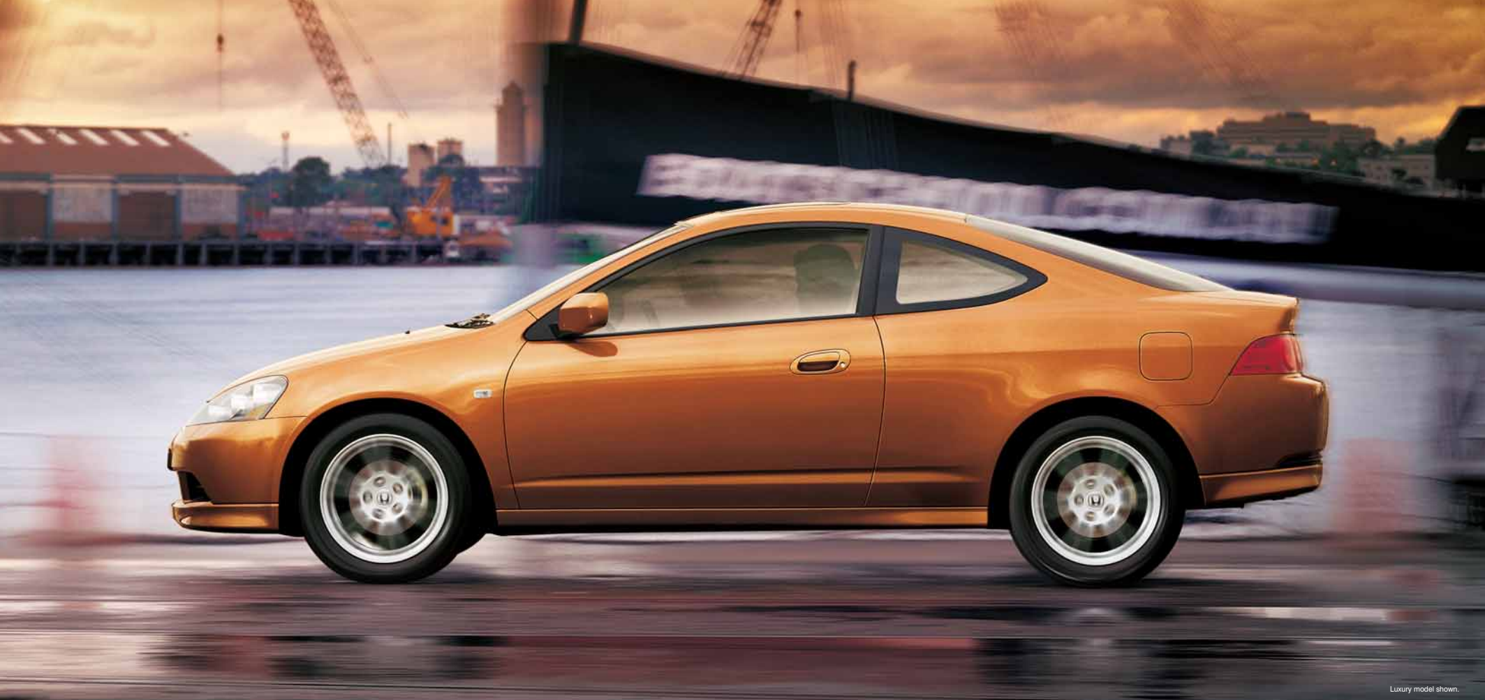
Luxury model shown.