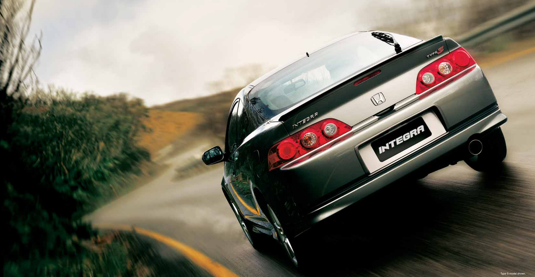
Type S model shown.