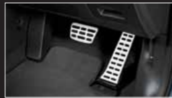
Alloy Sports Pedals • Easy to fit • Stylish