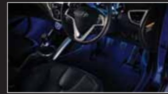
Interior Lighting • Illuminating • Stylish