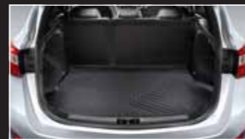
Cargo Liner • Contoured • High Quality Material