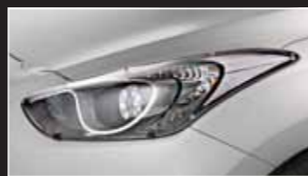
Headlight Protectors (set of 2) • UV Resistant • Shock-Resistant