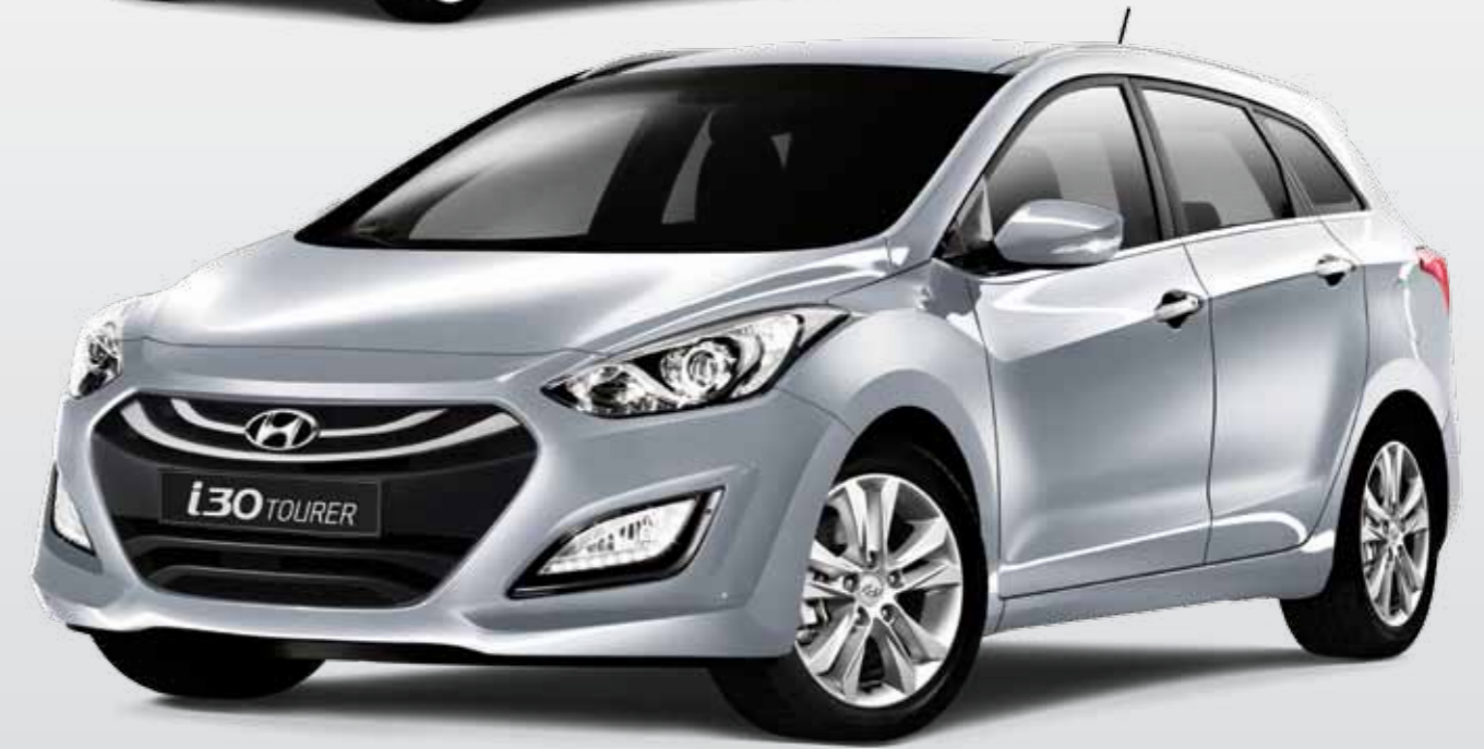
Hyundai i30 Tourer Elite shown in Sleek Silver.