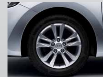
16-inch alloy wheels