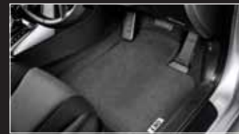
Tailored Carpet Floor Mats • Contoured • High Grade