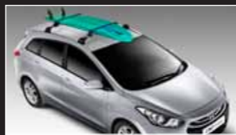
Surfboard Carrier • Easy to use • Securely Fastened