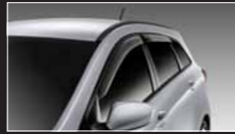
Tinted Stylevisors • Slimline • UV Resistant