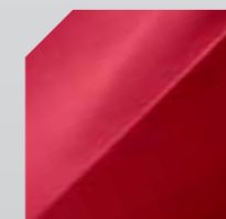
Cool Red TWR (Solid)