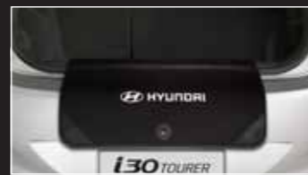
Fabric Rear Bumper Protectors • Heavy Duty • Non-Slip Backing