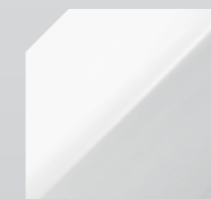
Creamy White TCW (Solid)