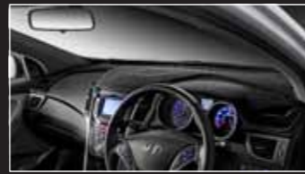
Dash Mat • Contoured • Colourfast