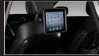
iPad® Holder 1 • Convenient • Functional