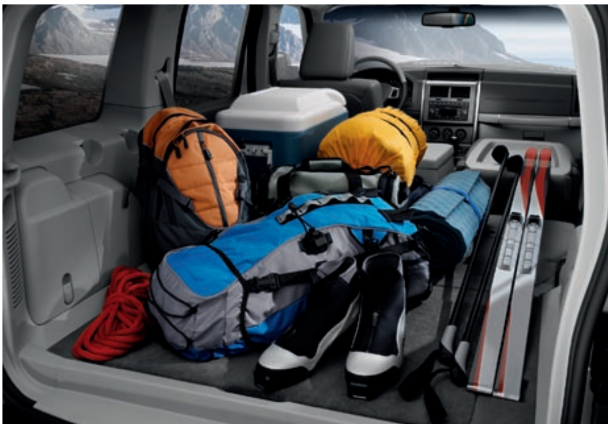
Jeep® Cherokee offers flexible seating and cargo options

(1) A range of vehicle curb weights is provided. Actual curb weight depends upon vehicle's equipment.