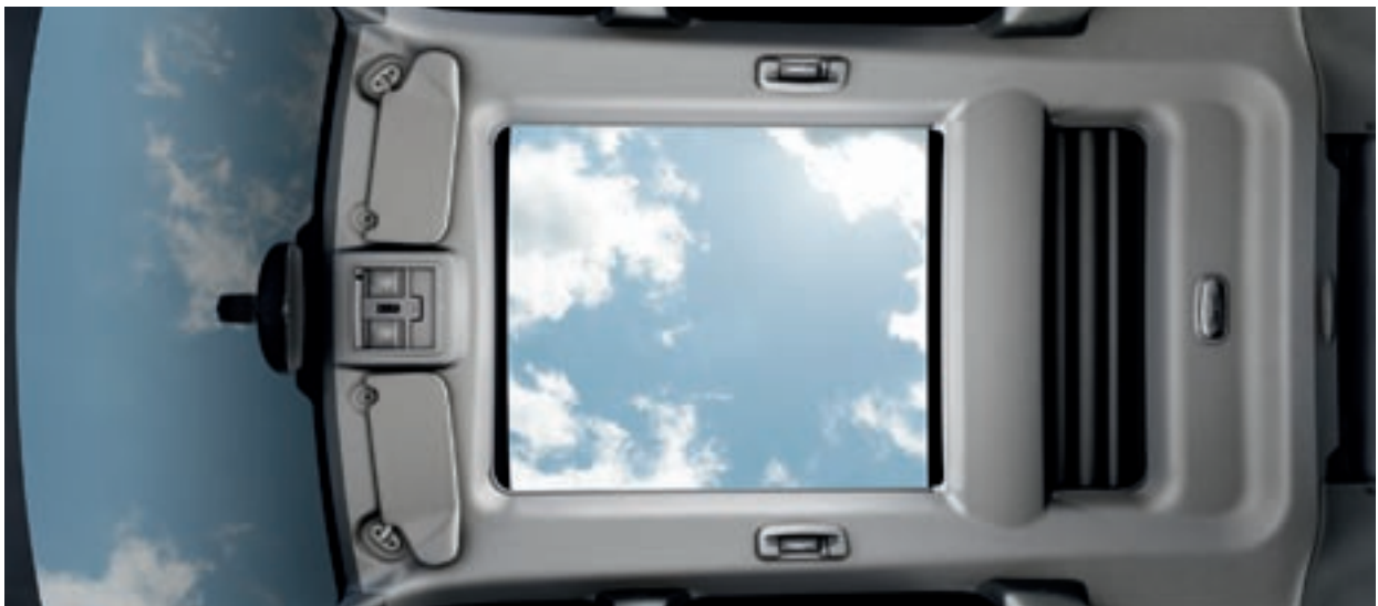
Industry-Exclusive Sky Slider™ Retractable Roof

(5) Not compatible with aftermarket fabric-protecting coatings.