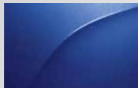
Electric Blue #