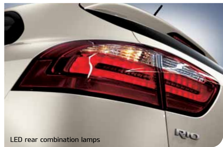
LED rear combination lamps