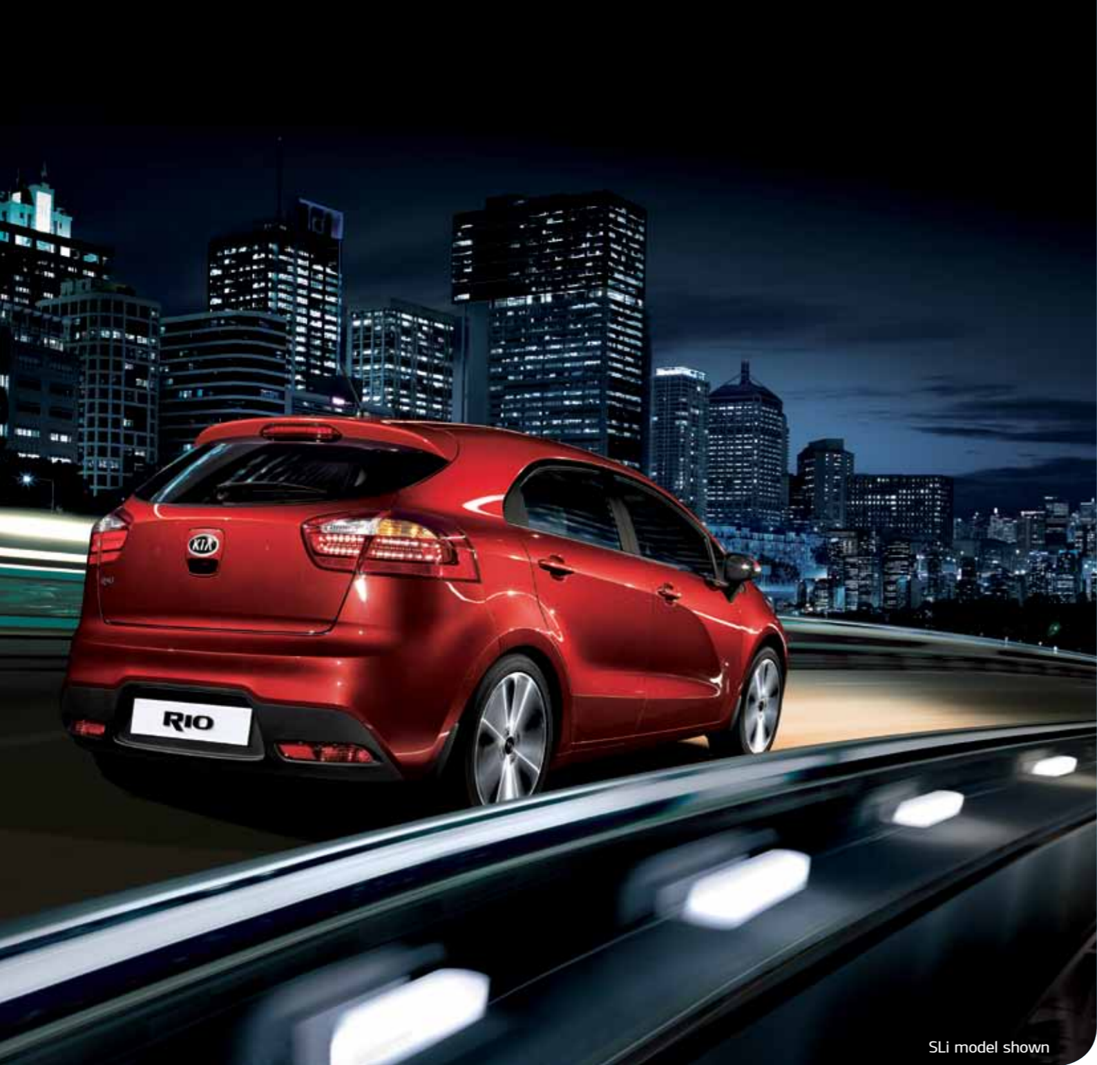
SLi model shown