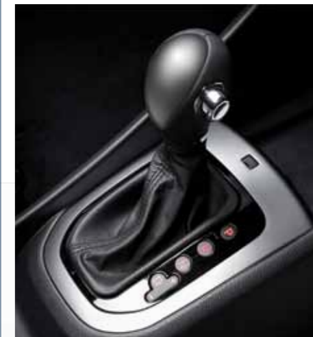
Automatic transmission Smooth shifting and outstanding fuel economy, in a choice of 4 or 6-speed. (S model only)

*Fuel consumption figures are based on ADR81/02 test results. They are useful in comparing the fuel consumption of different vehicles. They may not be the fuel consumption achieved in practice. This will depend on traffic, road and vehicle conditions, driving styles, vehicle loads and options/accessories.