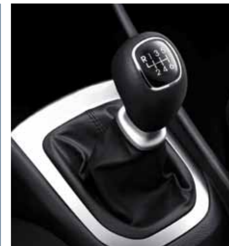
Manual transmission Smooth shifting assured, with the 6-speed gearbox.