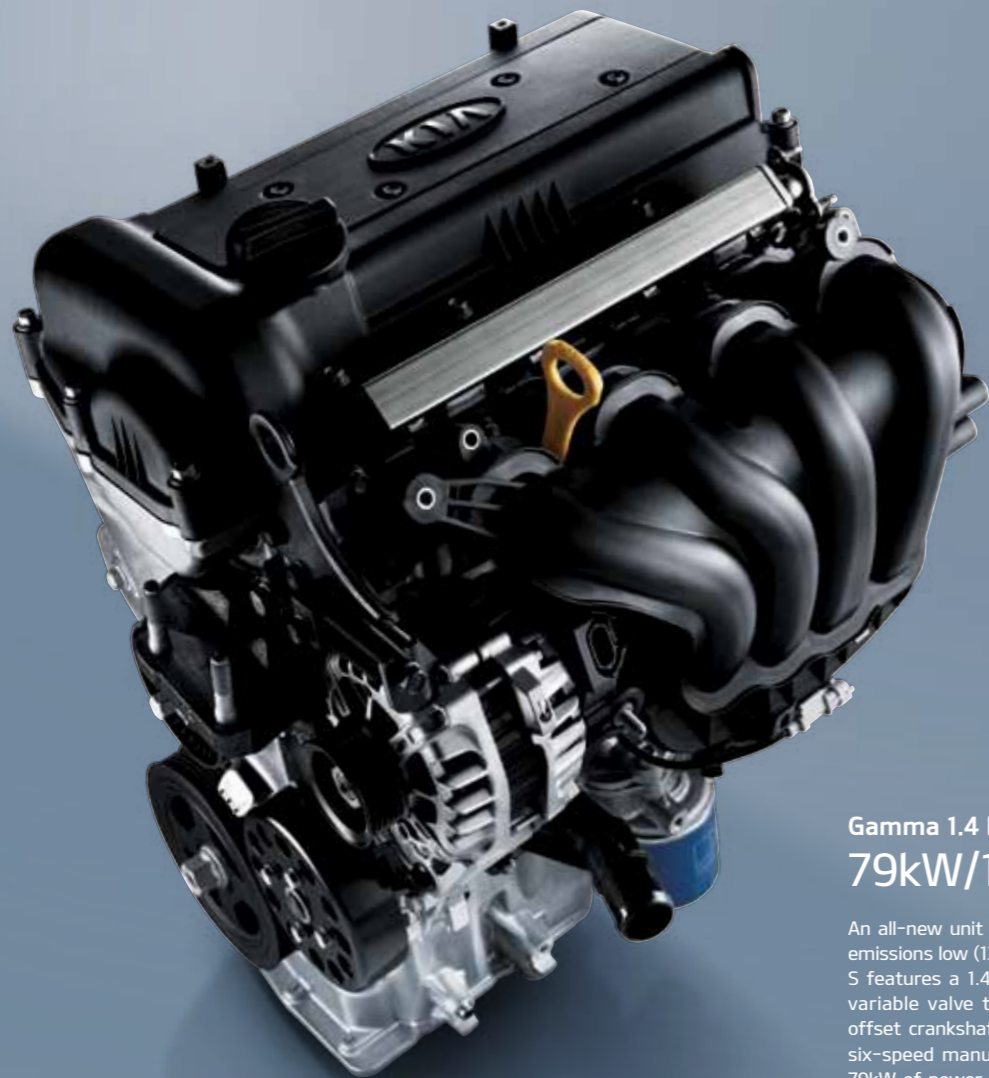
Gamma 1.4 MPI Petrol Engine 79kW/135Nm

Under the bonnet of the Reborn Rio lives your choice of a new Gamma series 1.4 MPI petrol engine, or a 1.6 GDi petrol engine. Durable, quiet and smooth-running, the 1.4 engine has been designed to be as reliable as it is economical, while the 1.6 GDi engine remains the only car in its class to offer more than 100kW of power.