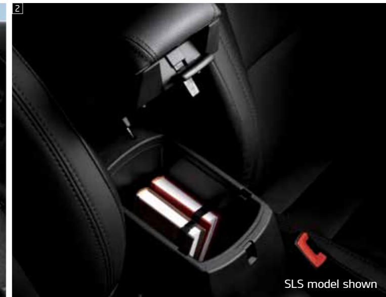
SLS model shown