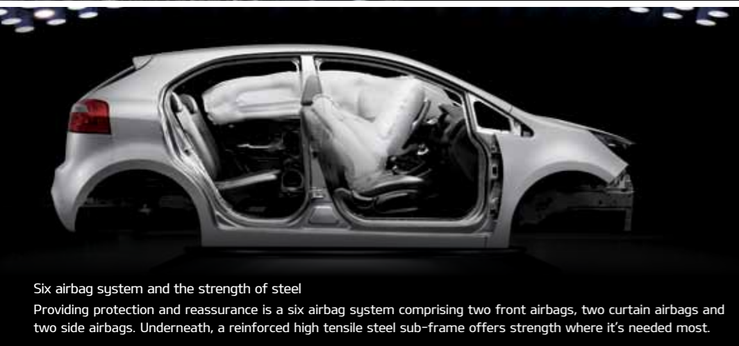
Six airbag system and the strength of steel Providing protection and reassurance is a six airbag system comprising two front airbags, two curtain airbags and two side airbags. Underneath, a reinforced high tensile steel sub-frame offers strength where it's needed most.