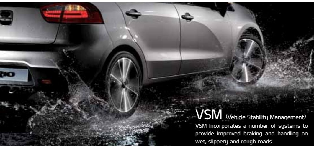
VSM (Vehicle Stability Management) VSM incorporates a number of systems to provide improved braking and handling on wet, slippery and rough roads.

Drive the Rio and along with power, efficiency and performance come low emissions and reduced fuel consumption, not to mention safety specifications of the highest order. From a structural framework that absorbs impact forces in both frontal and side-on collisions to a range of active and passive safety measures, the Rio is built to protect those that matter.