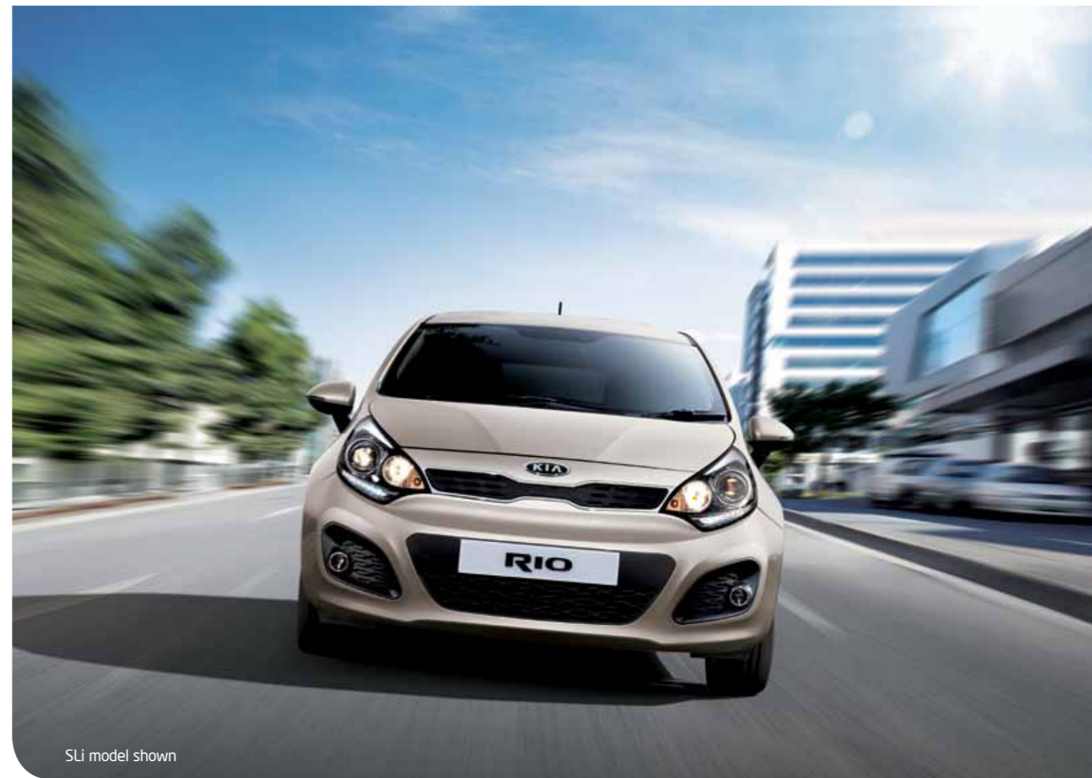
SLi model shown

As you see, what you do on a small scale with your household recycling, we at Kia Motors do on a large scale around the world.