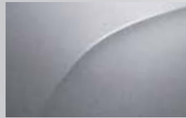
Bright Silver #