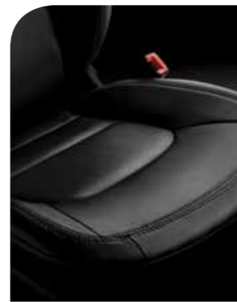
SLS model shown

The Reborn Rio combines sporty style with the latest technology, advanced features and low emissions to make a 3-door car that really delivers. The sportiest of the three Rio body styles, it's sure to impress.