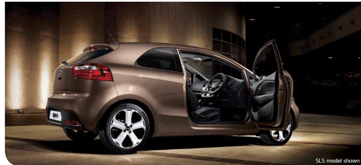
SLS model shown

Designed by Europe's finest, the Reborn Rio means small is no longer cute. The new small is a bantamweight that packs up to 103kW of punch. The new small is a 6-speed that leaves lesser transmissions for dead. The new small offers a gutsy GDi engine that delivers a dynamic and sporty performance. The new small is the Reborn Rio.