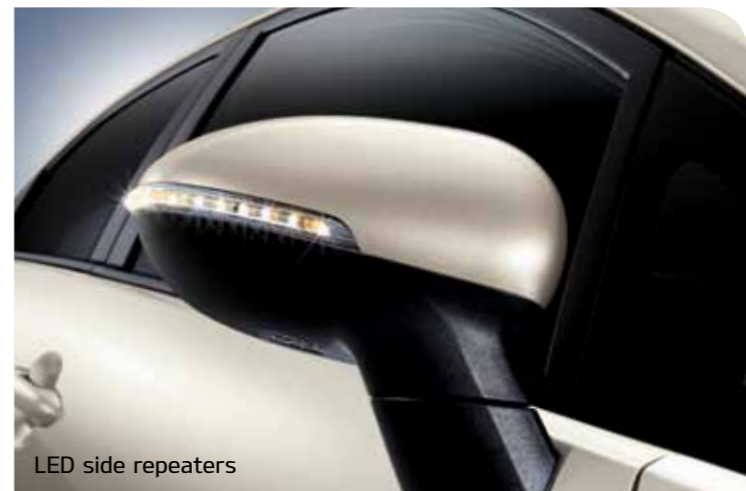
LED side repeaters