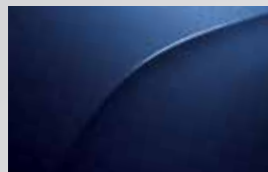
Deep Blue #