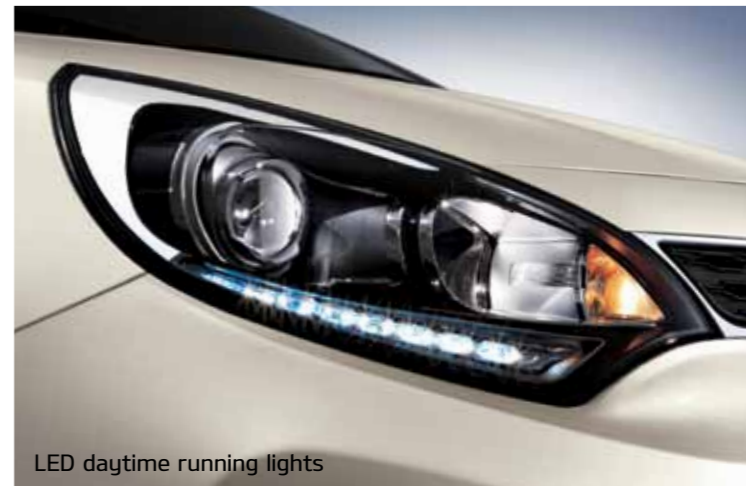
LED daytime running lights