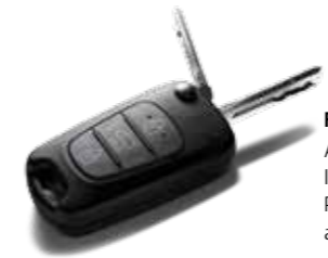
Folding key A compact device that locks and unlocks the Rio with the touch of a button.

Engineered to be a car with features that are cutting-edge yet effortlessly simple to use, the interior of the Reborn Rio is full of intuitive design. With switches positioned for ultimate convenience - such as steering wheel-mounted controls for the audio system and cruise control - you can operate numerous controls without having to take your hands from the wheel. What's more, a highly visible supervision cluster incorporates an on-board trip computer, while the steering wheel itself is tilt and telescopically adjustable so that you can find your perfect driving position. (Si / SLi / SLS models)