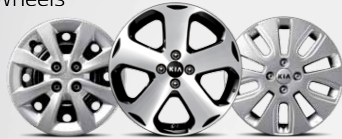
15-inch Steel Wheel (S model)