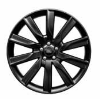
21" 10 SPOKE 'STYLE 1033' WITH GLOSS BLACK FINISH