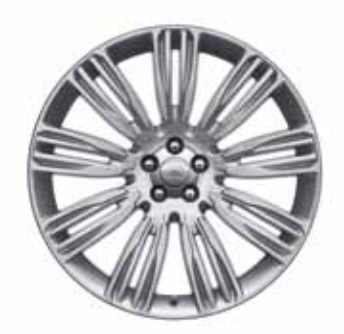
22" 9 SPLIT-SPOKE 'STYLE 9007'