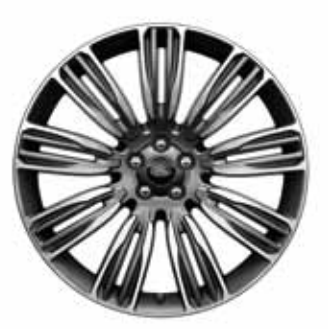
22" 9 SPLIT-SPOKE 'STYLE 9007' WITH DIAMOND TURNED FINISH