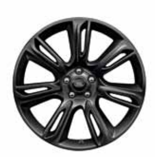
20" 7 SPLIT-SPOKE 'STYLE 7014' WITH GLOSS BLACK FINISH