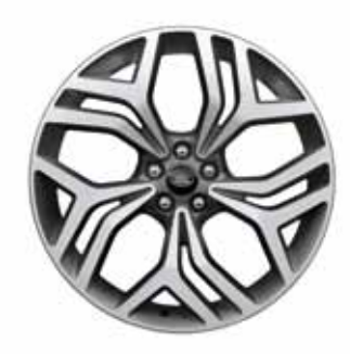
21" 5 SPLIT-SPOKE 'STYLE 5047' WITH DIAMOND TURNED FINISH