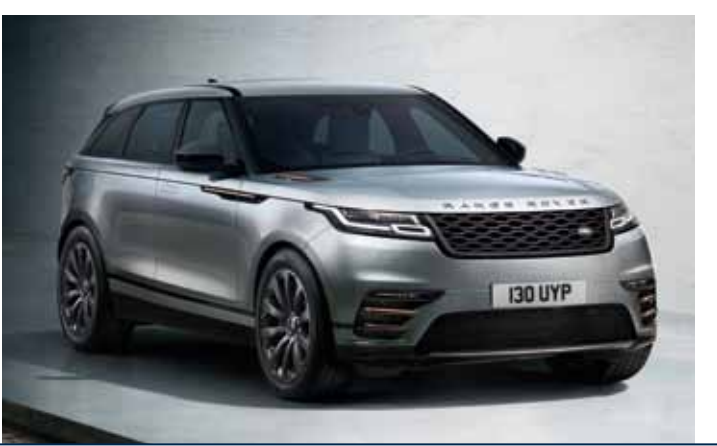
R-DYNAMIC - HSE