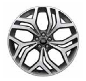
21" 5 SPLIT-SPOKE 'STYLE 5047' WITH DIAMOND TURNED FINISH