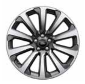
20" 10 SPOKE 'STYLE 1032' WITH DIAMOND TURNED FINISH