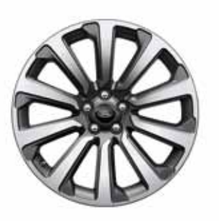
20" 10 SPOKE 'STYLE 1032' WITH DIAMOND TURNED FINISH