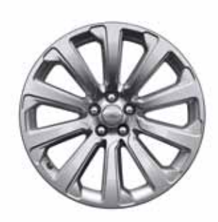
20" 10 SPOKE 'STYLE 1032'