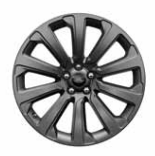
20" 10 SPOKE 'STYLE 1032' WITH SATIN DARK GREY FINISH