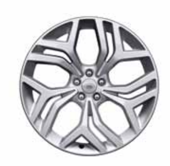
21" 5 SPLIT-SPOKE 'STYLE 5047'