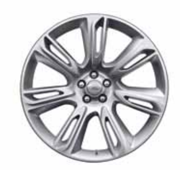
22" 7 SPLIT-SPOKE 'STYLE 7015'