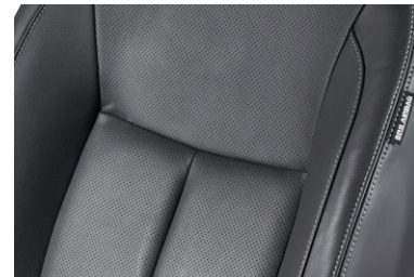
Interior leather accented seat trim † (ST-X).

** GVM = Gross Vehicle Mass. GVM is the maximum laden mass of a motor vehicle.