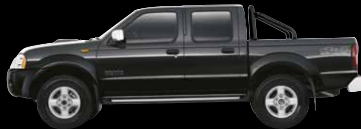
Black Obsidian (KH3)

Printed colours may vary from the actual paint colours. *Indicates a metallic paint, which is available at extra cost.