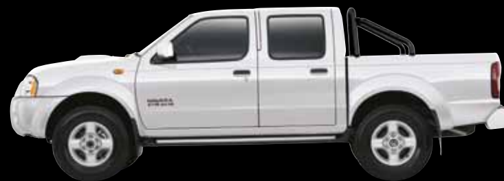
Polar White (QM1)

*Ask your Nissan Dealer to explain exactly what items are covered in each Scheduled Service. Applies to the first 12 X 10,000kms scheduled service intervals for up to 6 years/120,000kms (whichever occurs first). Some exclusions apply. Ask your Nissan Dealer or visit nissan.com/cpstcs for full terms and conditions.