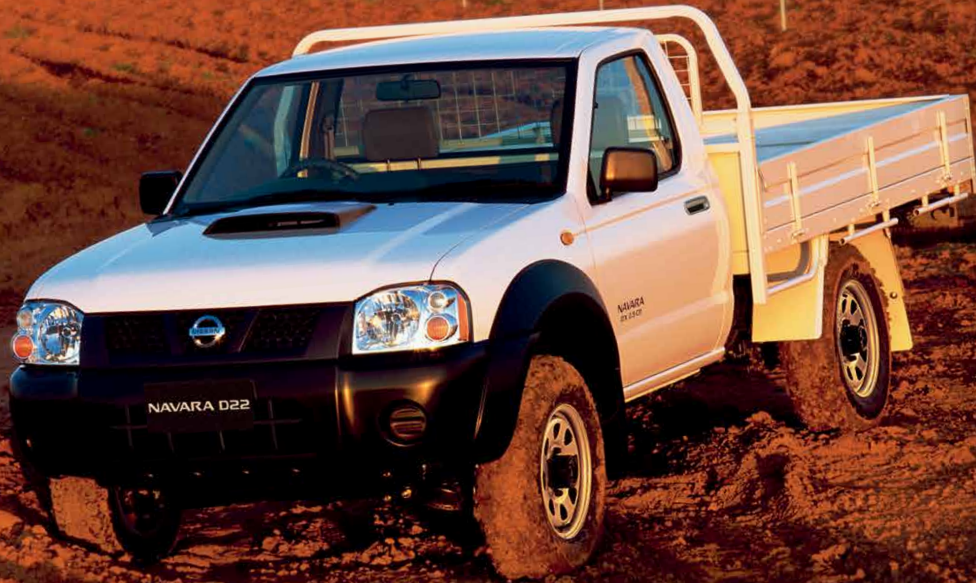
Polar White DX Single Cab 4x4 with optional steel tray painted white (rectangular hollow square headboard).