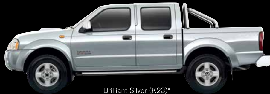
Brilliant Silver (K23)*