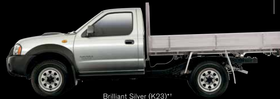
Brilliant Silver (K23)*†