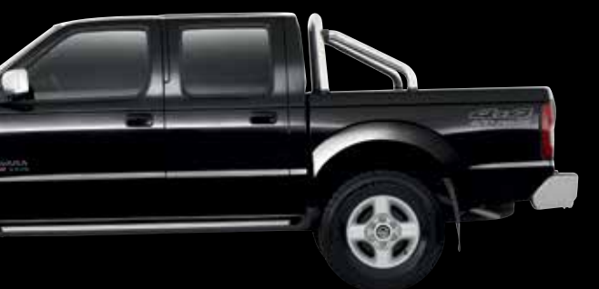
Cosmic Black (G42)†