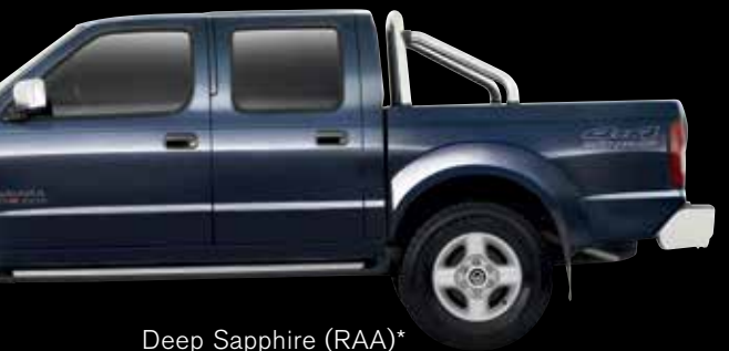
Deep Sapphire (RAA)*