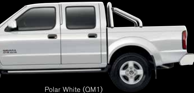
Polar White (QM1)