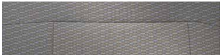
DX 4x4 Interior.