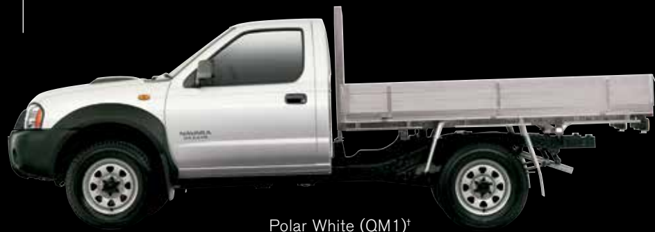
Polar White (QM1)†