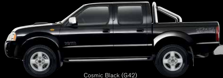
Cosmic Black (G42)