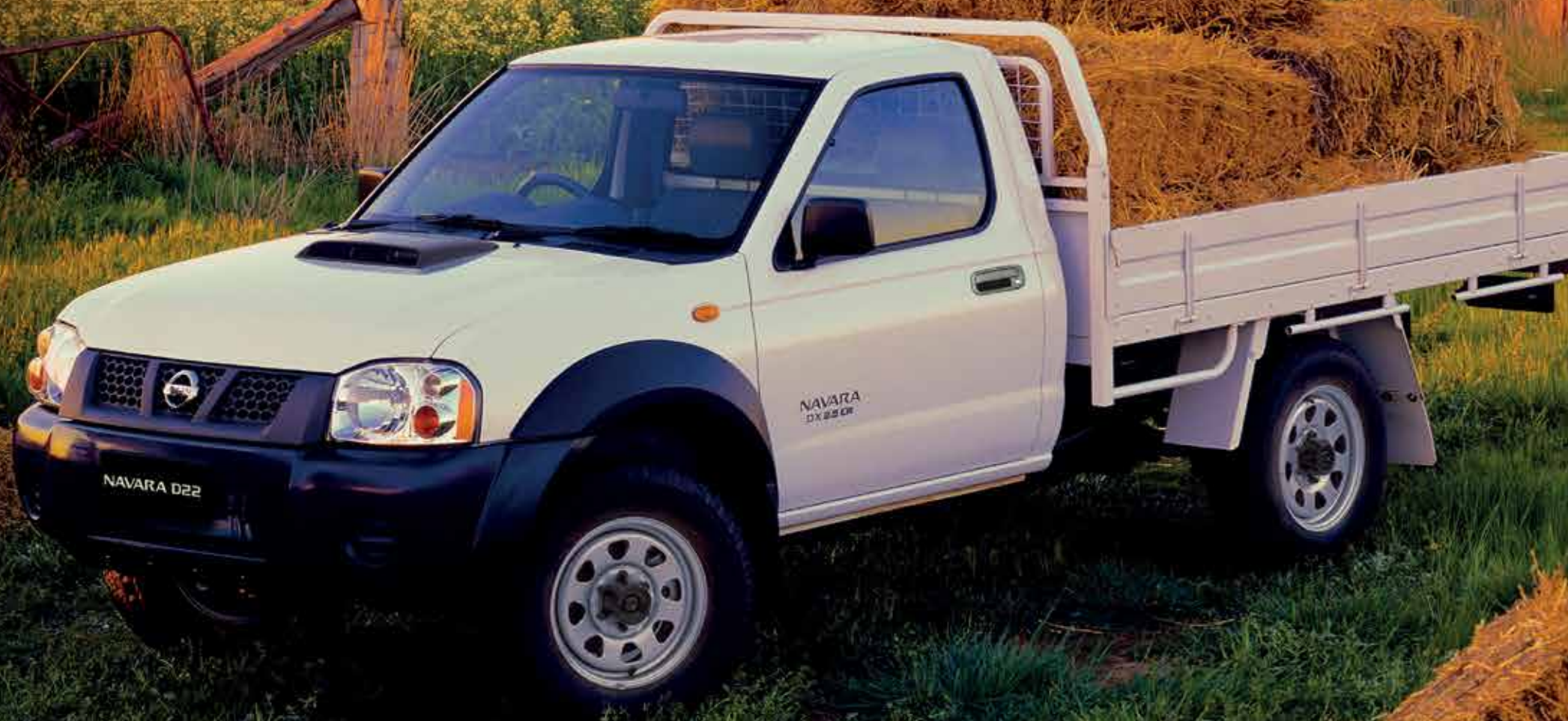
Polar White DX Single Cab 4x4 with optional steel tray painted white (rectangular square headboard).

The 5-speed manual transmission offers clean and easy shift changes and when moving large loads, the braking system's load sensing valve increases braking power to the rear, making light work of tough jobs.