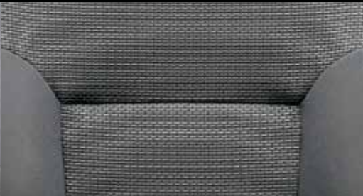
Grey cloth interior seat trim (DX)