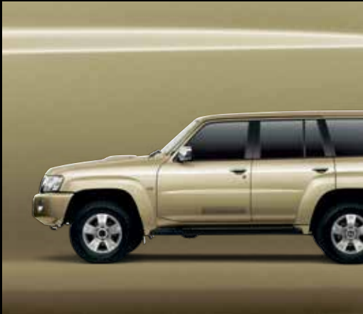
Desert Gold (EYO)^