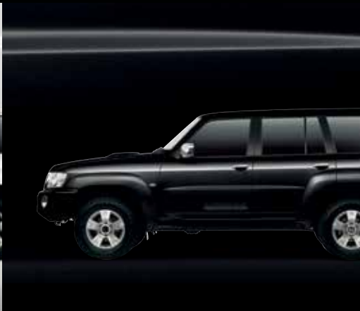
Black Obsidian (KH3)*