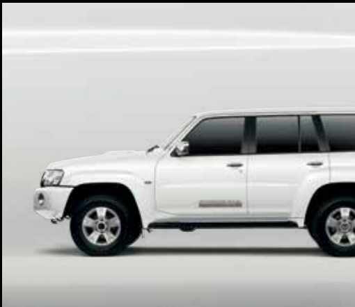
Polar White (QM1)