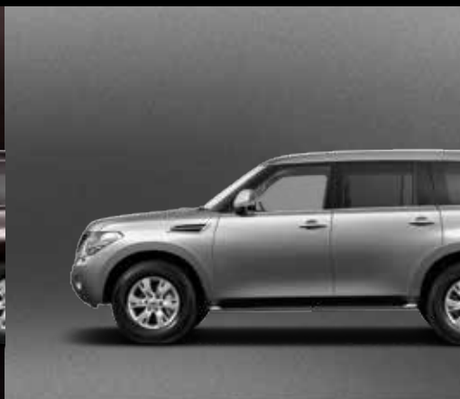
Precision Grey (K51)*