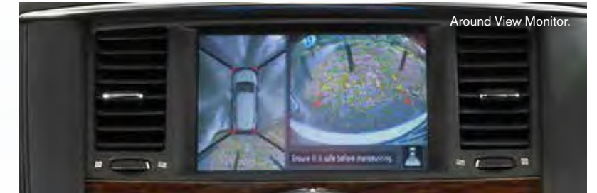
Around View Monitor.

A huge array of groundbreaking technologies have led to the Nissan Patrol being amongst the safest vehicles in its class. Technologies within the top of the line Ti-L model includes Intelligent Cruise Control, Tyre Pressure Monitoring System, Forward Collision Warning, Lane Departure Warning and Prevention and more.