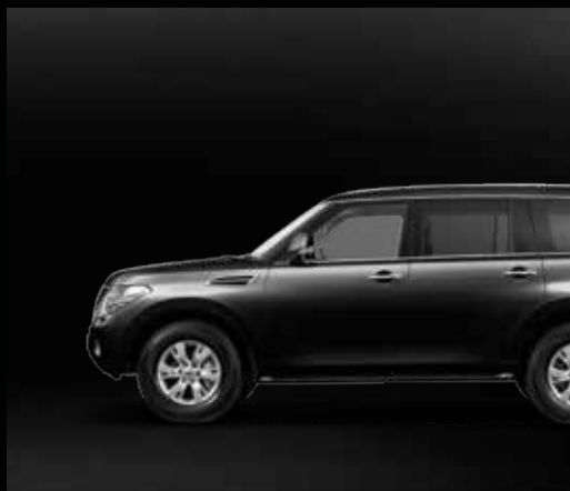
Black Obsidian (KH3)