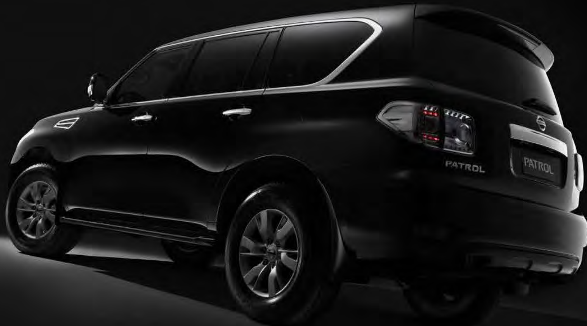
Ti-L model in Black Obsidian.