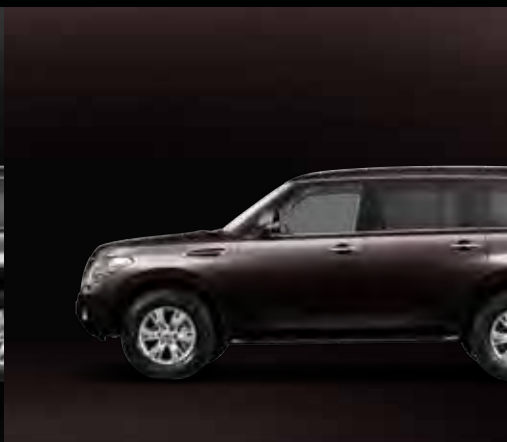
Deep Earth Brown (L50)*