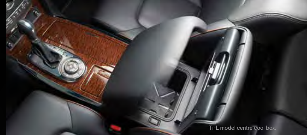
Ti-L model centre cool box.