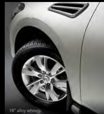
18" alloy wheels.