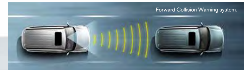
Forward Collision Warning system.

The Around View Monitor ^ in the Nissan Patrol Ti-L model allows drivers to get in and out of tight spots with ease by providing a simulated bird's eye view directly on screen.