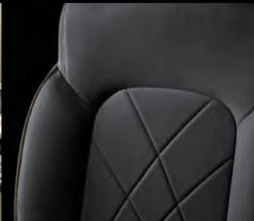
ST-L interior black cloth seat trim.