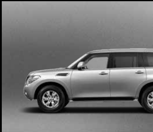
Brilliant Silver (K23)*