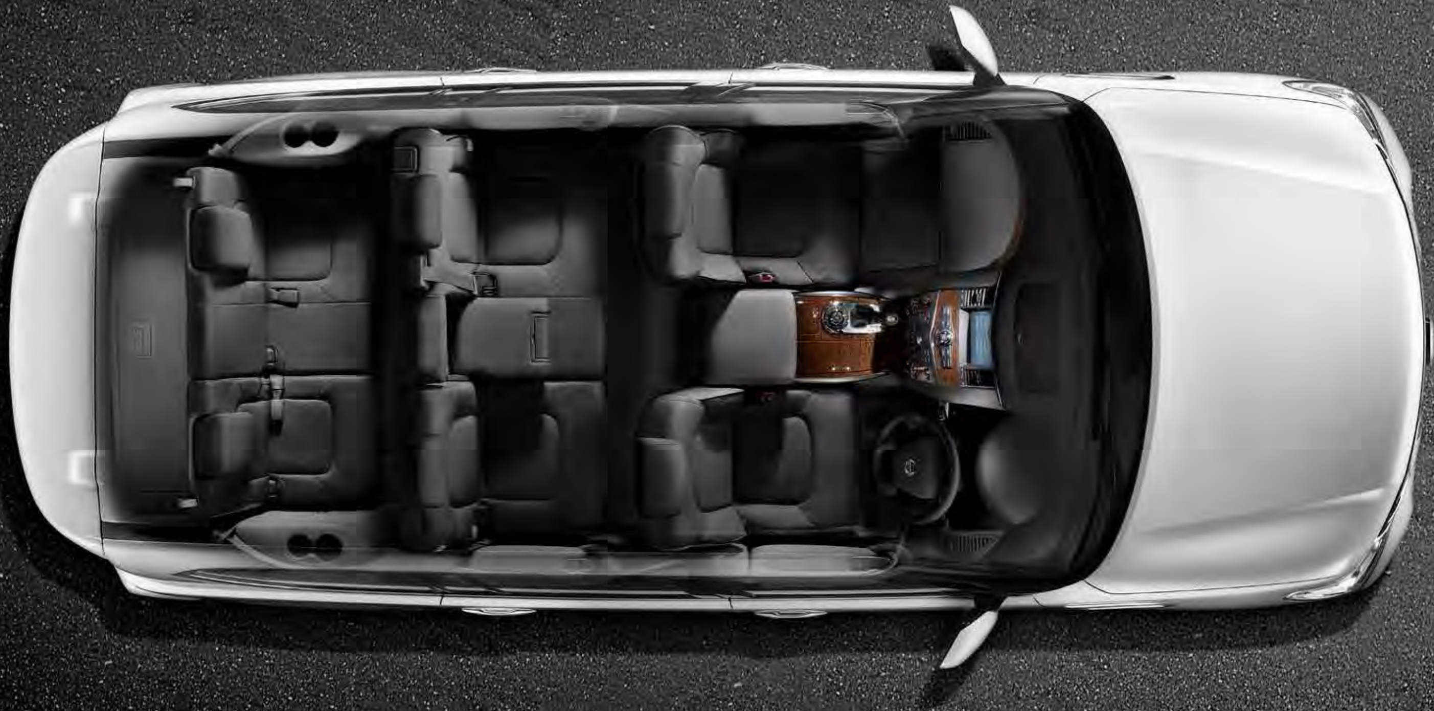
Ti-L model in Brilliant Silver.