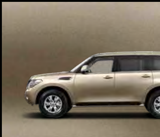
Desert Dune (HAE)*