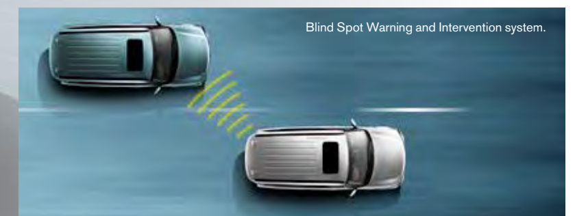
Blind Spot Warning and Intervention system.

An incredibly innovative Blind Spot Warning and Intervention system detects vehicles in your blind spot and alerts you via an audible alarm. If for instance you continue to change lanes and the car in your blind spot also continues to proceed, the system will initiate, gently braking one side of the vehicle, bringing your vehicle back to your original lane position, well out of harms way.