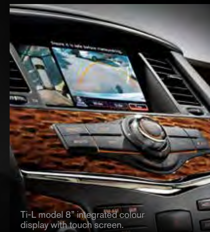
Ti-L model 8" integrated colour display with touch screen.

To release a vehicle as advanced as the all-new Nissan Patrol without reimagining the aesthetic and design would be almost unforgivable. To bring the Nissan Patrol into the future, modern, sophisticated, refined and as some may put it, luxurious stylings play a major part in the grand design. From modern lines, chrome door handles, black leather accented trim (Ti and Ti-L models only), sleek polished metal fittings and the ability to seat 7 in the Ti-L model, up to 8 in the ST-L and Ti models through a range of various configurations, the all-new Nissan Patrol plays a dual role as both the beauty and the beast.