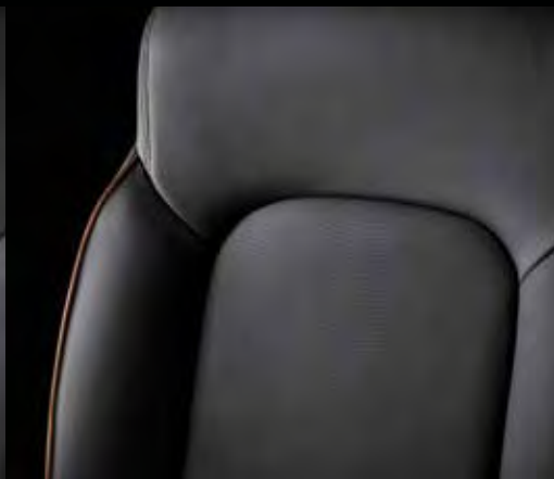
Ti and Ti-L interior black leather accented seat trim.