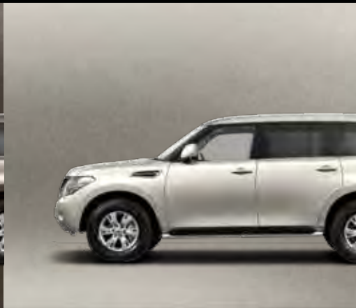
Alpine White (QAA)