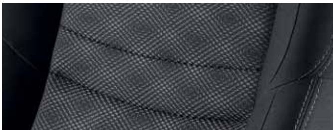
Premium Cloth Seat Trim. Available on TS model only.