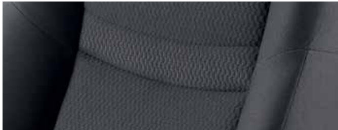
Cloth Seat Trim. Available on ST model only.