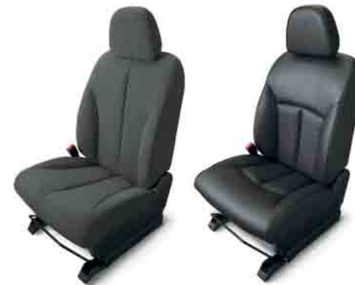
Premium tricot cloth seat trim.

Δ Figures have been calculated in accordance with ADR81/02. Actual fuel consumption will vary depending on driving conditions, driver behavior, the condition of your vehicle and the accessories fitted.