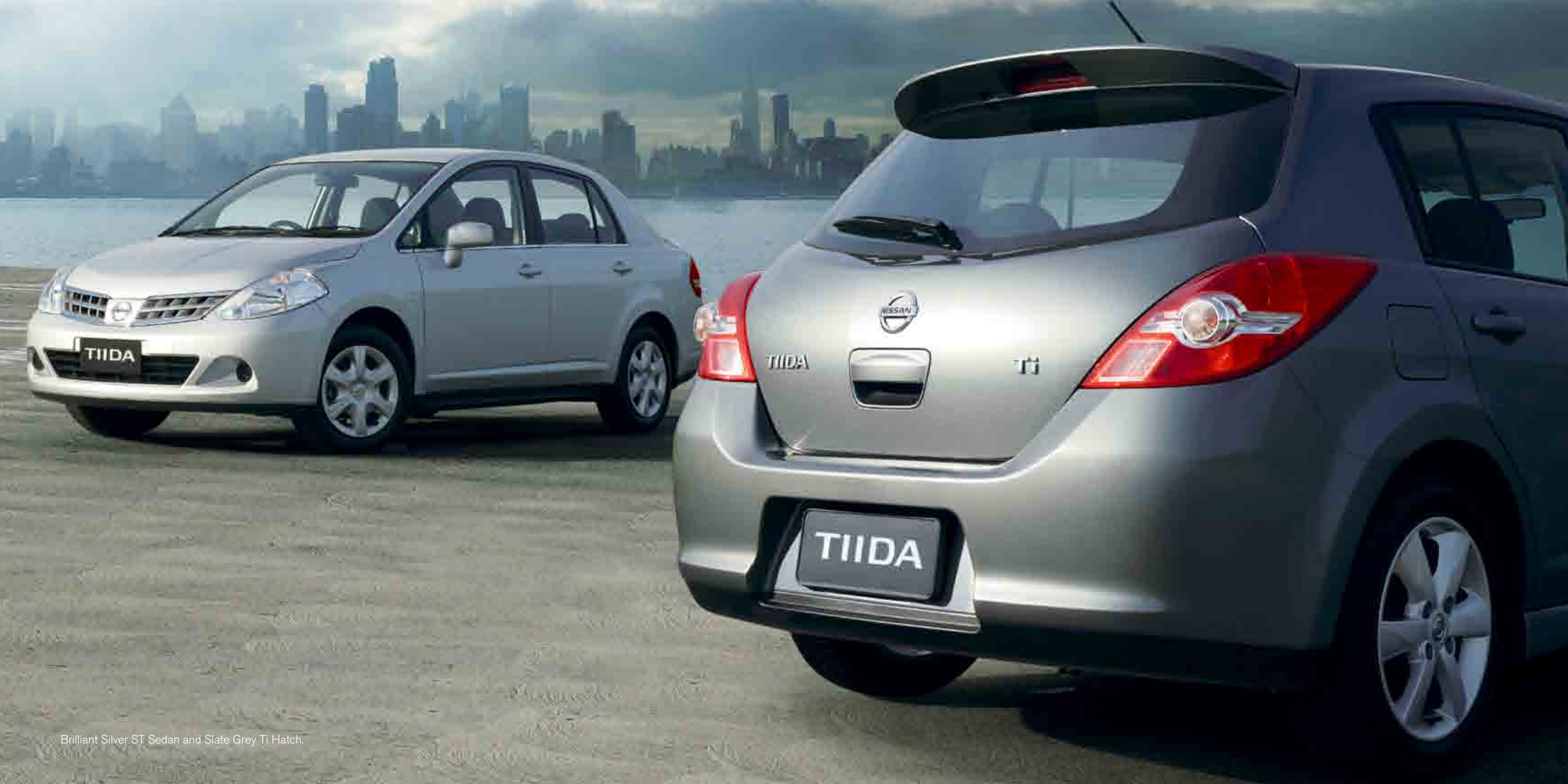
Brilliant Silver ST Sedan and Slate Grey Ti Hatch.