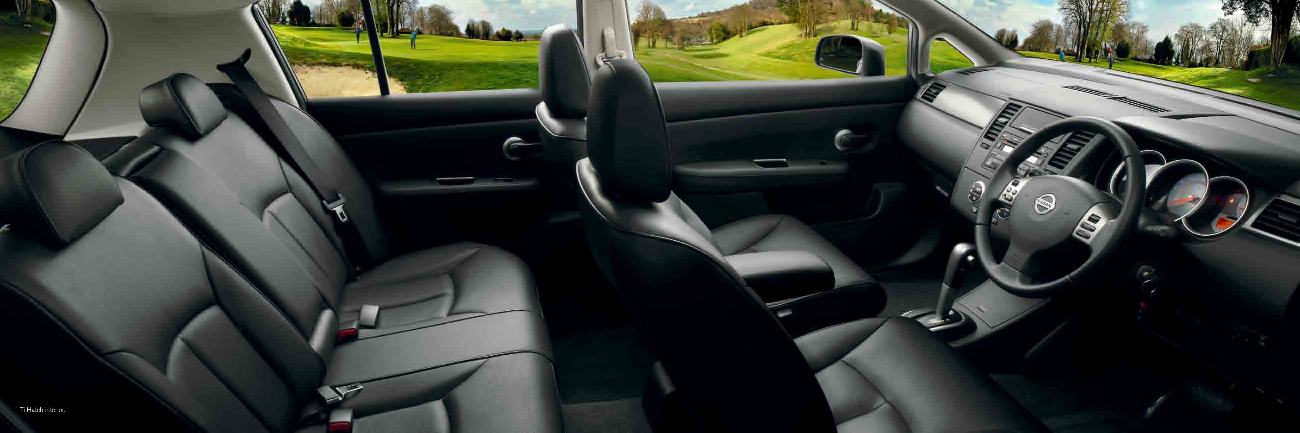
Ti Hatch interior.