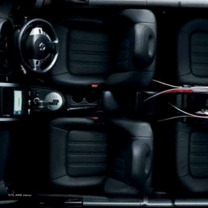
T/TL 4WD interior