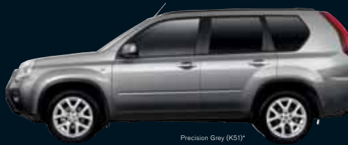
Precision Grey (K51)*