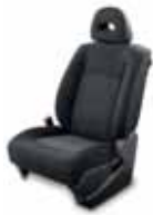
ST/TS cloth seat trim