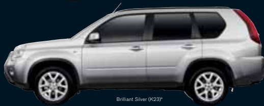
Brilliant Silver (K23)*