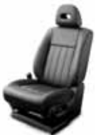
ST-L/TL leather seat trim

All illustrations, information and specifications presented and referred to in this brochure were correct at the time this brochure was approved for printing. The colours in the photographs may vary from actual colours. However, Nissan Motor Co (Australia) Pty. Ltd. reserves the right, subject to the laws of Australia and/or the regulations of any competent authority which may apply from time to time, at its discretion at any time and without prior notice to discontinue or change the models, features, specifications, designs and prices of the products referred to in this brochure and any optional equipment therefore without incurring any liability whatsoever to any purchaser or prospective purchaser of any such products. Some of the items referred to herein are optional at extra cost. Some options may be required in combination with other options. Always consult your Nissan Dealer for the latest information on models, specifications, features, prices, options and availability. Nissan Motor Co (Australia) Pty. Ltd. ACN 004 653 156. Updated May 2011. NK1032B