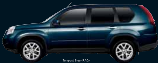
Tempest Blue (RAQ)*