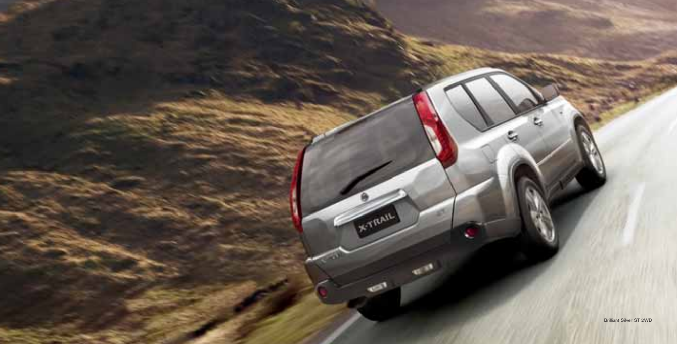
Brilliant Silver ST 2WD