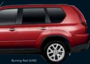
Burning Red (AX6)