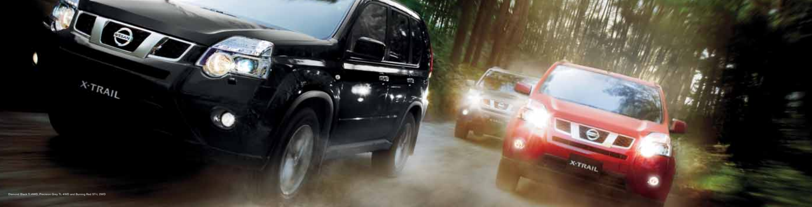
Diamond Black Ti 4WD, Precision Grey TL 4WD and Burning Red ST-L 2WD