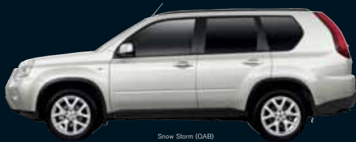
Snow Storm (OAB)