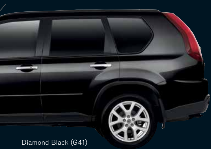
Diamond Black (G41)