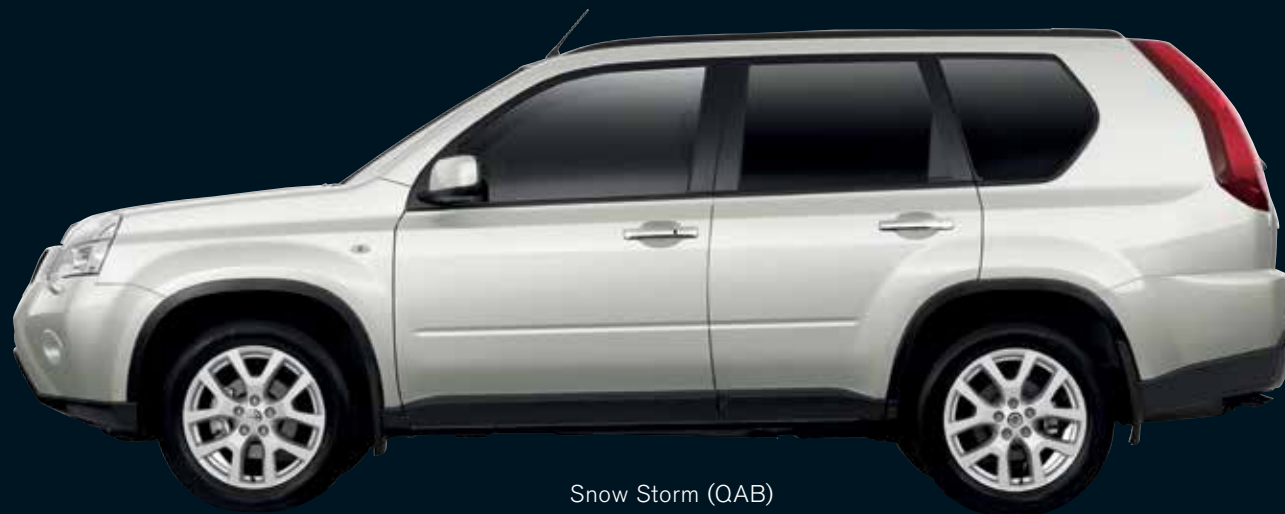
Snow Storm (QAB)