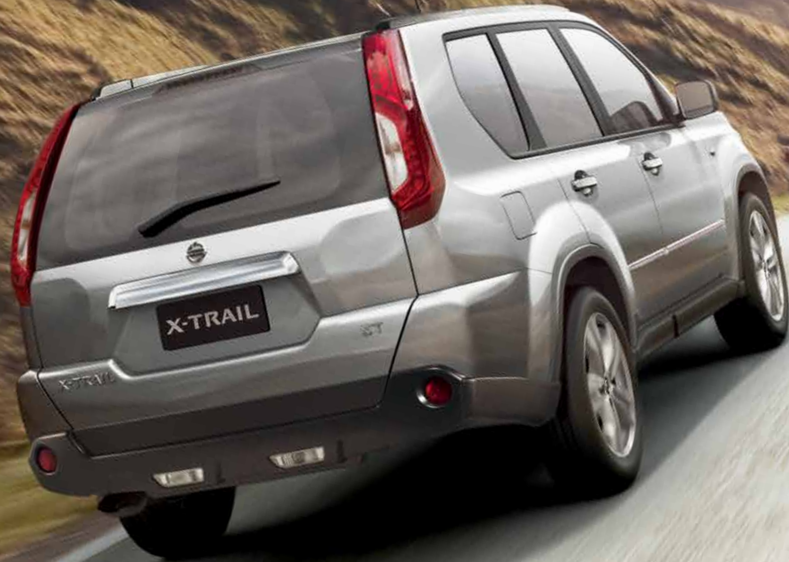
Brilliant Silver ST 2WD