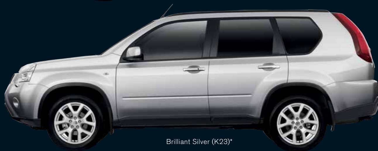
Brilliant Silver (K23)*