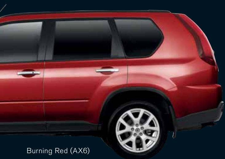
Burning Red (AX6)