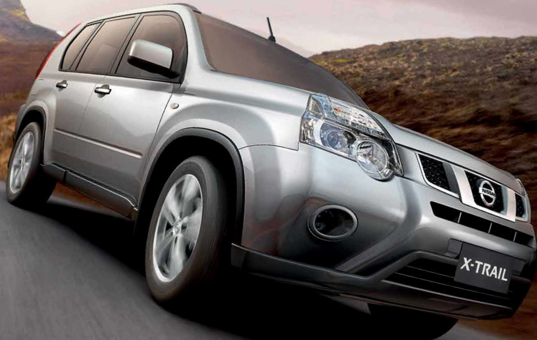
Brilliant Silver ST 2WD