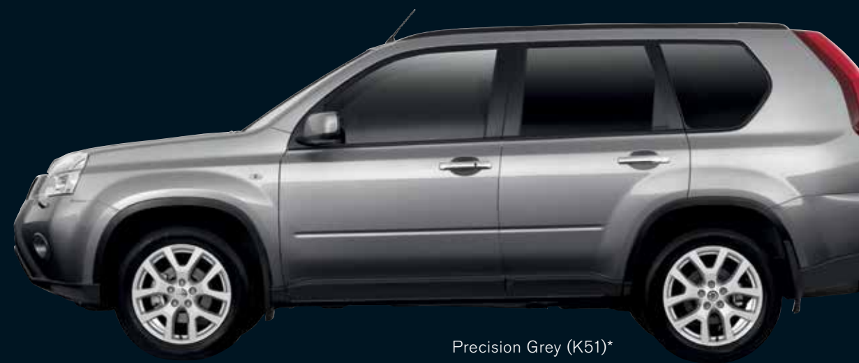
Precision Grey (K51)*