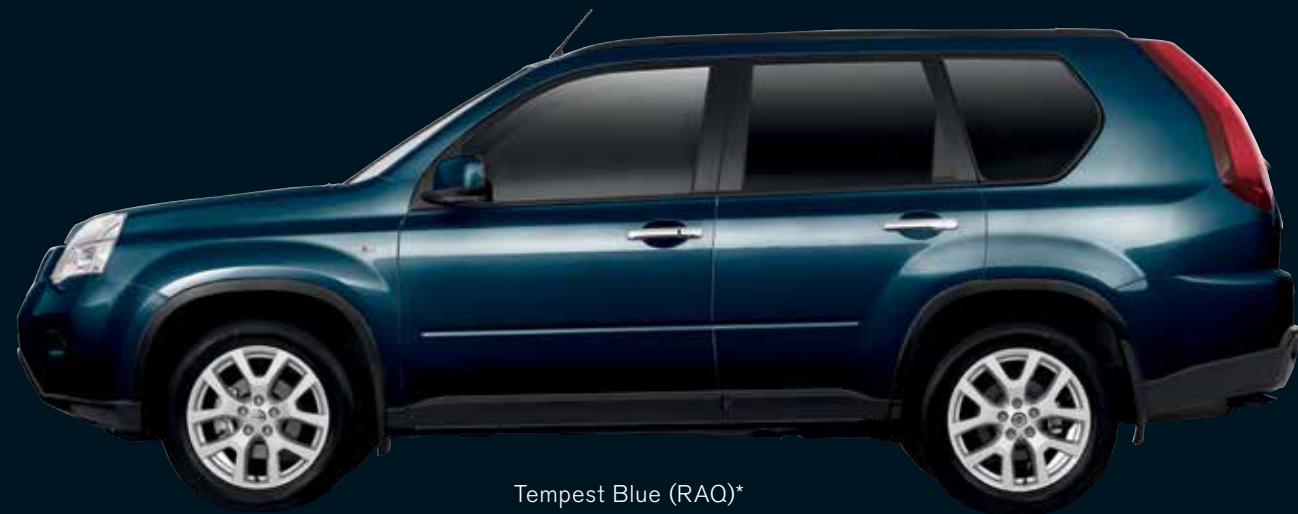
Tempest Blue (RAQ)*