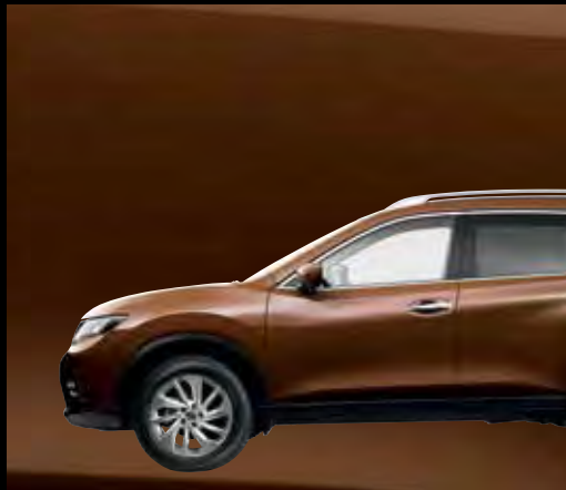
Desert Dusk (EAR)*