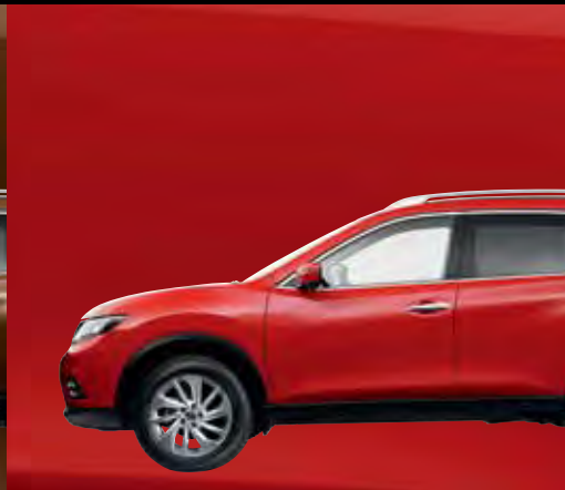
Burning Red (AX6)