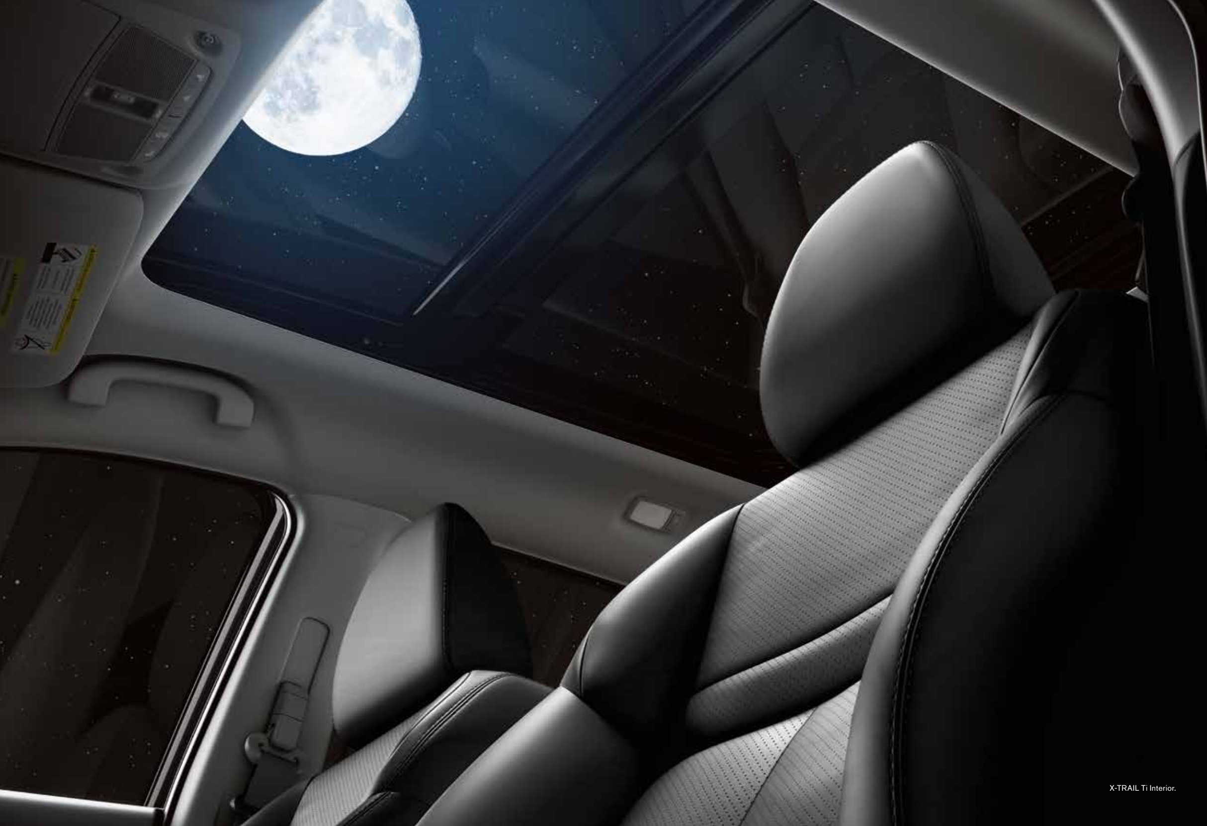
X-TRAIL Ti Interior.