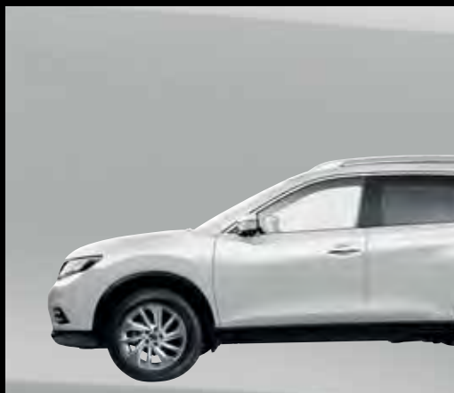
Ivory Pearl (QAB)