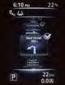
TURN BY TURN NAVIGATION*