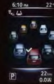
MATCH THE DISPLAY TO YOUR COLOUR