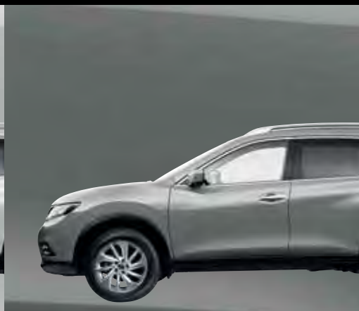
Brilliant Silver (K23)*