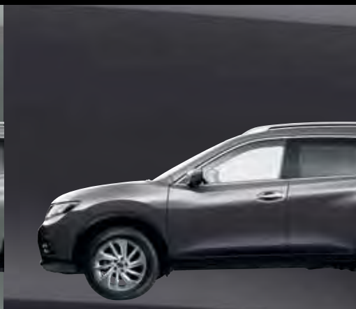
Gun Metallic (KAD)*