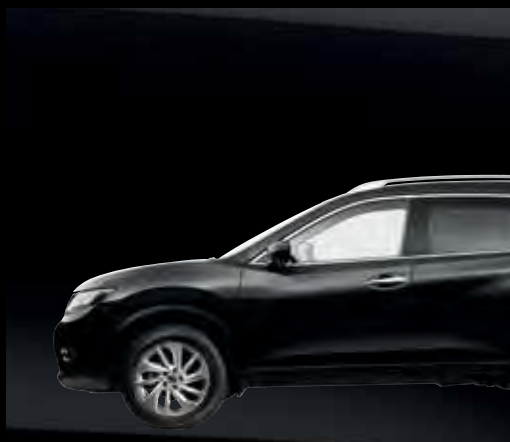
Diamond Black (G41)