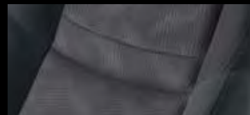
Black Cloth Trim. Available on ST model only.