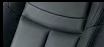
Black Leather Accented Trim! Available on ST-L and Ti models.