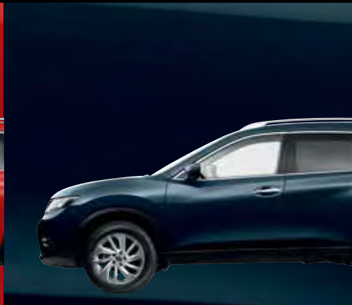
Tempest Blue (RAQ)*