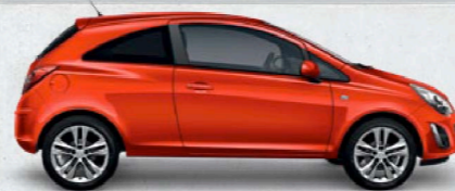
Magma Red – Solid* Available on 3D Hatch, 3D Colour Edition Hatch and 5D Enjoy Hatch.

This season's 'must have' colour? Take your pick from a brilliant range of Corsa shades.