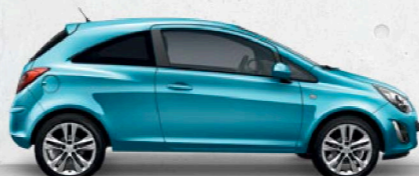
Oriental Blue – Pearlescent* Available on 3D Hatch and 5D Enjoy Hatch.

Colour Edition models feature a Carbon Flash Black roof. All exterior colours except Carbon Flash Black are optional at extra cost for Colour Edition models.