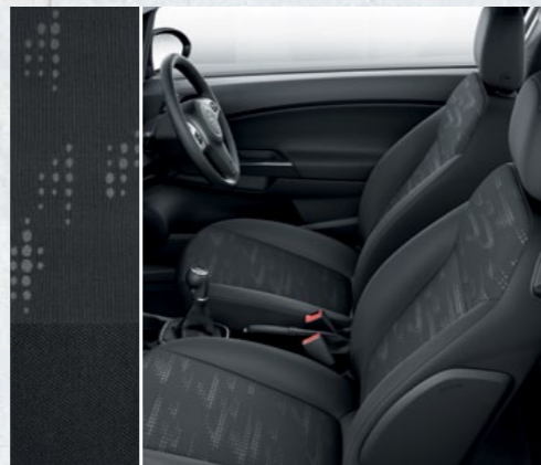
Reflection cloth – Charcoal Standard on Corsa 3 door hatch and Corsa Enjoy 5 door hatch models.

With funky colours you need a matching interior. The Corsa, better looking inside and out.