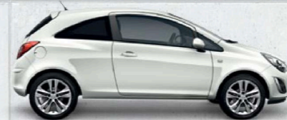
Casablanca White – Brilliant Available on 3D Hatch, 3D Colour Edition Hatch and 5D Enjoy Hatch.