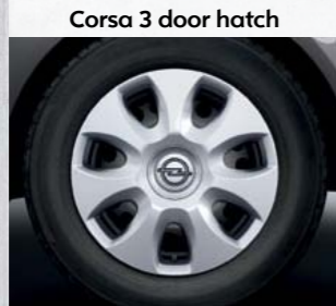
15-inch steel wheels with flush covers and 185/65 R 15 tyres.