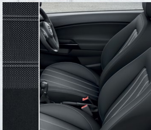
Twist cloth – Charcoal/Silver Standard on Colour Edition models (available with Casablanca White and Carbon Flash Black exterior colours).

The colours illustrated may vary slightly from the actual trim material. As a result, they should be used as a guide only.