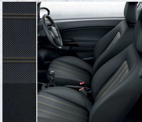
Twist cloth – Charcoal/Yellow Standard on Limited Colour models (available with Flaming Yellow exterior colour).