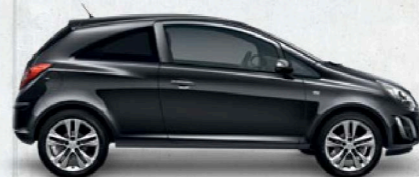
Carbon Flash Black – Pearlescent* Available on 3D Hatch, 3D Colour Edition Hatch and 5D Enjoy Hatch.