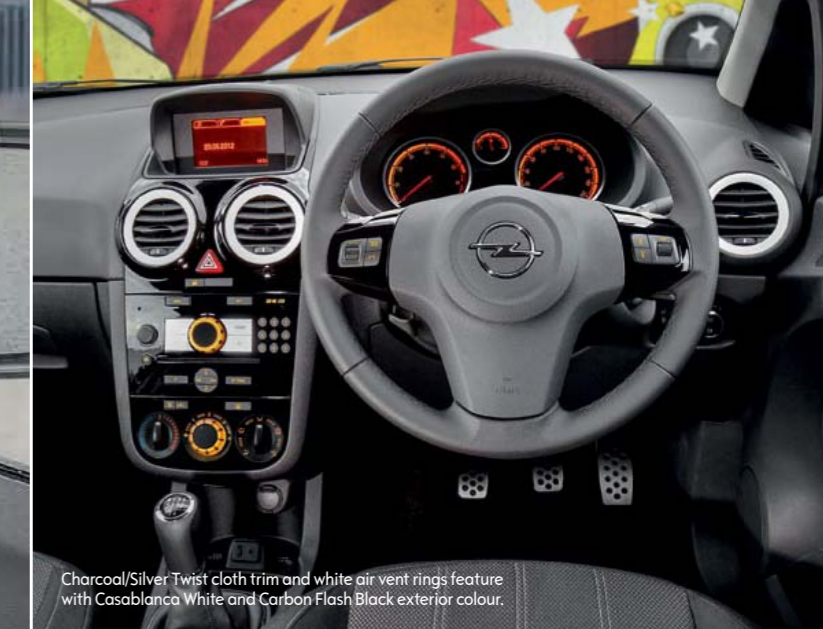
Charcoal/Silver Twist cloth trim and white air vent rings feature with Casablanca White and Carbon Flash Black exterior colour.