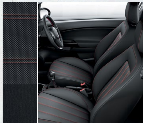
Twist cloth – Charcoal/Red Standard on Colour Edition models (available with Magma Red exterior colour).