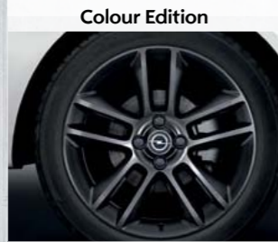
17-inch alloy wheels in black with 215/45 R 17 tyres.