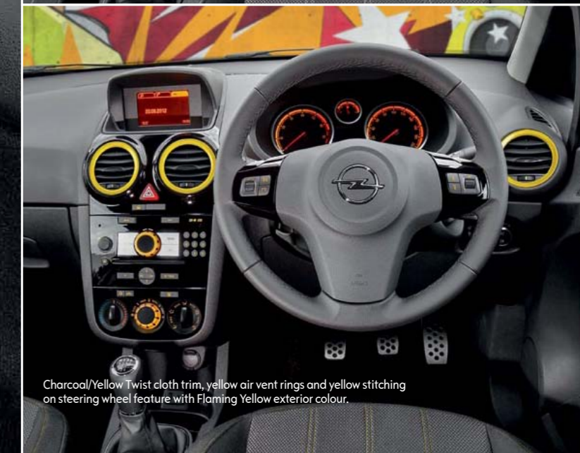
Charcoal/Yellow Twist cloth trim, yellow air vent rings and yellow stitching on steering wheel feature with Flaming Yellow exterior colour.