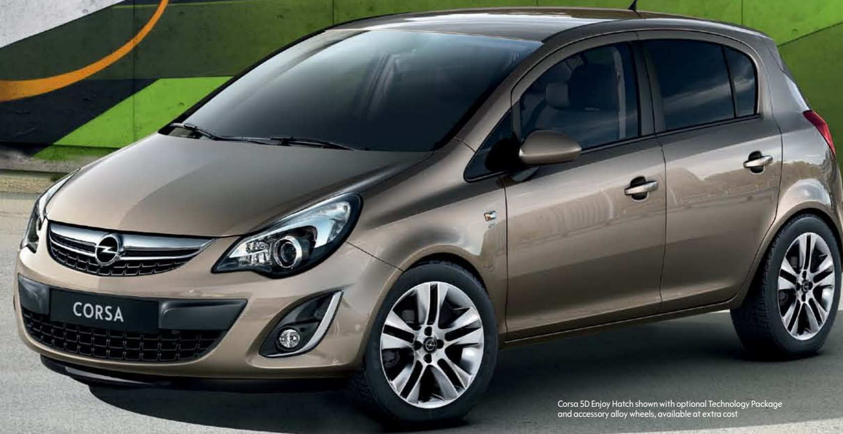
Corsa 5D Enjoy Hatch shown with optional Technology Package and accessory alloy wheels, available at extra cost