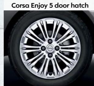
16-inch alloy wheels with 195/55 R 16 tyres.