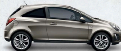
Pepperdust – Metallic* Available on 3D Hatch and 5D Enjoy Hatch.