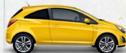
Flaming Yellow – Brilliant* Available on 3D Hatch, 3D Colour Edition Hatch and 5D Enjoy Hatch.