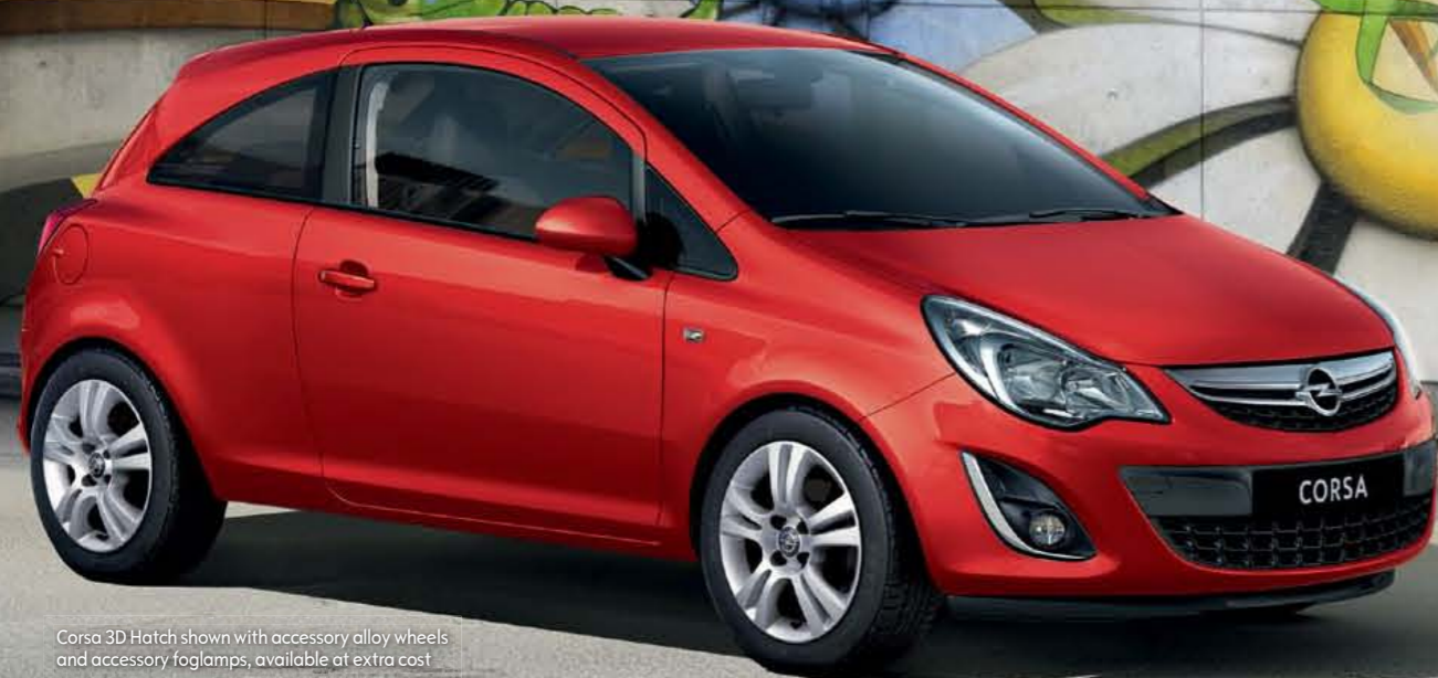
Corsa 3D Hatch shown with accessory alloy wheels and accessory foglamps, available at extra cost