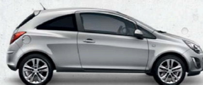
Sovereign Silver – Metallic* Available on 3D Hatch and 5D Enjoy Hatch.