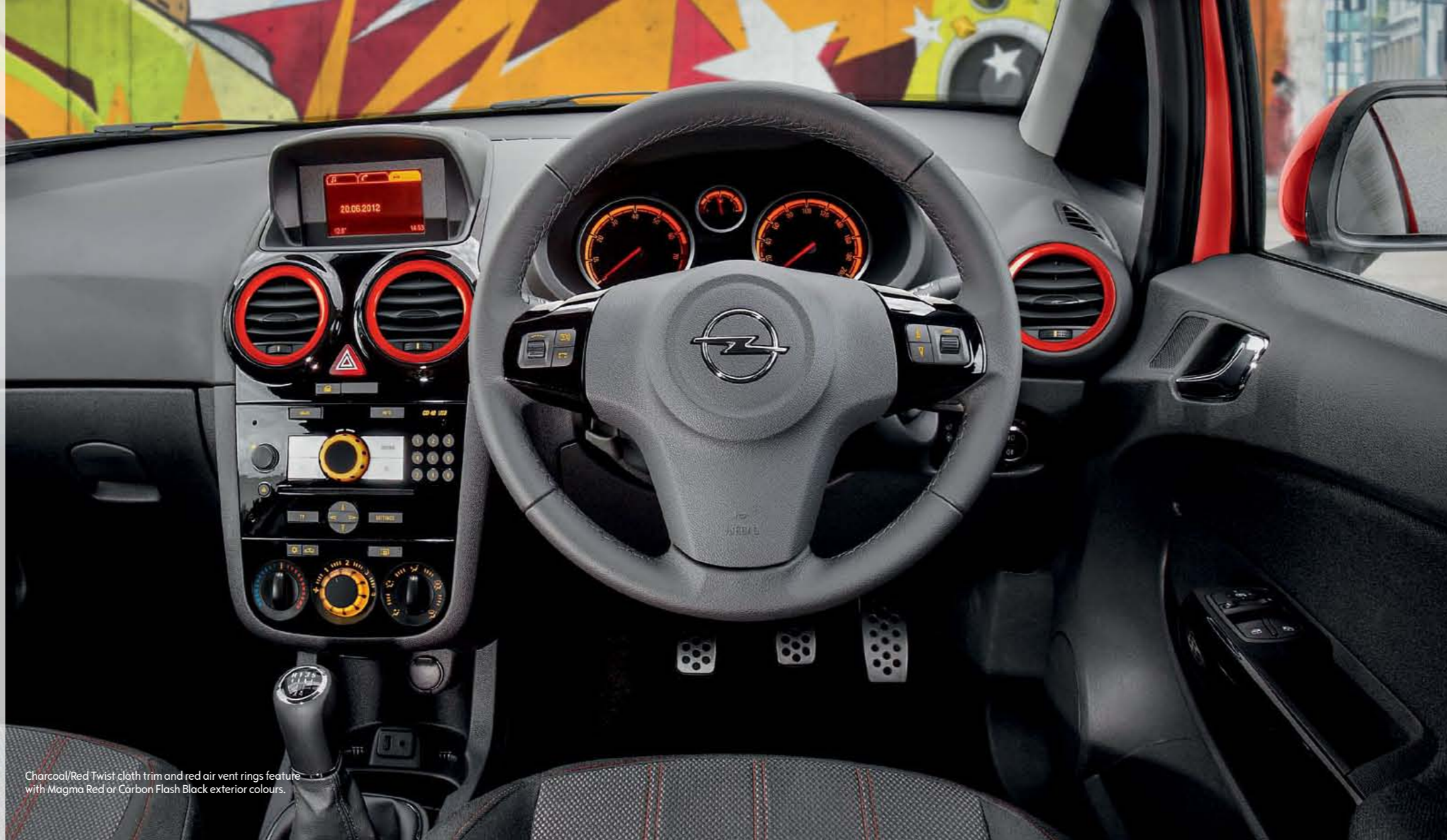
Charcoal/Red Twist cloth trim and red air vent rings feature with Magma Red or Carbon Flash Black exterior colours.