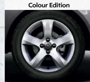
16-inch alloy wheels with 195/55 R 16 tyres.