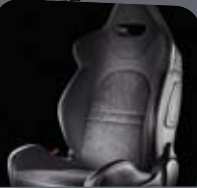
Sports performance seats