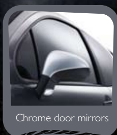
Chrome door mirrors