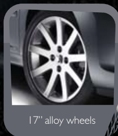
17" alloy wheels