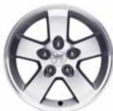
16" 'Manyara' alloy wheel