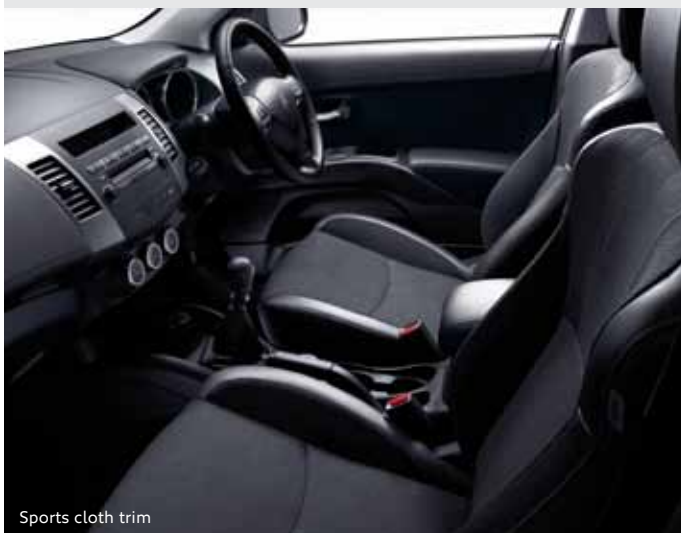
Sports cloth trim