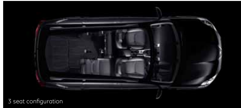
3 seat configuration