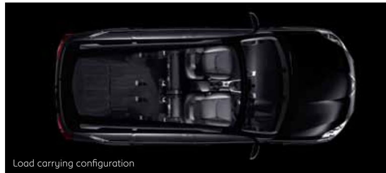
Load carrying configuration

Changing the configuration could not be simpler. You can unfold the extra seats in seconds – and it's just as simple to fold them back down again when you need to open up all that load space.