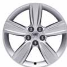
18" 'Tanganyika' alloy wheel