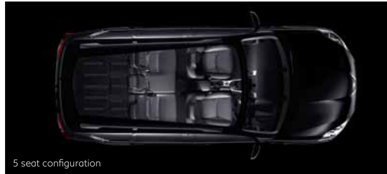
5 seat configuration