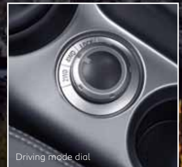
Driving mode dial

Touring round on good, dry roads? You can save on fuel by selecting the refined 2-wheel drive mode with one twist of the dial between the front seats.