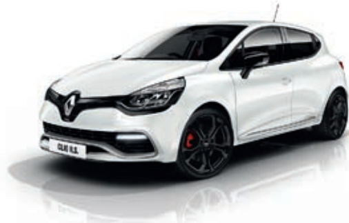
GLACIER WHITE (369) S