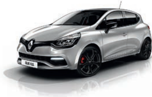
MERCURY GREY (D69) M