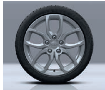
17" TIBOR ALLOYS*

*Available on the Sport and Sport Premium ^Available on the Cup and Cup Premium