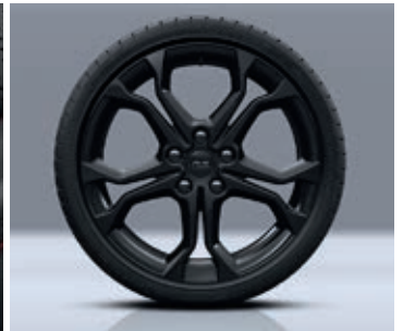
18" RADICALE ALLOYS*