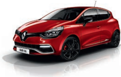
FLAME RED (NNP) M