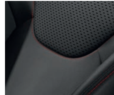
DARK CARBON LEATHER SEATS