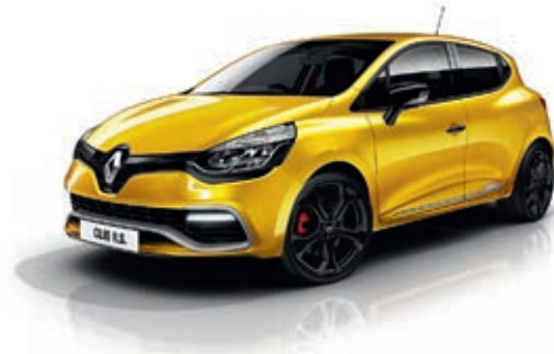
LIQUID YELLOW (J37) R