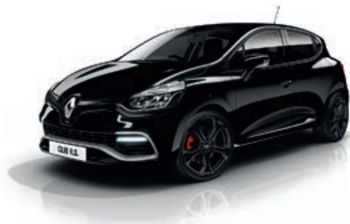
DEEP BLACK (GNA) M