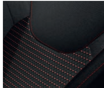
DARK CARBON UPHOLSTERY