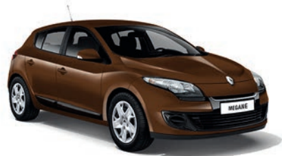
METALLIC BROWN (D17) M