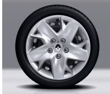
16" DESIGN SURROUND FLEX WHEELS