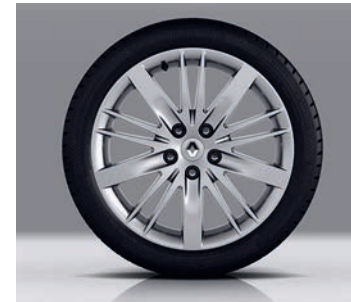
17" CELSIUM ALLOY WHEELS