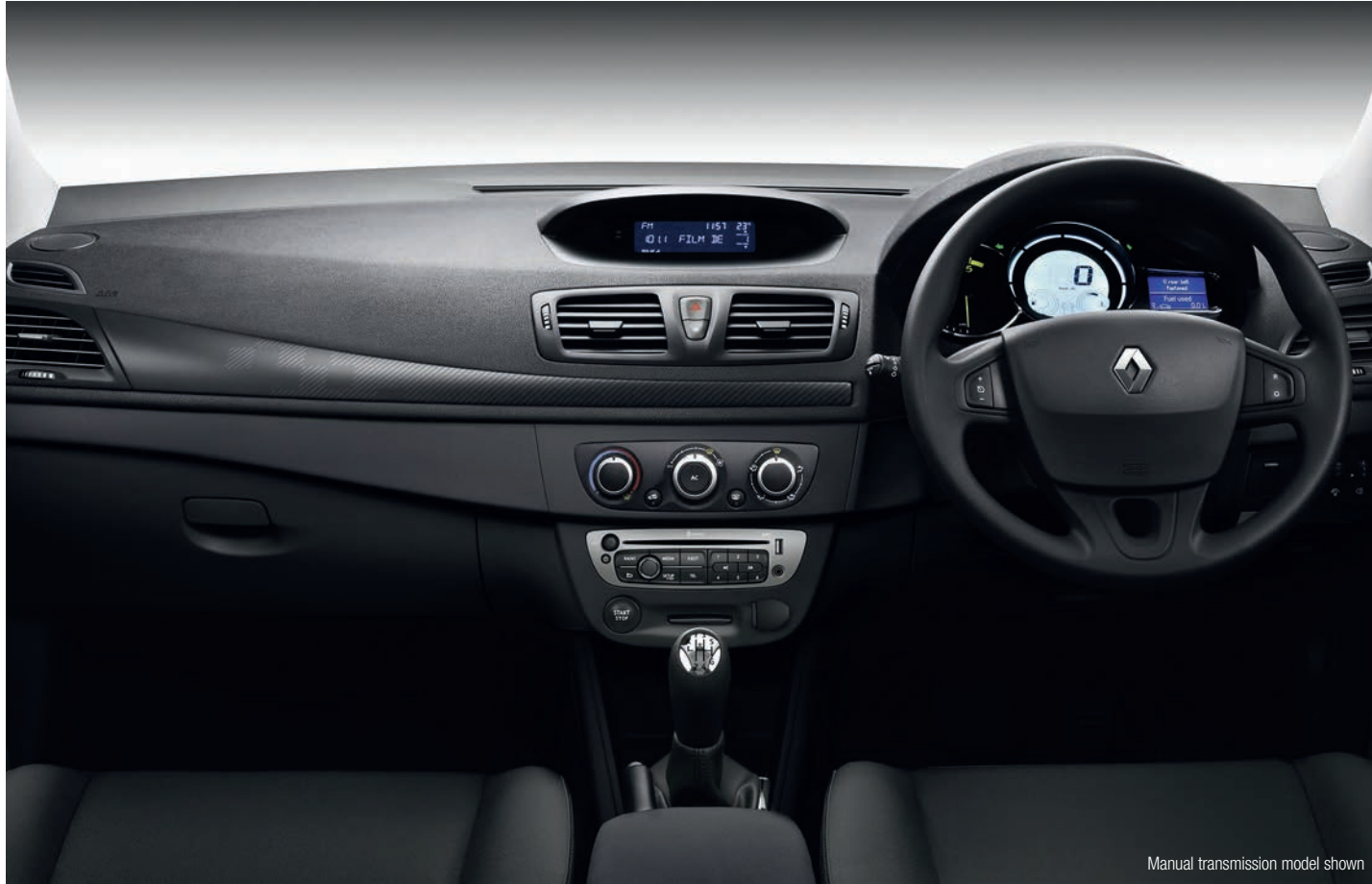
Manual transmission model shown