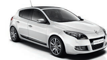
PEARL WHITE (QNC) M