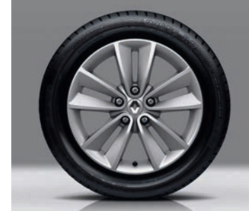
17" SARI ALLOY WHEELS