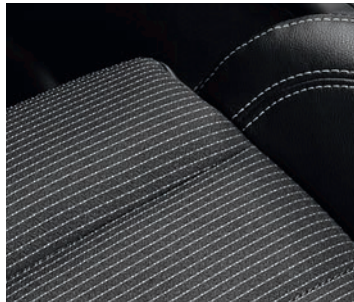
DARK CHARCOAL CLOTH LEATHERETTE TRIMMED UPHOLSTERY