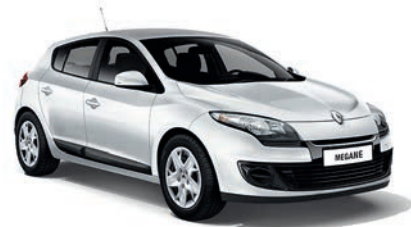
GLACIER WHITE (369) S