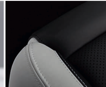
COOL GREY LEATHER UPHOLSTERY