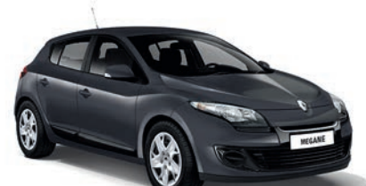
ECLIPSE GREY (B66) M