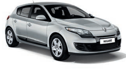
PLATINUM (D69) M