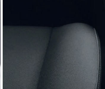
DARK CHARCOAL CLOTH UPHOLSTERY