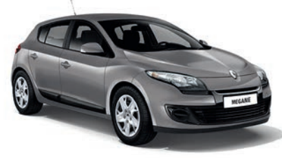
LUNAR GREY (KNG) M