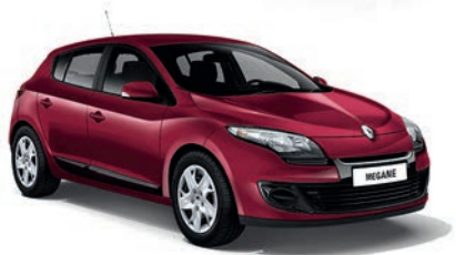
DYNAMIC RED (NNJ) M