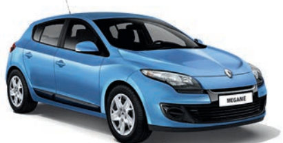
MAJORELLE BLUE* (RPB) M