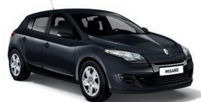
DIAMOND BLACK (GNE) M