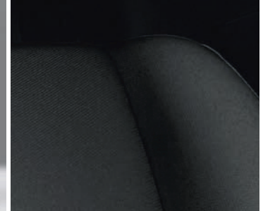
DUAL TONE DARK GREY ALCANTARA LEATHER UPHOLSTERY