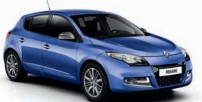
MALTA BLUE* (RNT) M