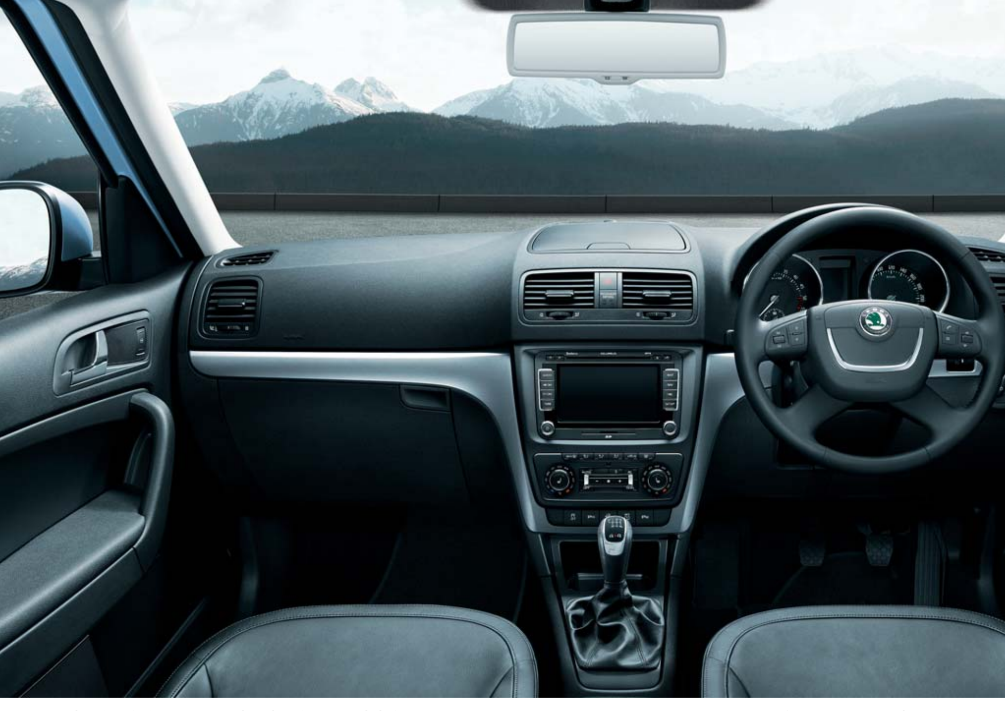
If you have high expectations of comfort, the Yeti will fulfil them. Discover unexpected spaciousness as well as exceptional practicality as you intuitively find all controls exactly where you'd expect them.