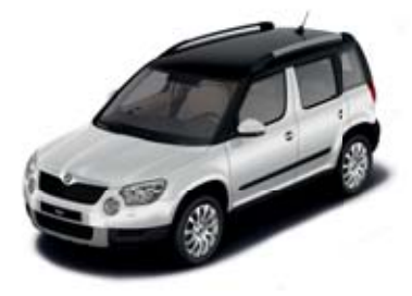
Candy White uni with Black Magic roof