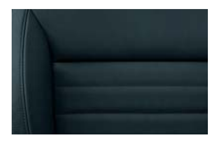
Lynx Onyx - 103TDI 4x4 (leather/artificial leather optional)