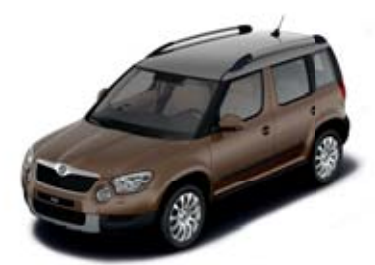
Mato Brown metallic with Cappuccino Beige roof