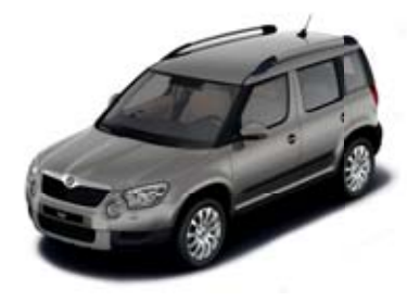
Cappuccino Beige metallic