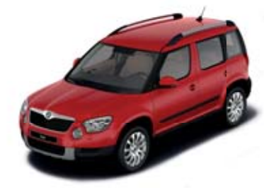
Corrida Red uni