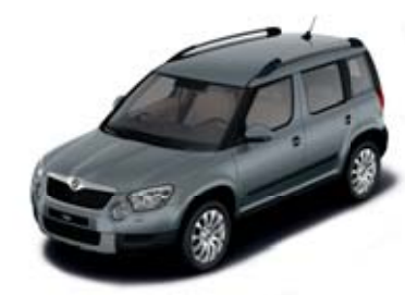
Platin Grey metallic