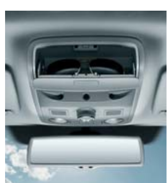
Sunglasses compartment is located in the roof panel (Yeti 4x4 only).