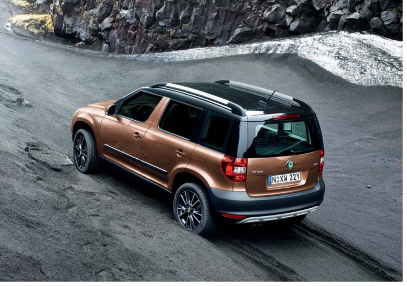
The roof transportation systems will be appreciated when carrying various sports equipment. A genuine ŠKODA box with 380-litre capacity, is also available.