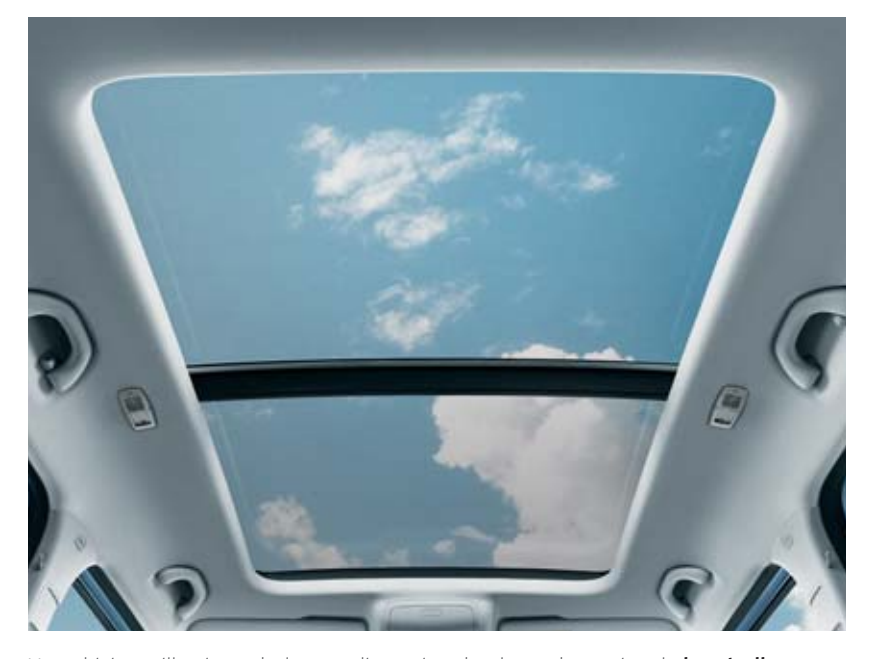
Your driving will gain a whole new dimension thanks to the optional electrically-adjustable panoramic roof which allows you to create a large open space above the seats.