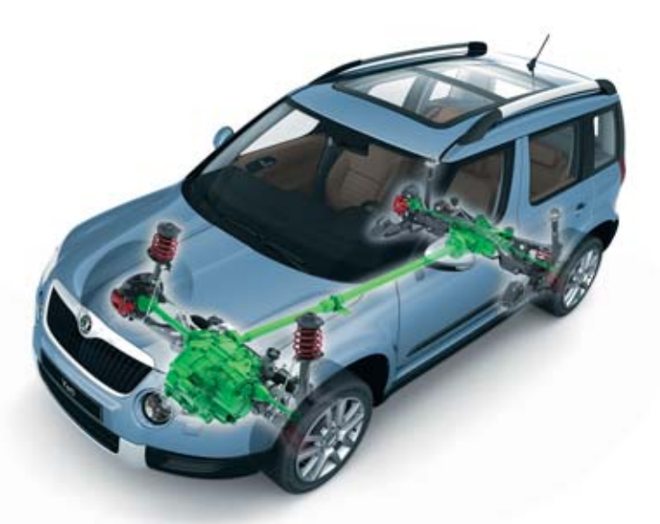
ŠKODA Yeti with four-wheel drive, latest generation Haldex clutch and 103kW diesel engine.