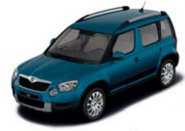
Lava Blue metallic