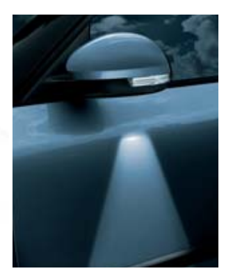
The Boarding Spots , designed to illuminate the entry areas, are integrated into the wing mirrors and enable you to avoid puddles when leaving the car in the dark.