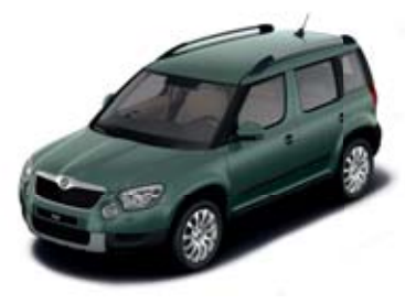
Malachite Green metallic