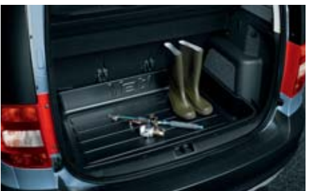
Plastic boot tray with an increased 15cm edge and a Yeti inscription.