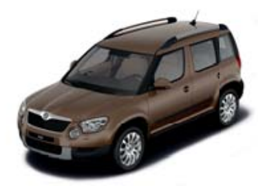
Mato Brown metallic