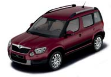
Rosso Brunello metallic