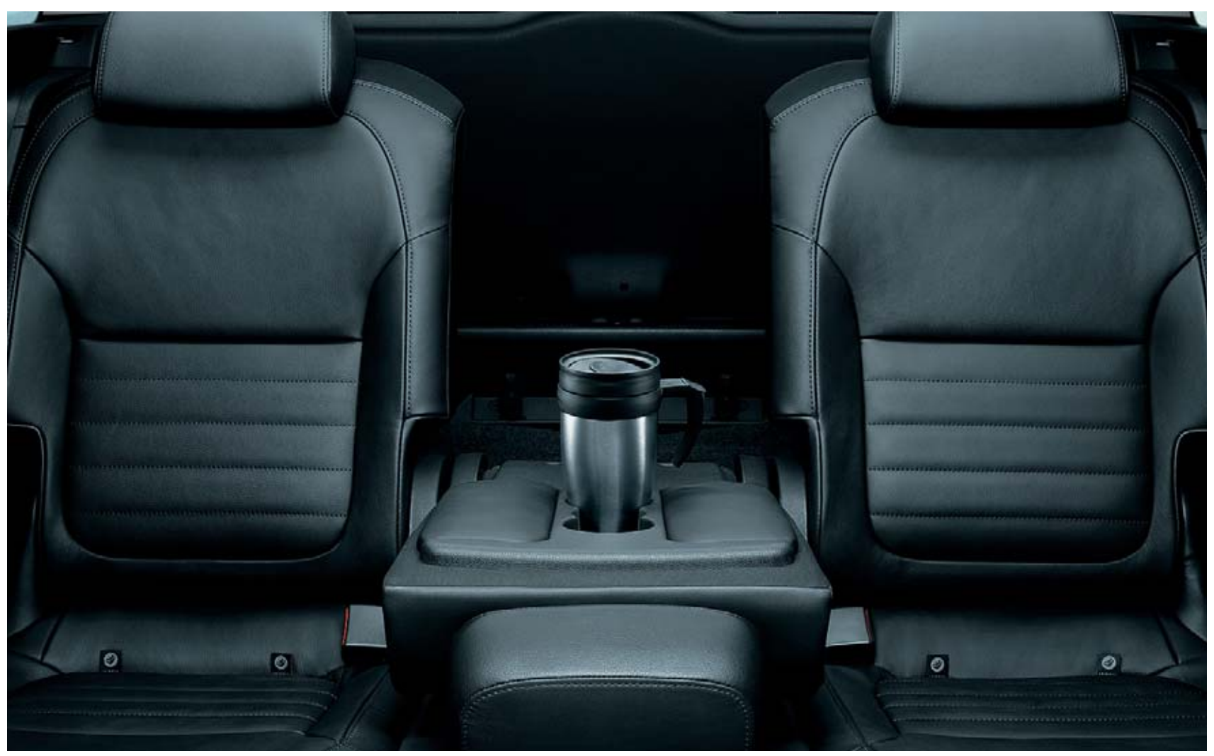
The foldable table in the rear seat backrest.