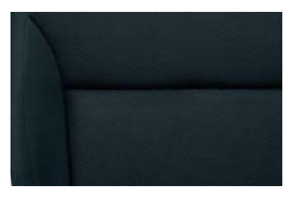
Spirit Silver – 103TDI 4x4 fabric