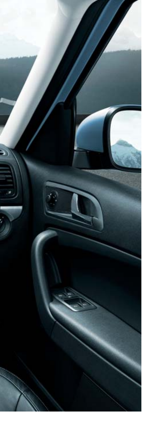
Optional privacy glass from the B-pillar back helps cut sun glare for passengers.