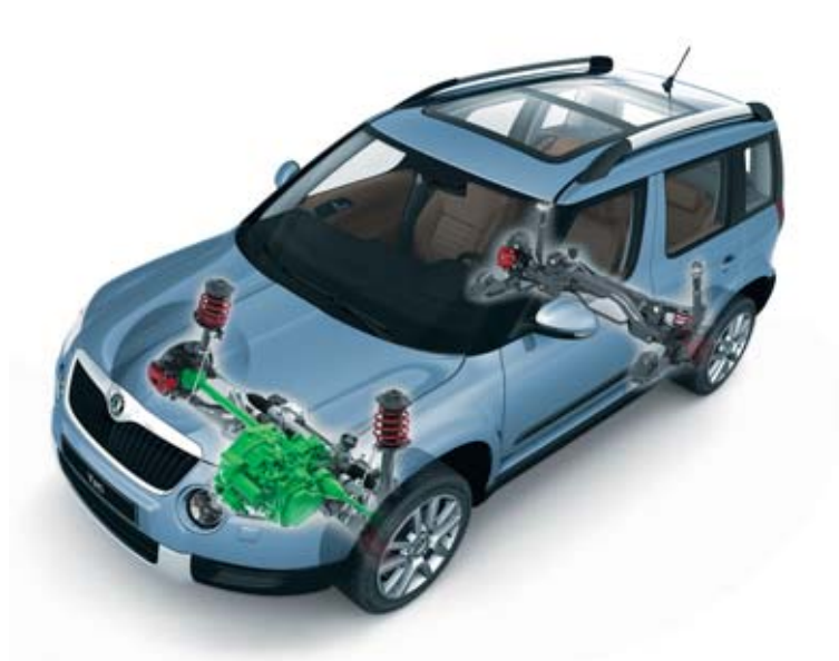
ŠKODA Yeti with front-wheel drive and 77TSI petrol engine.