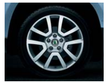
Spitzberg 7.0] x 17" alloy wheels for 225/50 R17 tyres are standard on the 103TDI 4x4 model.