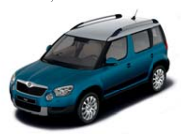
Lava Blue metallic with Brilliant Silver roof