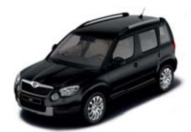
Black Magic pearl effect