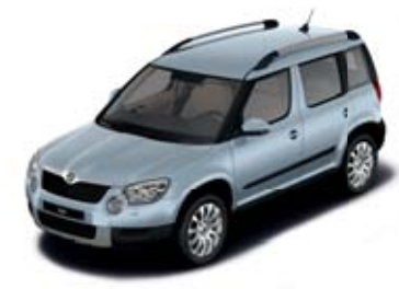
Aqua Blue metallic