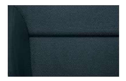
Reflex Onyx - 77TSI fabric