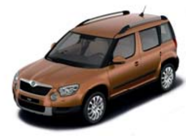
Terracotta Orange metallic