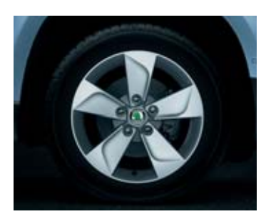
Nevis 7.0J x 16" alloy wheels for 215/60 R16 tyres are standard on the 77TSI model.