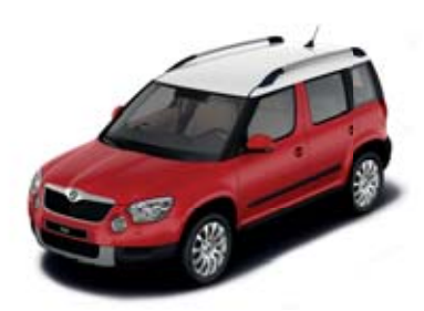
Corrida Red uni with Candy White roof