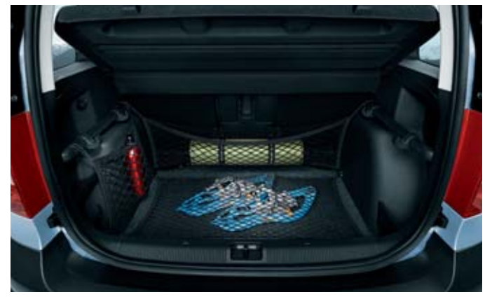
The luggage nets help keep items in place.