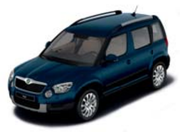
Pacific Blue uni