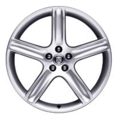
20″ Callisto alloy