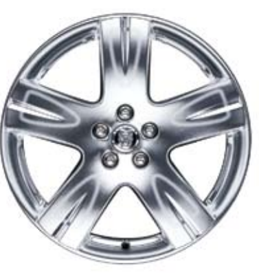
19" Chrome Sabre