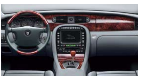
VISIT JAGUAR.CA FOR FURTHER INFORMATION.