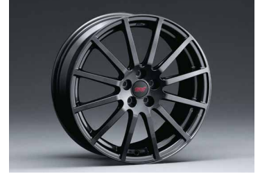
ENKEI ALLOY WHEEL (CHARCOAL 17X7.5)