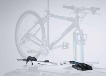
BICYCLE HOLDER (FORK MOUNT)