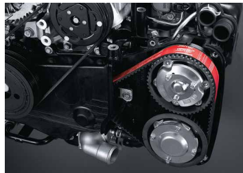
COMPETITION TIMING BELT