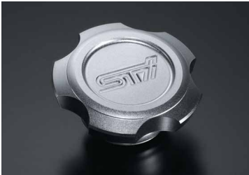
MAGNESIUM OIL FILTER CAP