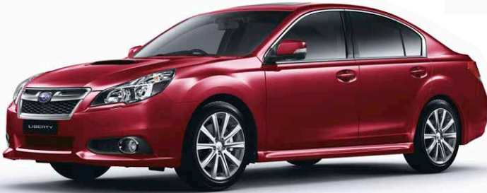
VENETIAN RED PEARL