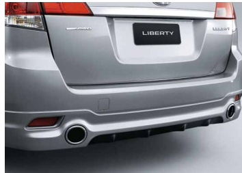
REAR BUMPER SKIRT