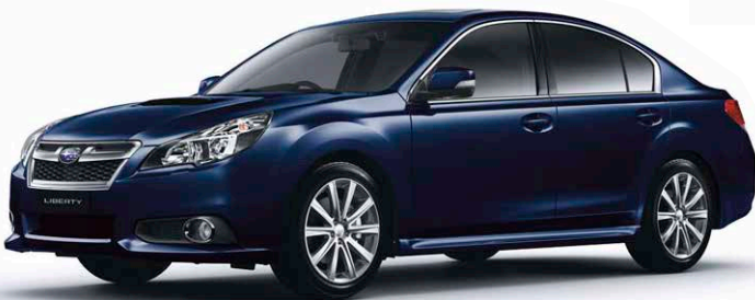
DEEP SEA BLUE PEARL