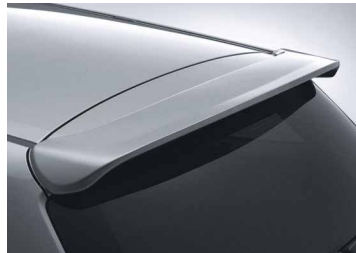
ROOF SPOILER - WAGON