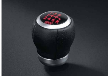
SPORTS LEATHER GEAR KNOB - 6MT