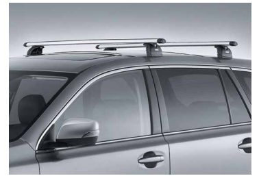
ROOF CROSS BARS