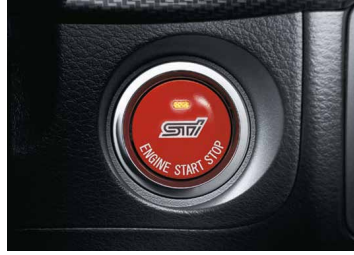
PUSH START SWITCH