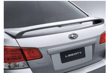
BOOT SPOILER - SEDAN