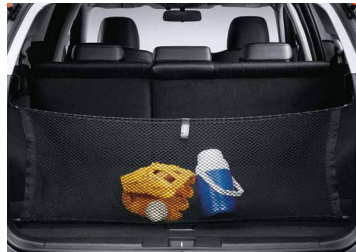
CARGO NET (REAR)