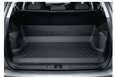
CARGO TRAY (DEEP DISH)