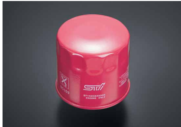
COMPETITION OIL FILTER