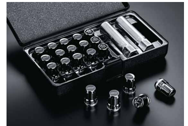
SECURITY WHEEL NUT SET