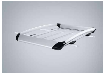
LUGGAGE RACK (SMALL)