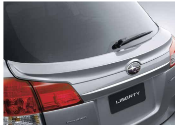
WAIST SPOILER - WAGON