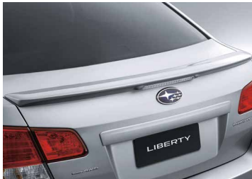
BOOT LIP SPOILER - SEDAN