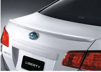
REAR BOOT LIP SPOILER - SEDAN