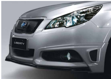
FRONT BUMPER SKIRT

Subaru Australia reserves the right to vary vehicle specifications, accessory range and standard features in Australia from those detailed in this brochure. Vehicles shown in this brochure may be fitted with accessories available at additional cost.