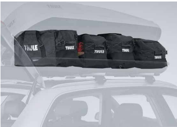
THULE GO PACK SET