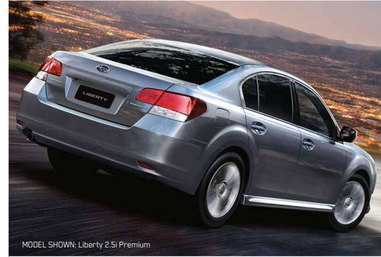
MODEL SHOWN: Liberty 2.5i Premium

To drive Liberty is to rediscover the joy of driving and understand why the open road never closes. The confidence comes from Subaru's superior driving technologies, which deliver a balanced drive and solid footing in a range of conditions.