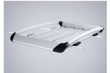
LUGGAGE RACK (LARGE)