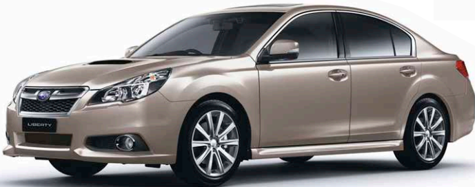
BURNISHED BRONZE METALLIC