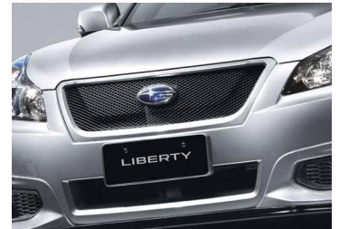
FRONT GRILLE (EXPANDED METAL)