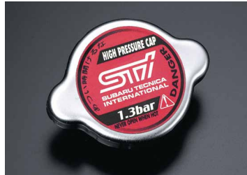
HIGH PRESSURE RADIATOR CAP