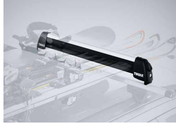
UNIVERSAL LOCKING ARMS