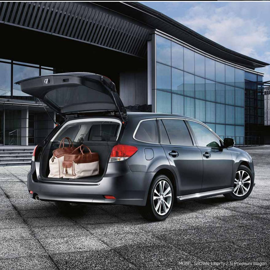
MODEL SHOWN: Liberty 2.5i Premium Wagon

The wide-body design of the Liberty wagon gives you the space and versatility you demand. From the generous passenger legroom and headroom, to the more than ample cargo space. Pack all your gear in and if in doubt, take it anyway. Then pull out the cargo security blind to keep all your gear under wraps. Flick the easy-to-use release levers in the cargo area and fold the rear seats down to accommodate that extra large load.