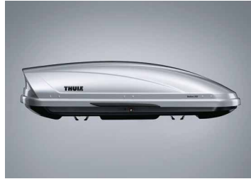
THULE MOTION 200 SILVER LUGGAGE POD