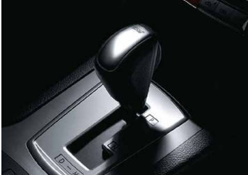
ALUMINIUM AND LEATHER GEAR KNOB - AT