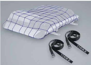
NET AND STRAPS FOR LUGGAGE RACK