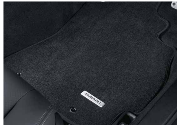
CARPET FLOOR MATS