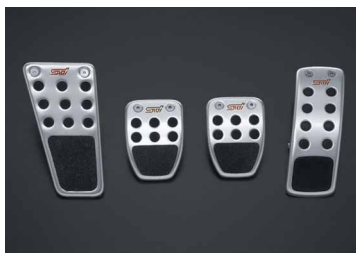
SPORTS PEDAL PAD SET - MT

SUBARU.COM.AU FOR FULL DETAILS ON THE TAILOR-MADE ACCESSORIES AVAILABLE FOR YOUR SUBARU MODEL.