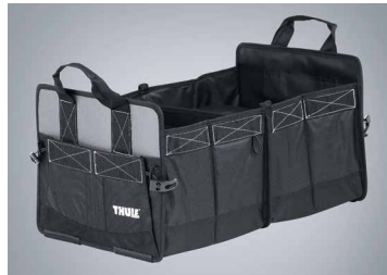
THULE GO BOX