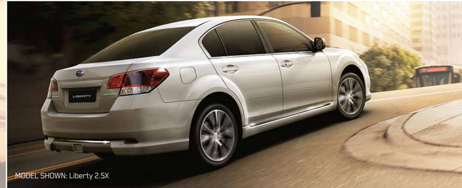
MODEL SHOWN: Liberty 2.5X

Contemporary style and quality design come together in the Liberty sedan. Its bold appearance is enhanced by flared wheel arches, sporty side spoilers, eye-catching alloy wheels, sporty tail pipe cover and a deeply sculpted bonnet. While the rear doors with privacy glass let you make your escape incognito.