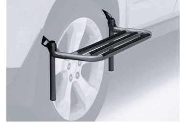
SIDE STEP UP