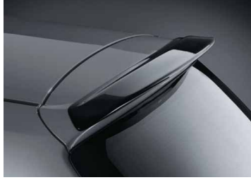
REAR TAILGATE LIP SPOILER - WAGON