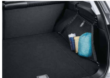
CARGO NET (SIDE x2)