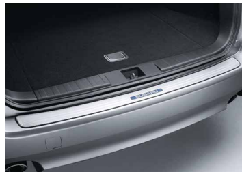
REAR STEP PANEL (STAINLESS)