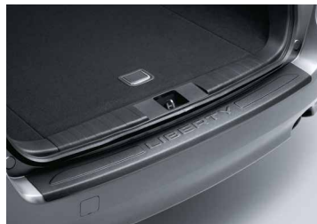
REAR STEP PANEL (RESIN)