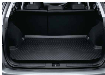
CARGO TRAY (LOW DISH)