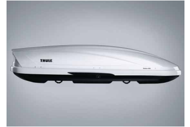
THULE MOTION 800 SILVER LUGGAGE POD