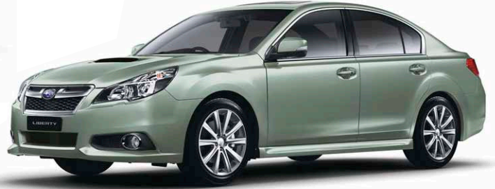
JASMINE GREEN METALLIC