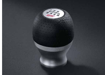
ALUMINIUM AND LEATHER GEAR KNOB - 6MT