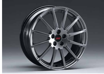
ENKEI ALLOY WHEEL (SILVER 17X7.5)