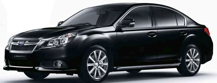
CRYSTAL BLACK SILICA