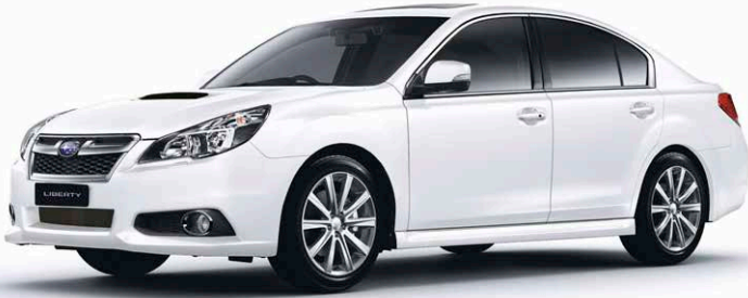
SATIN WHITE PEARL

All colours available in sedan and wagon models.