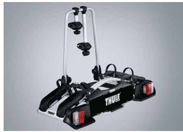
TOWBALL MOUNTED BIKE CARRIER (TWO BIKES)