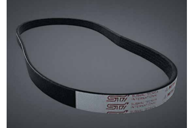
COMPETITION POWER STEERING/ ALTERNATOR BELT