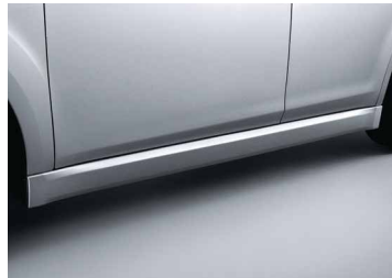
SIDE UNDER SKIRT