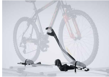
BICYCLE HOLDER (UPRIGHT)