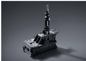
SHORT SHIFT GEAR LEVER ASSEMBLY - 6MT