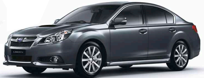
DARK GREY METALLIC