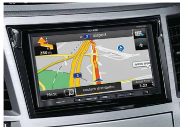
AVN NAVIGATION SYSTEM