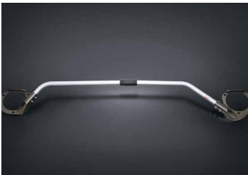
FLEXIBLE TOWER BAR