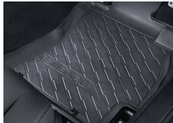
RUBBER FLOOR MATS