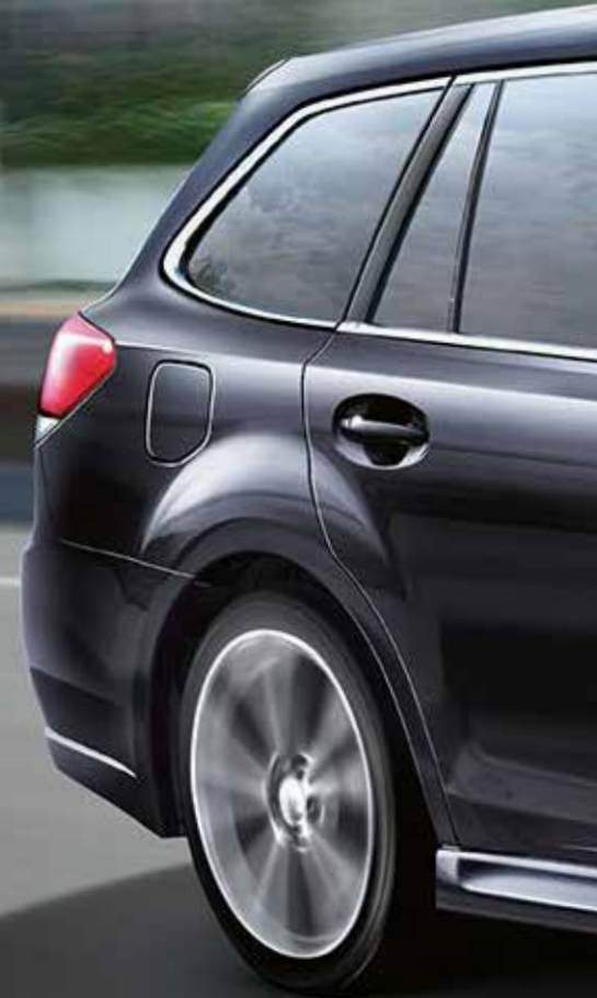
MODEL SHOWN: Liberty 2.5i Premium Wagon

THE LIBERTY WAGON LETS YOU CHOOSE TO DO MORE. CHOOSE WHERE YOU WANT TO GO AND HOW YOU WANT TO GET THERE. TRAVEL LIGHTLY OR TAKE ALL THE GEAR YOU NEED TO MAKE THE MOST OF EVERY MOMENT.