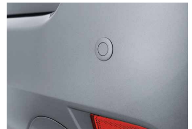
REAR PARK ASSIST