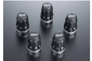
WHEEL LOCK NUTS (BLACK)