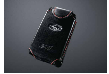
LEATHER KEYLESS REMOTE CASE