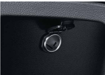
CARGO POWER SOCKET