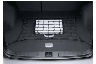
CARGO NET FLOOR