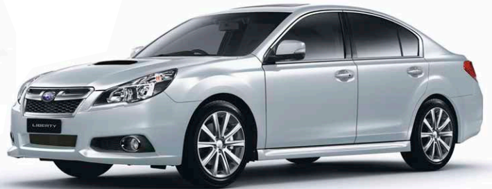
ICE SILVER METALLIC