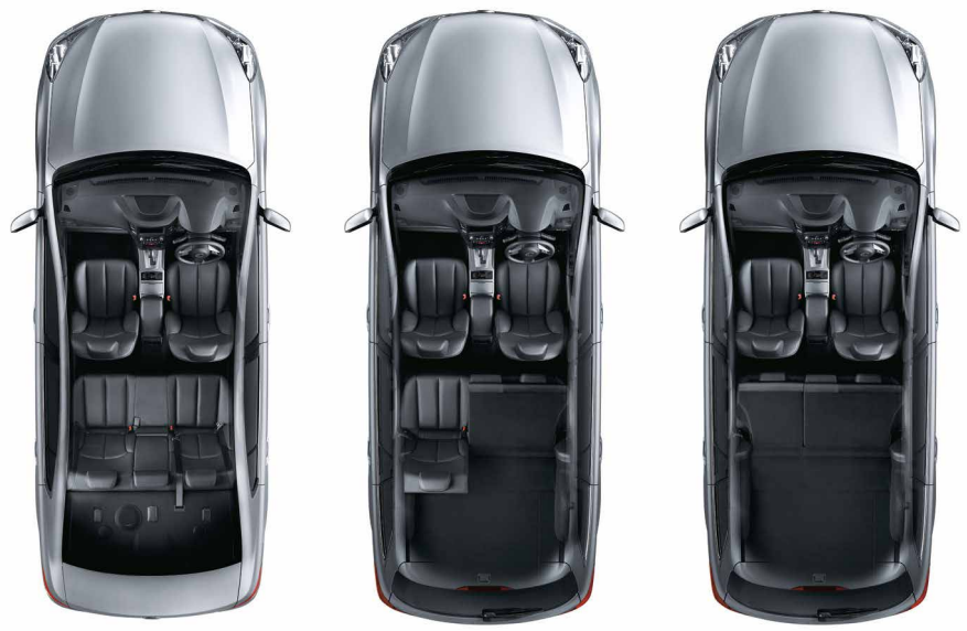
MODELS SHOWN: Liberty 2.5 GT Premium - sedan left, wagon middle and right.

CLOCKWISE: →REAR SEAT ARMREST WITH BOOT ACCESS - SEDAN MODELS. →SEAT BACK NETS. →REAR ARMREST WITH CUP HOLDERS. →WAGON FEATURES 60:40 SPLIT REAR SEATS FOR A RANGE OF PASSENGER AND CARGO CONFIGURATIONS. FOLD DOWN ONE SEAT OR THE ENTIRE SECOND ROW.