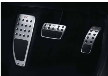
SPORTS PEDAL PAD SET - CVT