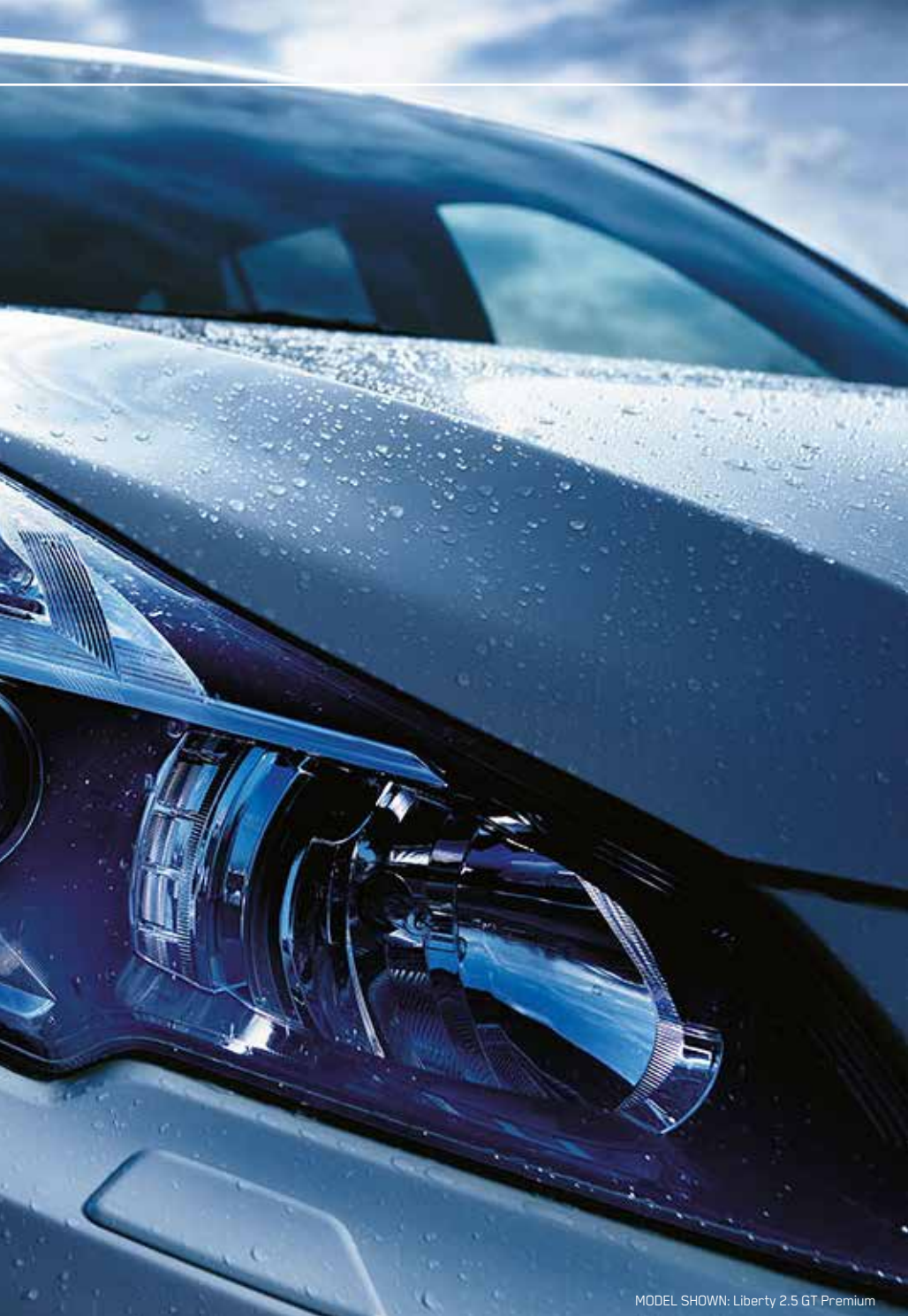
MODEL SHOWN: Liberty 2.5 GT Premium