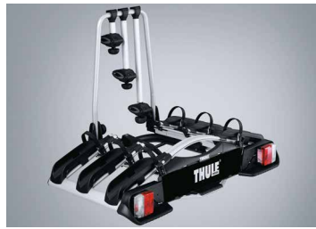
TOWBALL MOUNTED BIKE CARRIER (THREE BIKES)