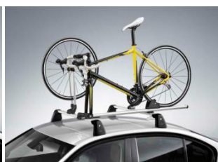
Base support system and Racing cycle holder