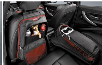
Backrest bag and Storage bag with drinks holder