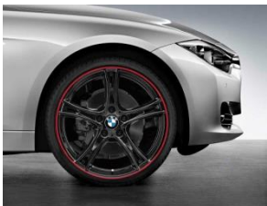
19" Double Spoke 361 Bicolour light-alloy wheels

For more information, please contact your preferred BMW Dealer who will be pleased to advise you on the full range of Genuine BMW Accessories, or visit bmw.com.au/accessories .