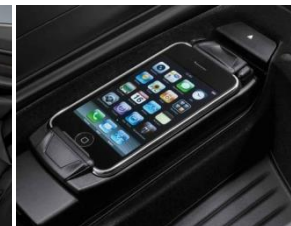
Snap in adaptor for iPhone