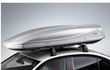
Base support system and Roof Box 460L