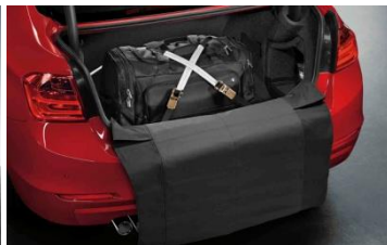
Luggage straps and Loading sill protective mat