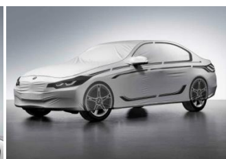
Fitted car cover