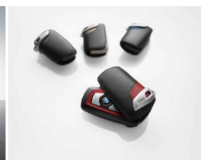
Key Holder – Sport Line