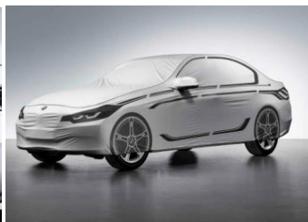
Fitted car cover