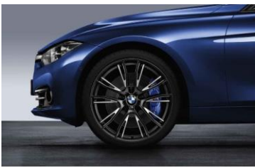
20" BMW M Performance, Double-spoke 624 M, Bicolour light alloy wheels

For more information, please contact your preferred BMW Dealer who will be pleased to advise you on the full range of Genuine BMW Accessories, or visit bmw.com.au/accessories .