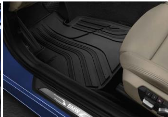
All weather floor mats