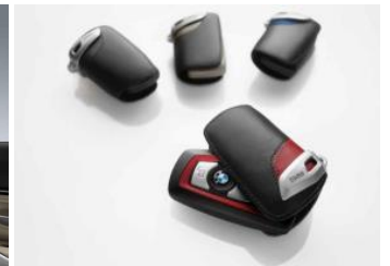
Key Holder – Sports line