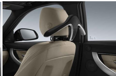
Travel & Comfort Clothes hanger