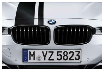
BMW M Performance kidney grilles black high gloss