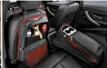
Backrest bag and storage bag with drinks holder