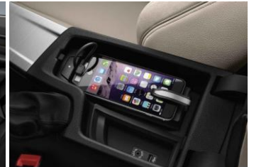
Universal Snap-in adapter