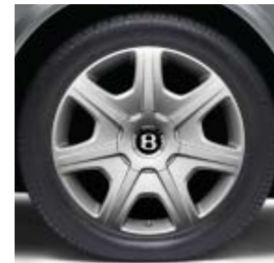
19" 7-SPOKE ALUMINIUM ALLOY (PAINTED)