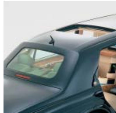
REAR COMPARTMENT ELECTRIC SUNROOF