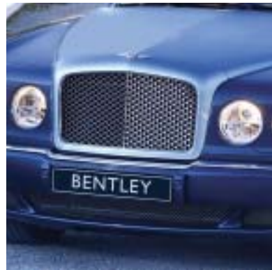
DUO TONE PAINT COMBINATION