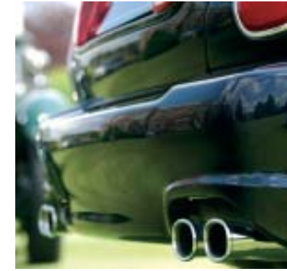
REAR SPORTS BUMPER AND QUAD EXHAUST TAIL PIPE FINISHERS