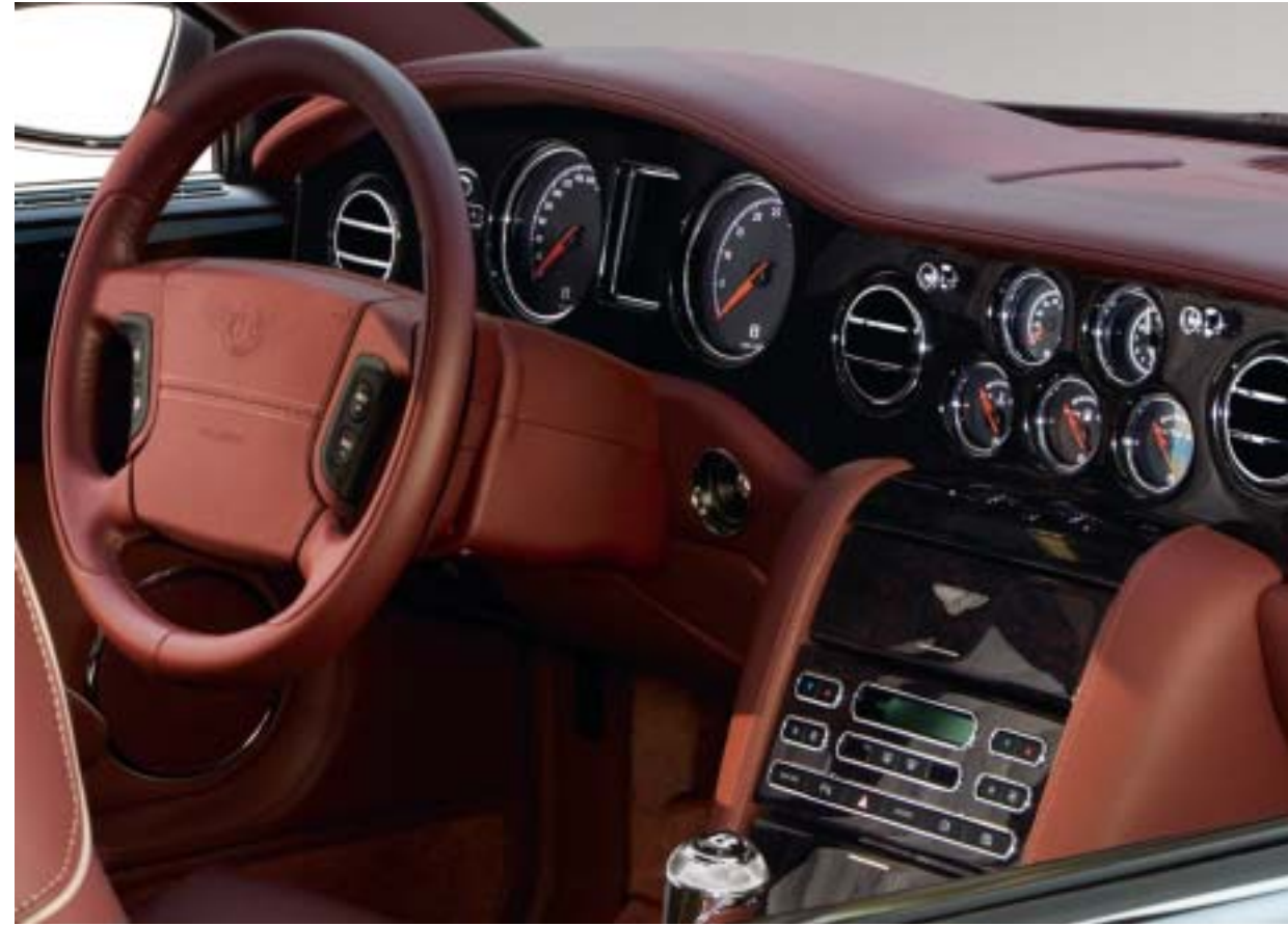
REDWOOD LEATHER HIDE WITH CINDER SANDWICH PIPING