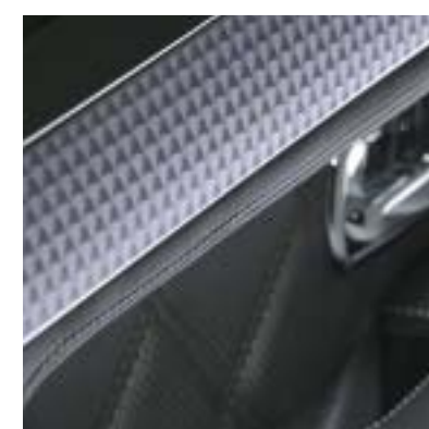
ENGINE-TURNED ALUMINIUM INSERTS TO WAIST RAILS