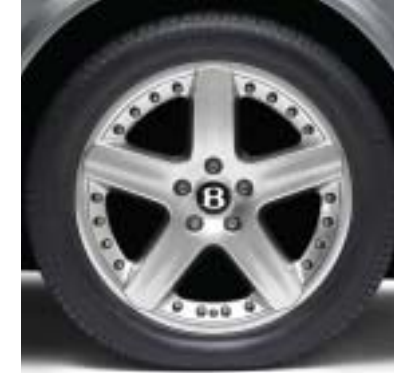
19" 5-SPOKE 2-PIECE 'STAR' ALUMINIUM ALLOY (POLISHED)