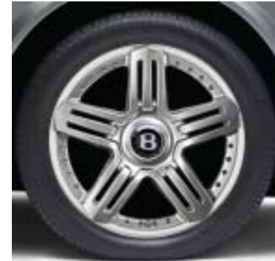
20" 5-SPOKE 2-PIECE ALUMINIUM ALLOY (PAINTED)