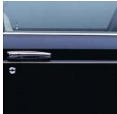
FINE LINES TO EXTERIOR BODYWORK