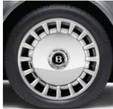
20" 16-SPOKE DISC ALUMINIUM ALLOY (PAINTED)