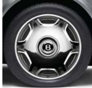
19" 6 TWIN-SPOKE DISC ALUMINIUM ALLOY (CHROMED)