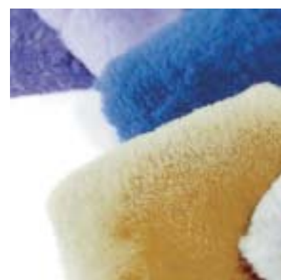
LAMBSWOOL RUGS MATCHED TO CUSTOMER COLOUR SPECIFICATION