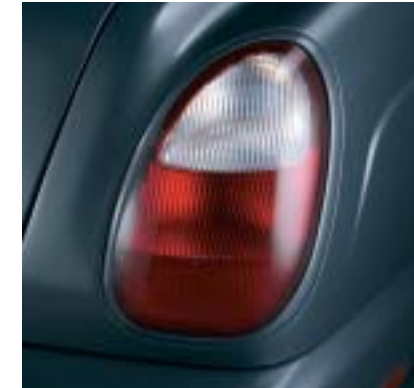
BODY COLOURED LAMP BEZELS

We believe there is always room for that personal touch. When it comes to exterior tailoring you have a wealth of additions available to you. Free your imagination.