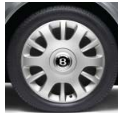
19" 12-SPOKE ALUMINIUM ALLOY (PAINTED)