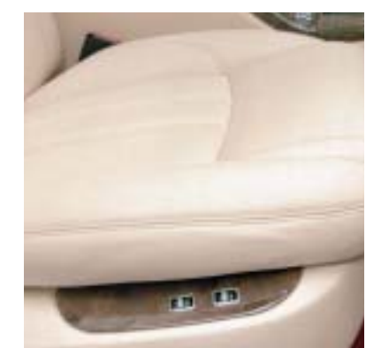
EXTENDED FRONT SEAT CUSHION