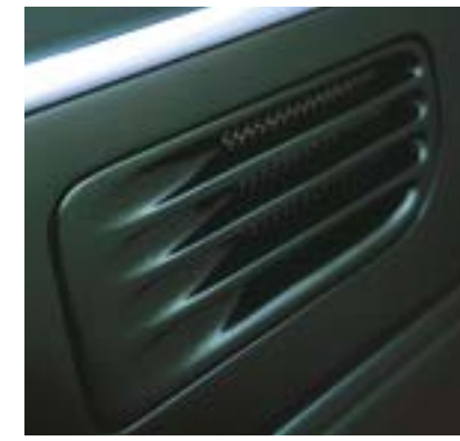
LOWER FRONT WING VENT