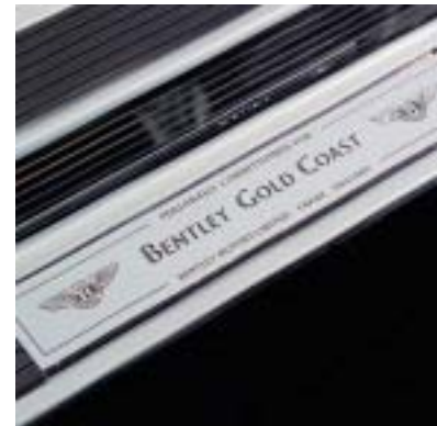
PERSONALISED TREADPLATE PLAQUE