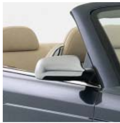
CHROME DOOR MIRROR CAPS