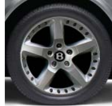
19" 5-SPOKE 2-PIECE SPORTS 'BLADE' ALUMINIUM ALLOY (PAINTED)