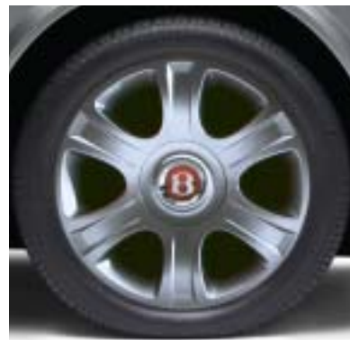
18" 6-SPOKE ALUMINIUM ALLOY (CHROMED)