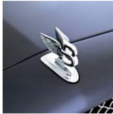
RETRACTABLE FLYING 'B' RADIATOR MASCOT (PAINTED RADIATOR SHELL)