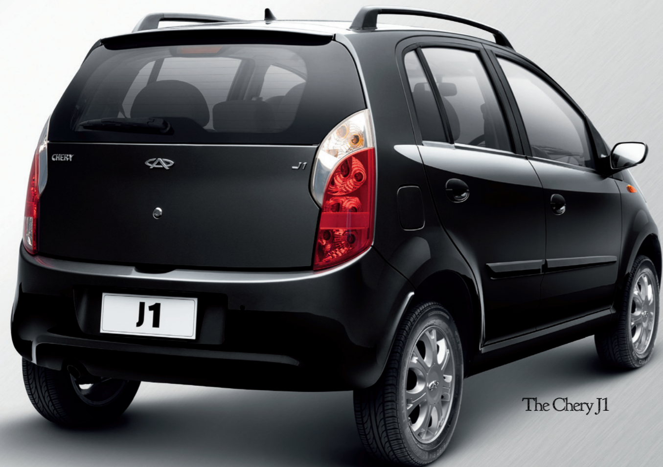
The Chery J1

And every Chery comes with a 3 year/100,000km warranty so when you look at what Chery offers we know you'll be asking yourself one question, Why would you pick anything else?