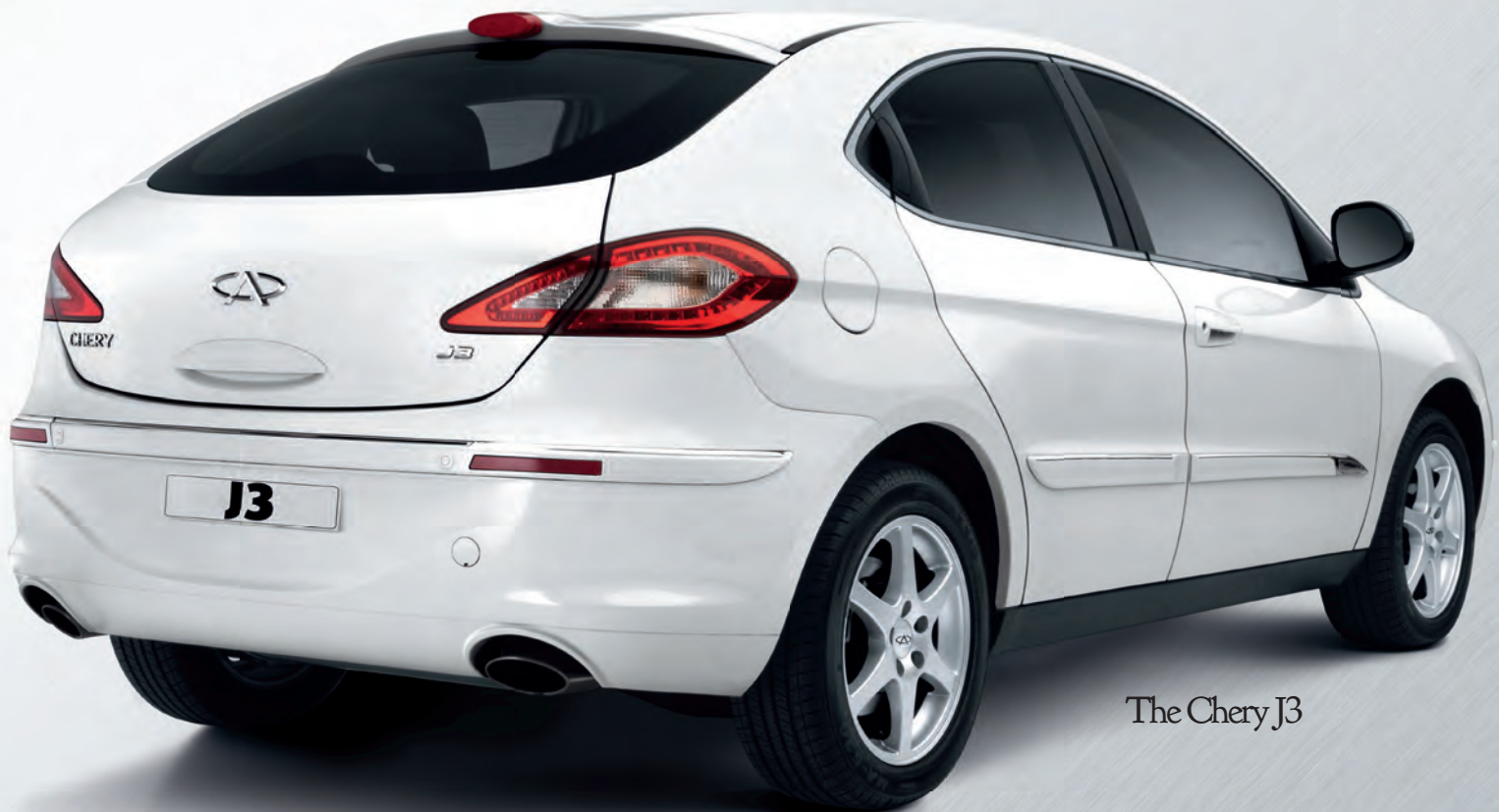
The Chery J3

Every Chery comes with a 3 year/100,000km warranty so when you look at what Chery offers we know you'll be asking yourself one question, Why would you pick anything else?