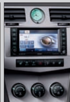
Sebring Limited Instrument Panel