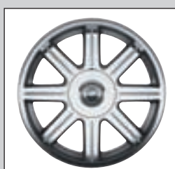
18" Painted Aluminium Wheel