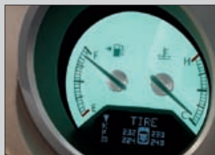
Tyre Pressure Monitoring System