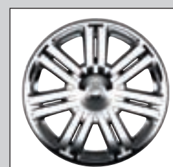
18" Chrome-Clad Aluminium Wheel