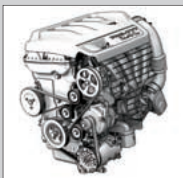
2.4L DOHC Dual VVT