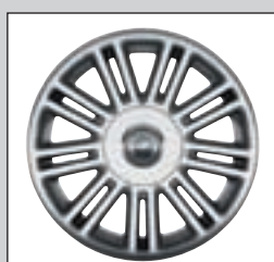
17" Machined Sparkle Painted Aluminium Wheel