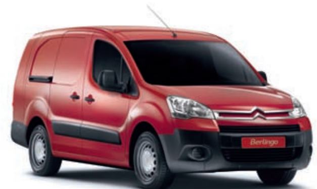
Long body length.