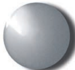
Arctic Steel (M)