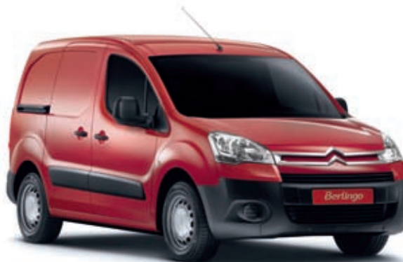
Standard body length.