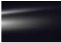
Noir Perla Nera (M)