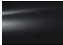
Gris Haria (M)