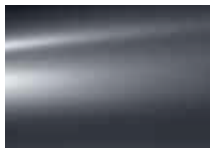
Gris Shark (M)