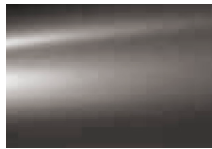
Moka Gris (M)