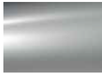
Gris Aluminium (M)