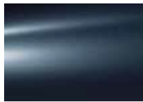
Bourrasque (M) Only on Sedan