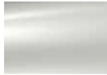
Blanc Nacre (PP)