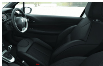
Tissu Akinen Mistral (Black Cloth) - Standard