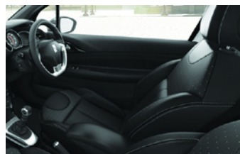
Cuir Claudia Mistral Perfore (Perforated Black Leather Appointed 2 ) - Optional