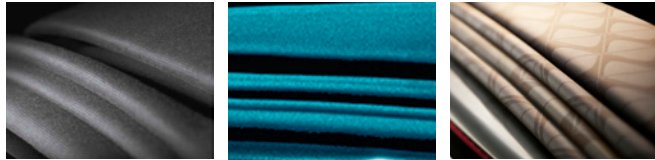
Noir Onyx - Standard