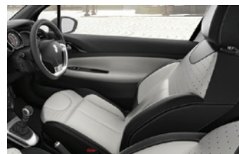
Cuir Claudia Lama Perfore (Perforated Black & Off White Leather Appointed 2 ) - Optional