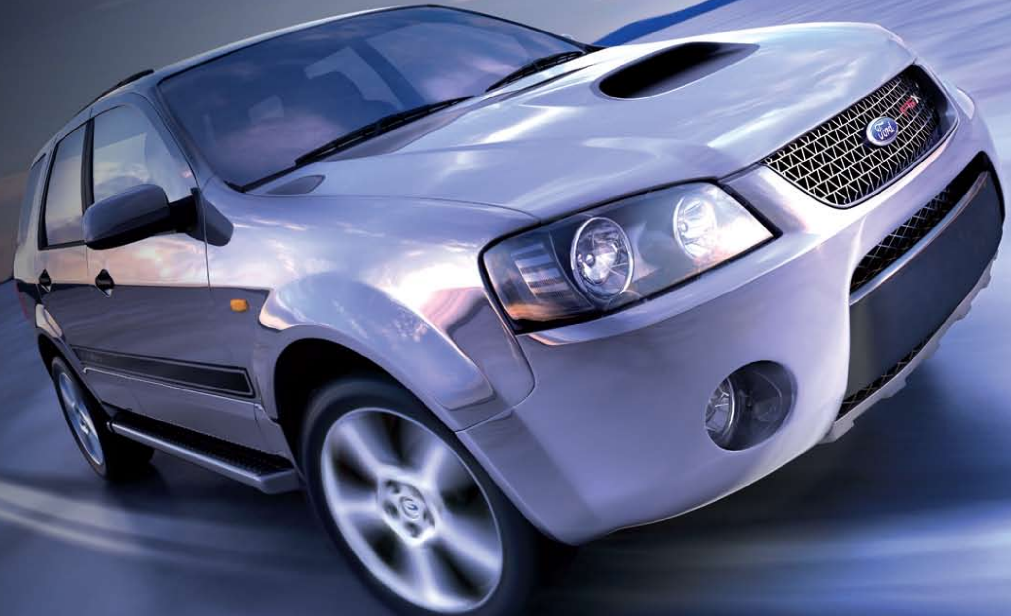
F6X270 shown in Lightning Strike with optional FPV stripe package in Matte Black

A spacious, luxuriously appointed all wheel drive, that is also a high performance, adrenalin pumping, pure driving machine. In a word 'Xtraordinary'.