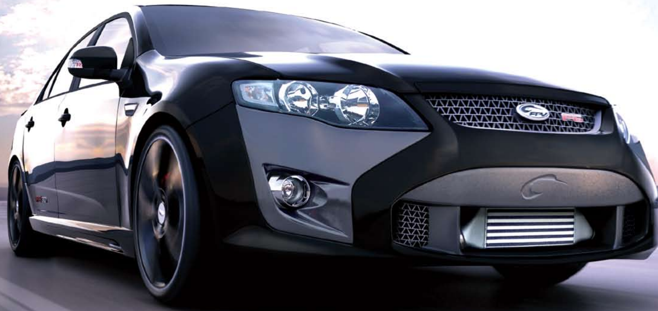
F6310 shown in Silhouette.

With 310kW of power and 565Nm of torque available from just 1950rpm ^ , the all new F6 delivers in-gear acceleration that has to be experienced to be believed. Add to this substantially improved handling dynamics delivering better turn in and ride characteristics and you have one perfectly engineered driving machine. There is no other performance sedan like it, anywhere.