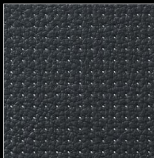
Semi-perforated leather with metallic inlay