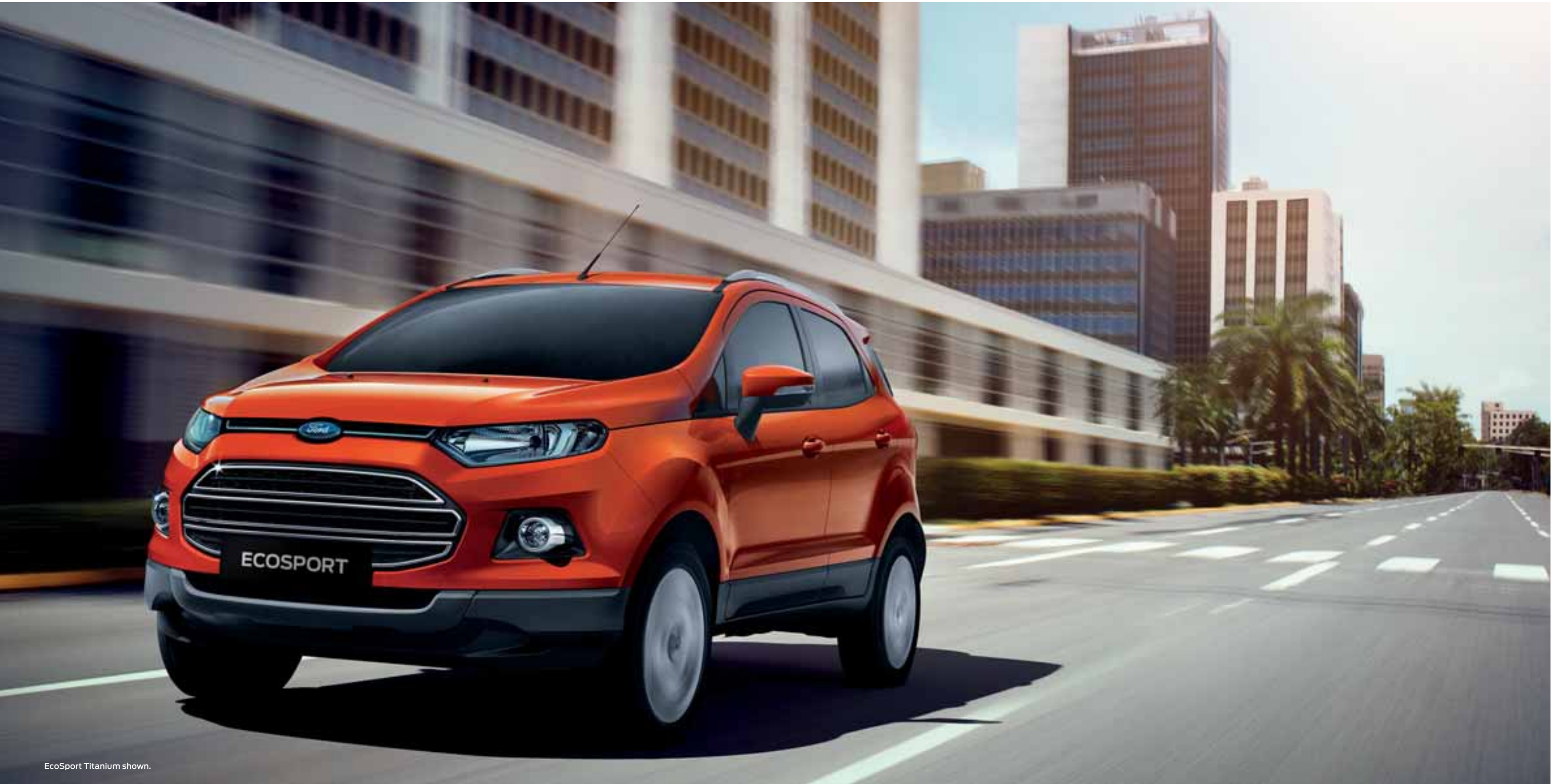
EcoSport Titanium shown.

The city can serve up plenty of challenges — potholes, narrow laneways, rough surfaces, you name it. That's why the EcoSport sits 200mm off the ground so you can tackle all of those challenges with confidence. And with its impressive power, sporty design and confidently stylish finishes, you'll be turning heads for all the right reasons.