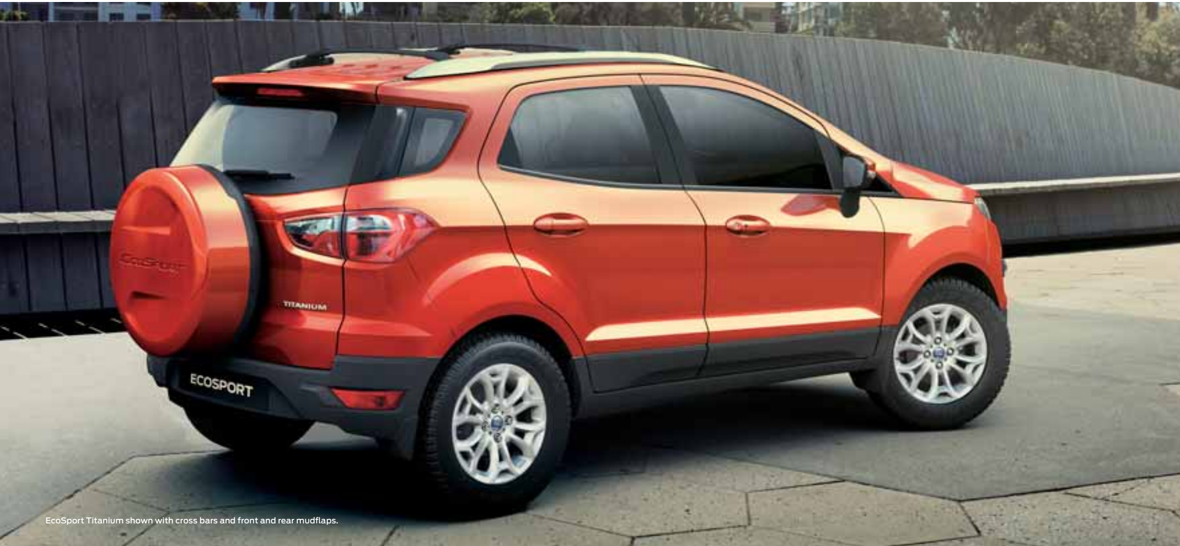
EcoSport Titanium shown with cross bars and front and rear mudflaps.

It's not just an EcoSport – it's your EcoSport. Express yourself with a range of accessories that make any journey uniquely yours.