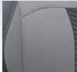
Seat insert: Dali cloth trim in Charcoal Black Seat bolster: Vigo cloth trim in Charcoal Black