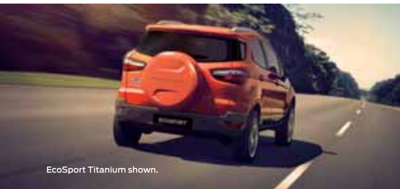
EcoSport Titanium shown.