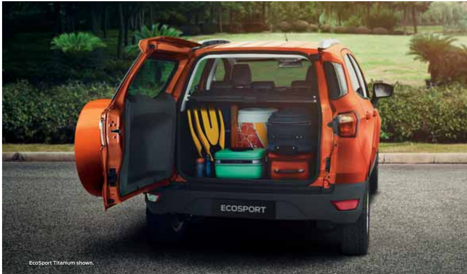
EcoSport Titanium shown.

No matter what the conditions, there'll be no stopping you. The EcoSport puts 200mm of ground clearance between you and potholes, ditches or whatever the road can dish up.