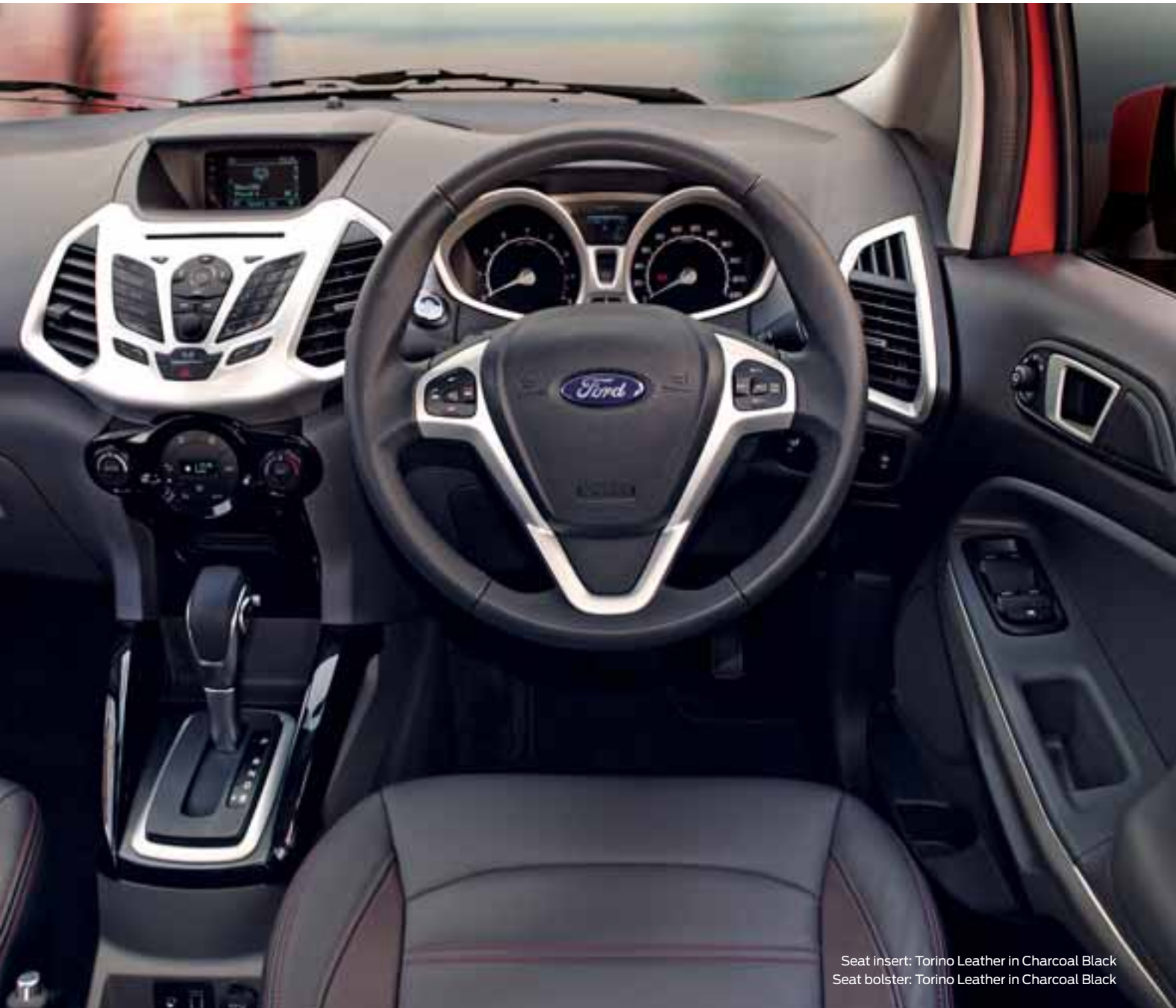
Seat insert: Torino Leather in Charcoal Black Seat bolster: Torino Leather in Charcoal Black