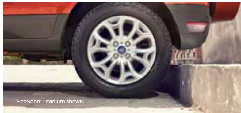
EcoSport Titanium shown.

Enjoy real peace and quiet on the road thanks to the noise reduction materials used in the EcoSport. An acoustic headliner and sound deadening materials in the roof and body, together with a double sealing system in the doors, all help to block out unwanted noise and vibrations.