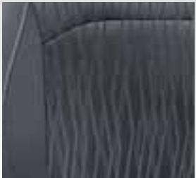
Seat insert: Shanghai cloth trim in Charcoal Black Seat bolster: Vigo cloth trim in Charcoal Black