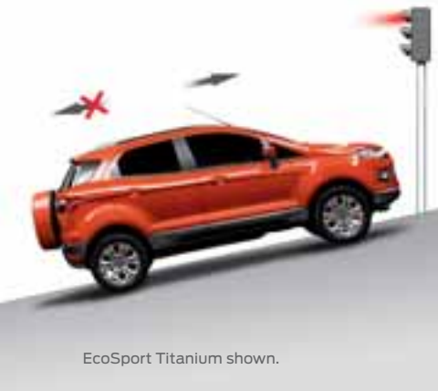
EcoSport Titanium shown.