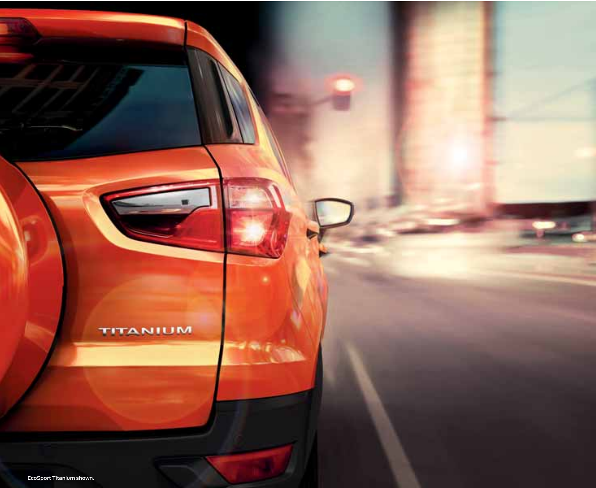
EcoSport Titanium shown.

The EcoSport is engineered to give you more of what you need, and less of what you don't. That means a focus on delivering greater efficiency, without compromising on driving enjoyment.