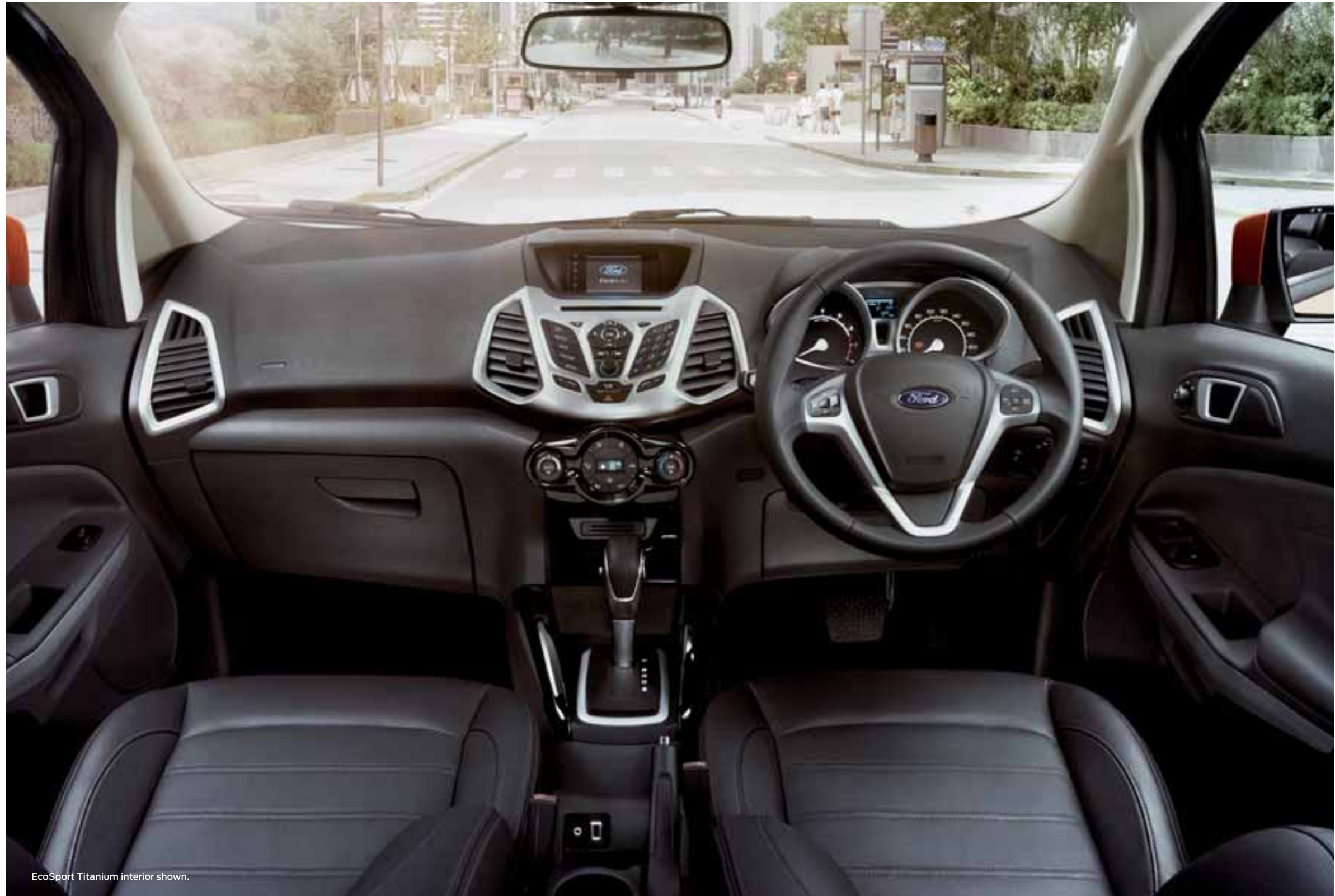
EcoSport Titanium interior shown.