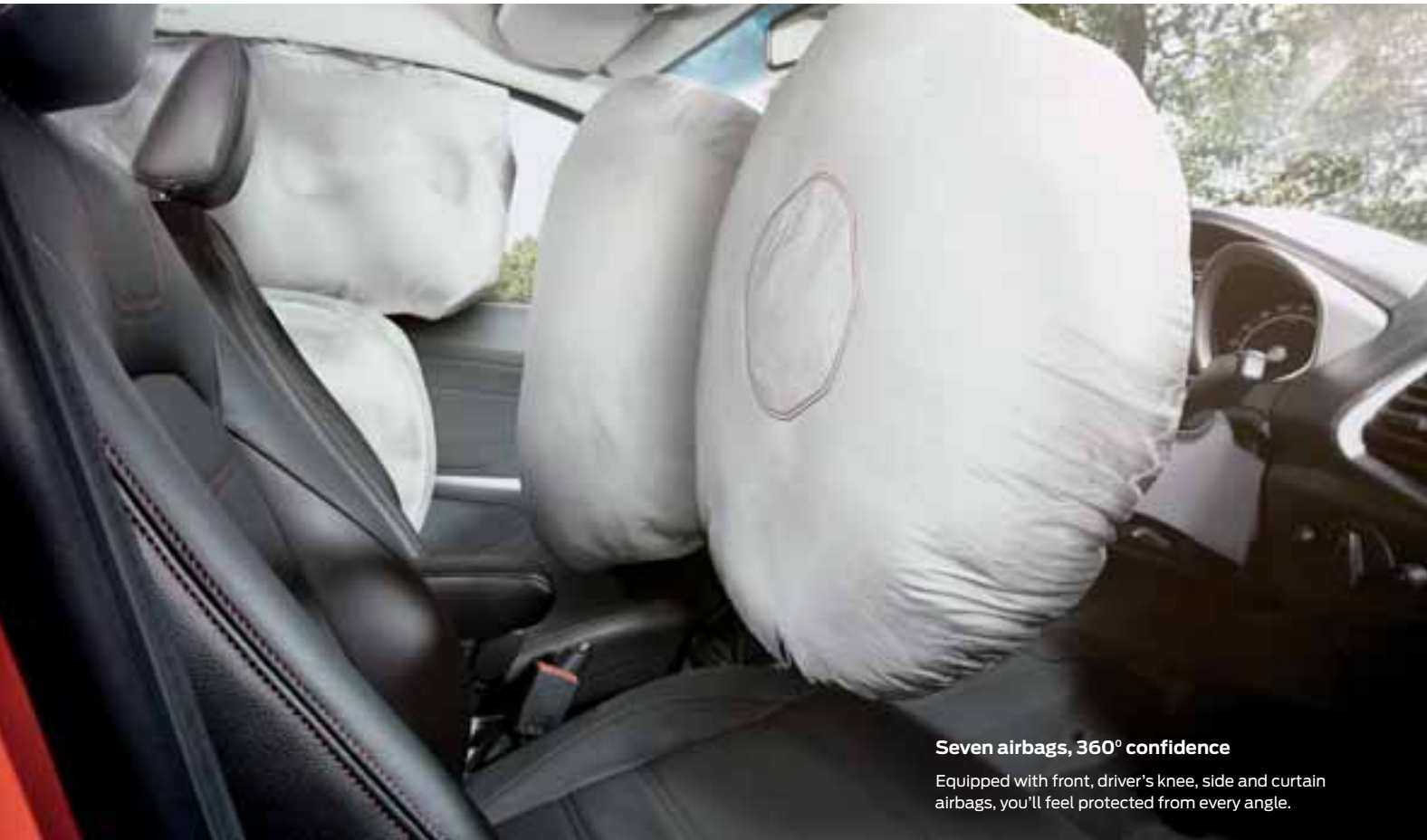
Seven airbags, 360° confidence Equipped with front, driver's knee, side and curtain airbags, you'll feel protected from every angle.