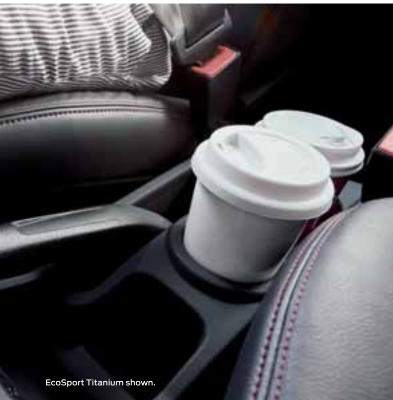
EcoSport Titanium shown.